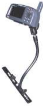
RAM-B-131-G1 RAM AIRCRAFT SEAT RAIL MOUNT FOR GPS