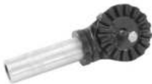
RAM-D-162PU RAM RATCHET FEATURE WITH 1" MALE POST