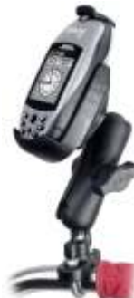
RAM-B-149Z-MA5 RAM U-BOLT MOUNT FOR THE MAGELLAN EXPLORIST SERIES