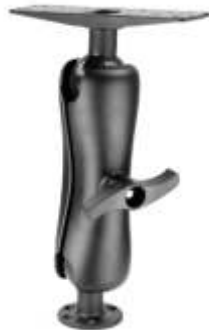
RAM-E-111U RAM MOUNT WITH 3" X 11" BASE & 3 3/4" BASE