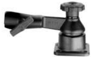
RAM-109HS-4U RAM STRAIT SWING ARM WITH HORIZONTAL BASE