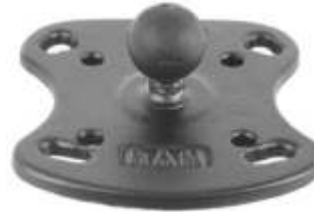
RAM-B-107B RAM 1" BASE FOR HUMMINBIRD & APELCO 97