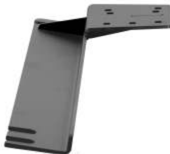
RAM-VB-156 VEHICLE BASE FOR THE 2005- NEWER KIA OPTIMA & HYUNDA