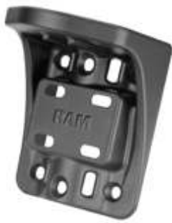
RAM-109V-B RAM VERTICAL SWING ARM MOUNTING BRACKET