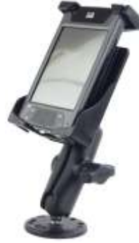
RAM-B-138-PD1U RAM MOUNT WITH UNIVERSAL PDA CRADLE