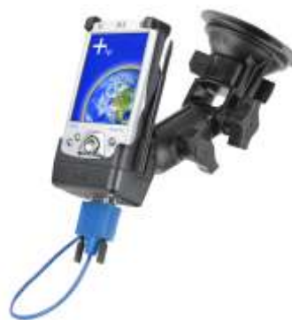
RAP-B-104-224-CO3P RAM RATCHET/PIVOT MOUNT FOR THE POWERED DOCK HP IPAQ 2000 SERIES