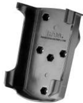
RAM-HOL-CO1 RAM CUSTOM CRADLE HP IPAQ DOUBLE SLOTS