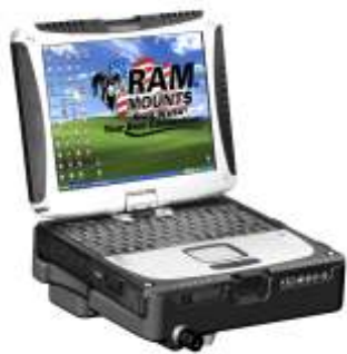
RAM-234-PAN2M RAM PANASONIC LAPTOP MOUNT CF-18 TOUGH TRAY METAL