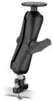
RAM-101U-IP1 RAM MOUNT WITH 202 & 231 BASE & ZINC U-BOLT