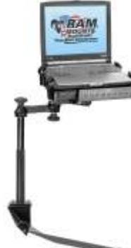
RAM-VB-144-SW1 VEHICLE SYSTEM FOR THE 2006- NEWER KIA SORENTO