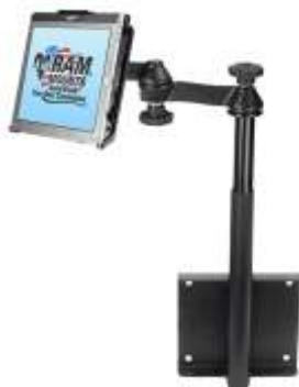
RAM-VBD-128-MOT4 RAM UNIVERSAL DRILL TYPE FLAT VERTICAL BASE