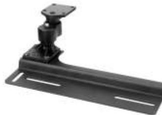
RAM-VB-146 VEHICLE BASE FOR THE 2006-NEWER DODGE CARAVAN