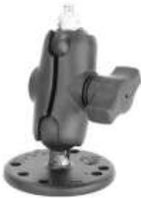
RAM-B-101-A-237U RAM MOUNT WITH 1 1/4"-20 BASE & 1 SHORT ARM