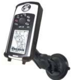
RAM-B-166-GA6 RAM SUCTION MOUNT FOR THE GARMIN 76 & 76CSX