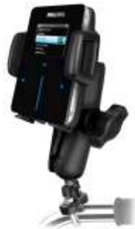
RAM-B-149Z-UN3 RAM UNIVERSAL RAIL MOUNT FOR MEDIUM SIZE DEVICES