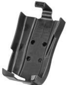
RAM-HOL-PA1 RAM PANASONIC HOLDER