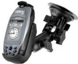
RAP-B-104-224-MA5 RAM RATCHET/PIVOT MOUNT FOR THE MAGELLAN EXPLORIST SERIES