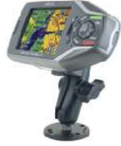
RAM-B-101-MA4 RAM MOUNT MAGELLAN ROADMATE