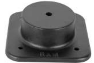
RAM-D-162HU RAM HORIZONTAL RATCHET SWING ARM BASE