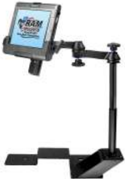
RAM-VB-109-MOT1 VEHICLE SYSTEM FOR THE 2004-NEWER F150