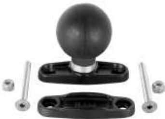
RAM-D-247U-15 RAM CLAMP BASE WITH BALL 1.5" MAXIMUM WIDTH