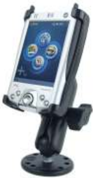
RAM-B-138-CO3 RAM MOUNT FOR HP IPAQ 2000 SERIES