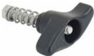
RAM-2-1M RAM METAL KNOB, BOLT, WASHERS & SPRING