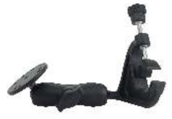
RAM-B-121U RAM YOKE MOUNT WITH BALL & ARM ASSEMBLY