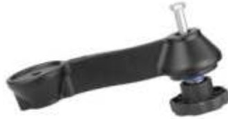
RAM-109-1ASU RAM SINGLE SWING ARM STRAIT EXTENTION