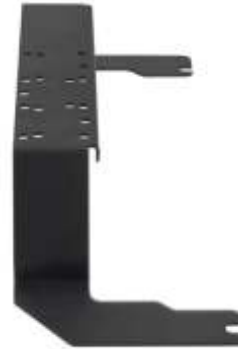
RAM-VB-103 VEHICLE BASE FOR THE 1500, 2500, 3500 SILVERADO