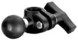
RAM-330U RAM 1/2" PIPE CLAMP WITH 1 1/2" BALL