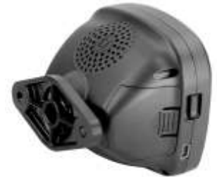
RAM-HOL-GA22 RAM ADAPTER FOR THE GARMIN STREETPILOT I SERIES