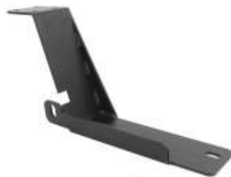
RAM-VB-112 VEHICLE BASE FOR THE 2002-NEWER EXPLORER