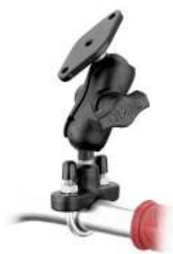
RAM-B-149ZAU RAM RAIL MOUNT WITH A SIZE ARMS