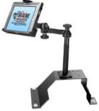
RAM-VB-107-MOT3 VEHICLE SYSTEM FOR THE 1990-95 CAPRICE & 1991 CROWN VIC