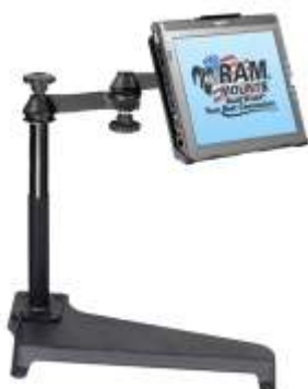
RAM-VB-137-MOT4 VEHICLE SYSTEM FOR THE 2006- NEWER TOYOTA CAMRY