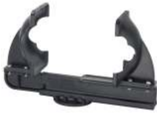
RAM-HOL-QD1U RAM QUICK DRAW SCANNER GUN HOLDER