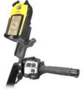
RAM-B-174-GA5 RAM BRAKE/CLUTCH RESERVOIR FOR THE GARMIN E-TREX