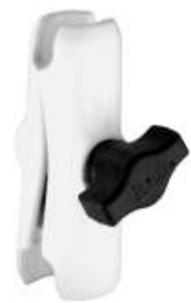
RAM-B-201WU WHITE RAM DOUBLE SOCKET ARM FOR 1" BALL