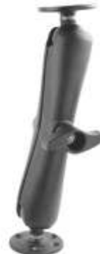
RAM-D-101U-C-HY1 RAM MOUNT SHORT WITH 2" RAIL & 2" PLATE