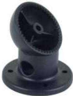
RAP-288FU RAM 45 DEGREE ADJUSTABLE BASE WITH FLANGES