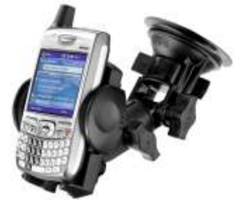
RAP-B-104-224-UN1 RAM UNIVERSAL RATCHET/PIVOT MOUNT FOR SMALL SIZE DEVICES