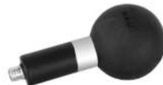
RAM-239 RAM BALL WITH 5/16"-18 POST (NET SAFETY)