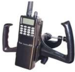
RAM-B-125-BC1 RAM YOKE MOUNT WITH CRADLE FOR BELT CLIPS