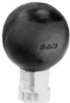
RAM-B-260U RAM 1" BALL WITH #10-24 THREADED HOLE