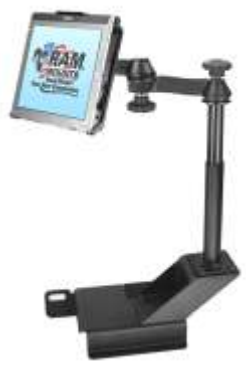
RAM-VB-113-MOT4 VEHICLE SYSTEM FOR THE 1994-NEWER RANGER