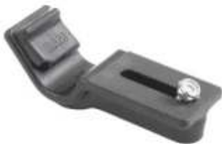
RAM-234KU RAM UNIVERSAL LAPTOP TRAY SIDE KEEPER