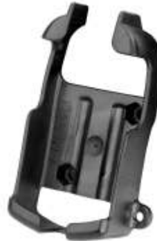
RAM-HOL-GA16 RAM HOLDER GARMIN FOR THE ETREX COLOR