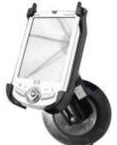
RAM-B-148-CO4 RAM SUCTION MOUNT FOR THE 1900 AND 4100 SERIES