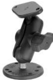
RAM-B-138U-A RAM MOUNT WITH 2.47 DIAMETER 2.47/1.31 BASE WITH A LENGTH ARM