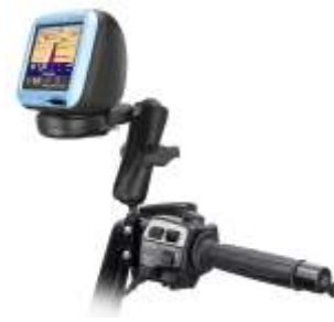
RAM-B-174-TO1 RAM BRAKE/CLUTCH RESERVOIR FOR THE TOMTOM GO