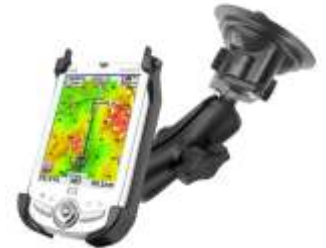
RAM-B-166-CO4 RAM SUCTION MOUNT FOR THE HP IPAQ 1900 & 4100 SERIES