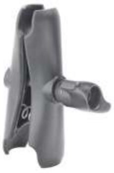
RAM-201MU DOUBLE SOCKET ARM WITH METAL KNOB