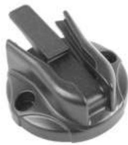
RAP-271-STU RAM SURFACE BASE WITH QUICK SNAP