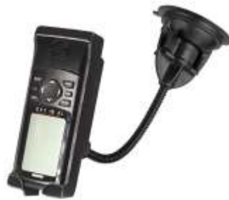
RAP-105-6224-GA1 RAM FLEX ARM MOUNT FOR THE GARMIN GPS 12 SERIES