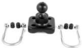
RAM-B-235U RAM DOUBLE U-BOLT BASE WITH 1" BALL