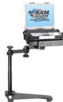
RAM-VB-139-SW1 VEHICLE SYSTEM FOR THE 2004- NEWER HONDA ACCORD