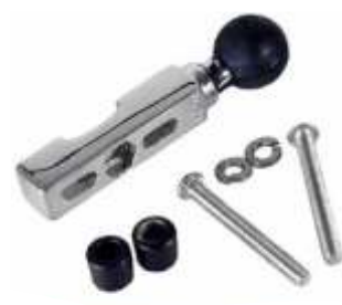
RAM-B-309-1CHU CHROME RAM CYCLE HANDLEBAR BASE WITH 1 BALL