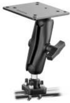
RAM-334U RAM MOUNT WITH RAM-2461 & 1 RAM-235