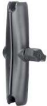
RAM-B-201-C RAM DOUBLE SOCKET ARM B BALL C LENGTH