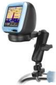
RAM-B-149Z-TO1U RAM U-BOLT MOUNT FOR THE TOMTOM GO