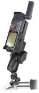
RAM-B-149Z-GA3 RAM U-BOLT MOUNT FOR THE GARMIN 48,45,89 & 90