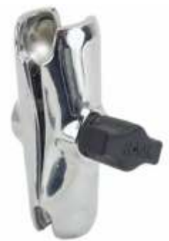
RAM-B-201CHU CHROME RAM DOUBLE SOCKET ARM FOR 1" BALL