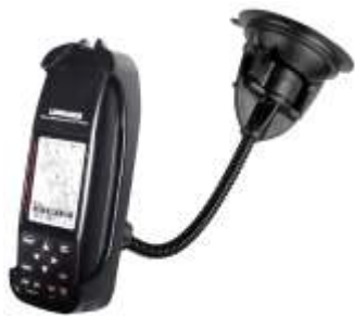
RAP-105-6224-LO1 RAM FLEX ARM MOUNT FOR THE LOWRANCE GLOBALMAP