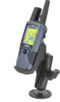
RAM-B-138-GA20 RAM MOUNT FOR GARMIN RINO 520 AND 530