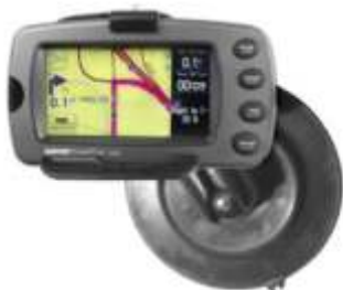
RAM-B-148-GA9 RAM SUCTION MOUNT FOR THE GARMIN 2610