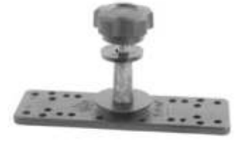
RAM-111BTU RAM BASE 6.25 X 2 TAPPED FOR SWING