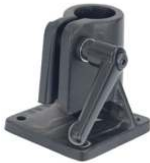
RAM-D-299-SBU RAM 3.5" X 3.5" BASE WITH 1" PIPE FEMALE