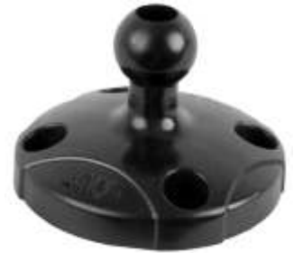
RAP-SB-202 RAM 2.5" DIAMETER BASE WITH MALE SNAP LINK