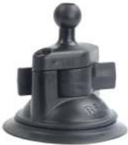
RAP-AA-224-1 RAM SUCTION CUP WITH SNAP LINK BALL