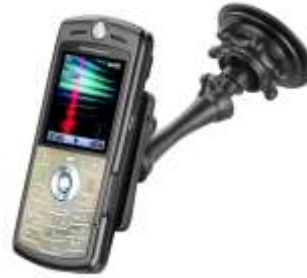
RAP-AA-167-300 RAM SNAP LINK POWER PLATE III MOUNT