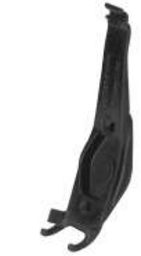
RAM-HOL-LO5 RAM HOLDER FOR THE LOWRANCE IFINDER GO SERIES