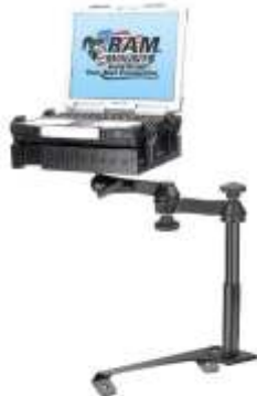
RAM-VB-166-SW1 VEHICLE SYSTEM FOR THE 2006- NEWER FORD EXPEDITION