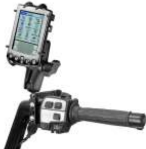
RAM-B-174-PD3 RAM BRAKE/CLUTCH RESERVOIR UNIVERSAL PDA