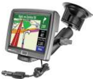
RAM-B-166-G3U RAM SUCTION MOUNT FOR THE GARMIN 7200