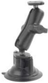
RAM-B-102-2241U RAM MOUNT WITH B-102 & 224-1