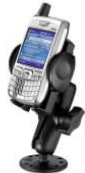
RAM-B-138-UN1 RAM UNIVERSAL MOUNT FOR SMALL SIZE DEVICES