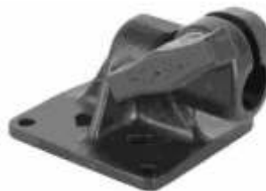
RAM-2461HU RAM SMALL 75 MM VESA PLATE WITH 1/2" HOLE