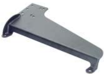
RAM-VB-137 VEHICLE BASE 2006 - TOYOTA CAMRY