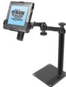
RAM-VBD-125-MOT1 VEHICLE SYSTEM CHEVY PICKUP