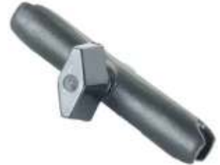
RAM-A-201U-B RAM DOUBLE SOCKET EXTRA LONG ARM