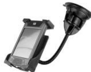
RAP-105-6224-PD1 RAM FLEX ARM MOUNT WITH UNIVERSAL PDA CRADLE