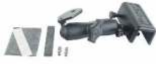
RAM-B-126BU RAM WINDSHIELD MIRROR BRACKET