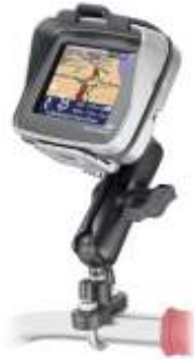
RAM-B-149Z-TO2 RAM RAIL MOUNT FOR THE TOMTOM RIDER