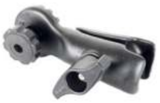
RAM-162BAU RAM RATCHET BASE WITH SINGLE SOCKET ARM