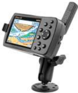
RAM-B-138-GA7 RAM MOUNT FOR GARMIN GPS 176