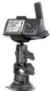
RAP-B-104-224-GA2 RAM RATCHET/PIVOT MOUNT FOR THE GARMIN 2, 3 & 5