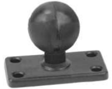
RAM-202U-153 RAM BASE 1.5" X 3" WITH 1 1/2" BALL