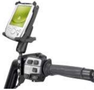
RAM-B-174-DE1 RAM BRAKE/CLUTCH RESERVOIR FOR THE DELL XIM X5