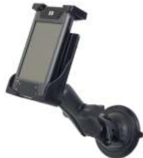
RAM-B-166-PD1 RAM SUCTION MOUNT WITH UNIVERSAL PDA CRADLE