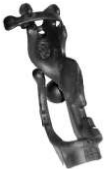
RAM-117B RAM-ROD FISHING ROD HOLDER