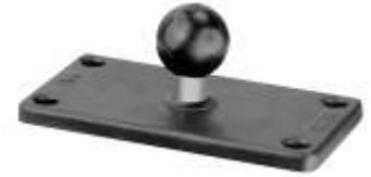
RAM-B-202U-24 RAM BASE 2" X 4" WITH 1" BALL