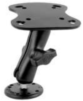
RAM-B-107 RAM MOUNT HUMMINBIRD & APELCO 1" BALL