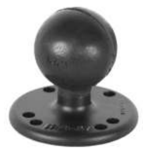
RAM-202 RAM 2-1/2" DIAMETER BASE