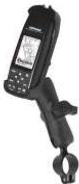
RAP-B-149-LO2U RAM RAIL MOUNT FOR THE LOWRANCE I-FINDER