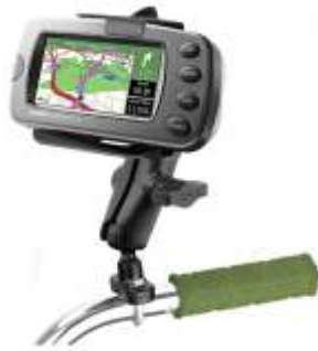
RAM-B-149Z-GA9 RAM RAIL MOUNT FOR THE GARMIN 2610