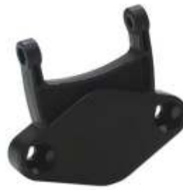
RAM-HOL-GA11U RAM ADAPTER FOR GARMIN BASES