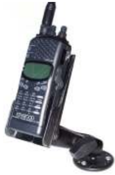
RAM-B-138-BC1 RAM MOUNT WITH BELT CLIP HOLDER HAND-HELD