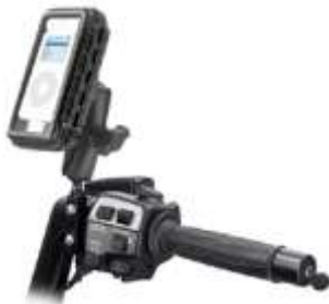
RAM-B-174-AQ2 RAM BRAKE/CLUTCH RESERVOIR MEDIUM SIZE AQUA BOX