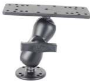
RAM-111U-B RAM MOUNT WITH 1.5" BALLS B LENGTH ARM