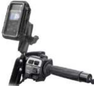
RAM-B-174-AQ3 RAM BRAKE/CLUTCH RESERVOIR SMALL SIZE AQUA BOX