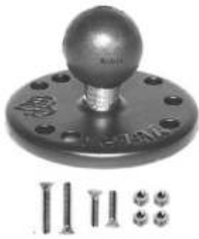
RAM-B-202-G3U RAM BASE & BALL WITH GARMIN MOUNTING HARDWARE