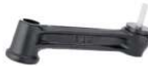
RAM-109U-G3 6" SWING ARM EXTENSION