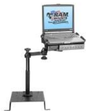
RAM-VB-115-SW1 VEHICLE SYSTEM FOR THE 1995-NEWER TAURUS