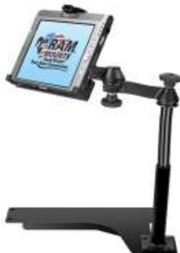
RAM-VB-157-MOT3 VEHICLE SYSTEM FOR THE 2006- NEWER CHEVY MALIBU