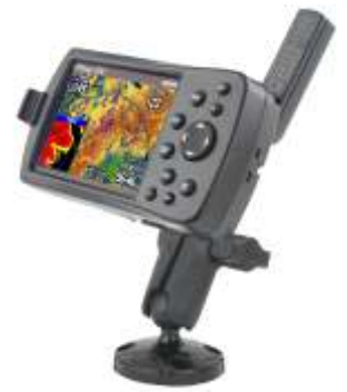
RAP-B-138-GA7 RAM MOUNT FOR THE GARMIN 176, 276 & 296