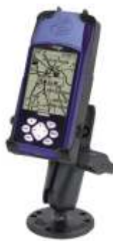
RAM-B-138-GA4 RAM MOUNT FOR GARMIN E-MAP