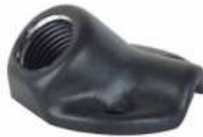
RAM-232-45 RAM 2 1/2" DIAMETER BASE WITH 1/2" NPT HOLE 45 DEGREE