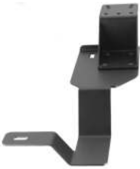
RAM-VB-101 VEHICLE BASE FOR THE 1995-NEWER SONOMA BLAZER & S10 JIMMY