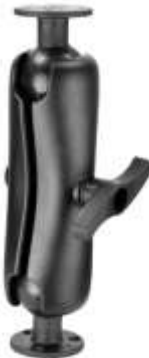
RAM-E-101U RAM MOUNT WITH 2-3.68 BASES WITH BALLS