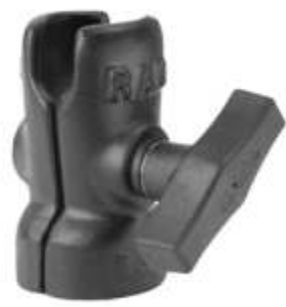
RAM-200-10FU RAM 1 1/2" SOCKET ARM WITHOUT OCTAGON FEMALE HOLE