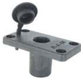
RAM-114FM RAM ROD 2000 FLUSH MOUNT BASE