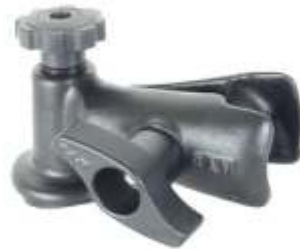
RAM-D-162SAU RAM SWIVEL BASE WITH SINGLE SOCKET ARM