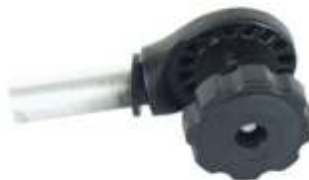
RAM-285U RAM MALE 1/2" PIPE WITH FEMALE TEETH ADJUSTABLE DESIGN