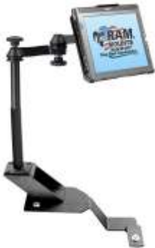
RAM-VB-102-MOT4 VEHICLE SYSTEM FOR THE 2000-NEWER 2500 & 3500 SUBURBAN