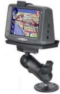
RAM-B-138-LO7 RAM MOUNT FOR THE LOWRANCE IWAY 350C