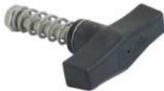
RAM-2-1U RAM T HANDLE, BOLT, WASHER & SPRING