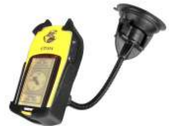
RAP-105-6224-GA5 RAM FLEX ARM MOUNT FOR THE GARMIN E-TREX