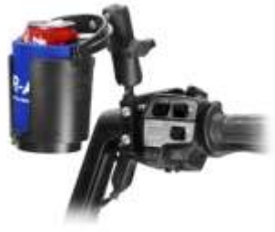
RAM-B-132-309U RAM DRINK CUP HOLDER WITH GOLDWING