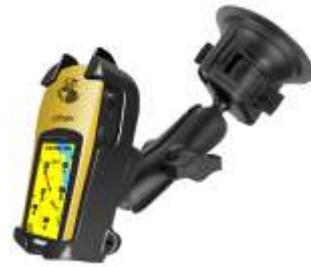
RAM-B-149Z-GA16 RAM SUCTION MOUNT FOR THE GARMIN ETREX COLOR