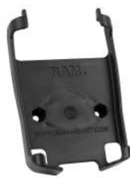
RAM-HOL-CO3U RAM HOLDER FOR THE HP IPAQ 2000 SERIES