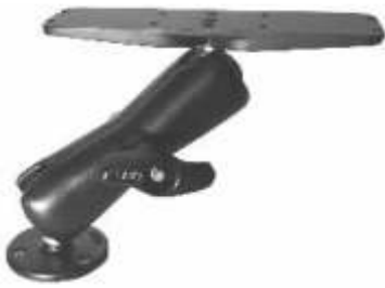
RAM-D-111U RAM MOUNT WITH 3" X 11" BASE & 3/4" BASE