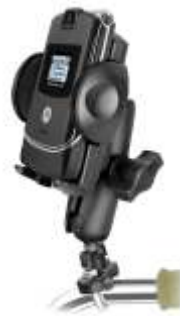
RAM-B-149Z-UN1 RAM UNIVERSAL RAIL MOUNT FOR SMALL SIZE DEVICES