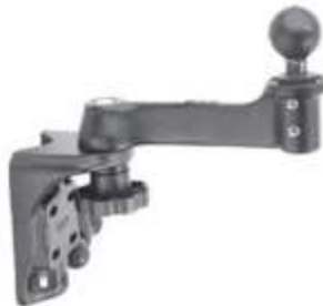
RAM-109V-2BU RAM SWING ARM SYSTEM WITHOUT DOUBLE ARM AND VERTICAL BASE