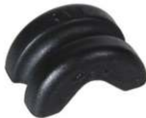
RAP-319U RAM-U-BOLT ADAPTER FOR HANDLEBARS