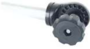
RAM-D-285U RAM 1" MALE PIPE WITH F TEETH ADJUSTABLE DESIGN