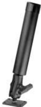
RAM-119-23U RAM TUBE FISHING ROD HOLDER WITH 2 X 3 BASE