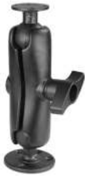
RAM-D-101-254U RAM MOUNT WITH 3.68 BASE & 2.5 BASE