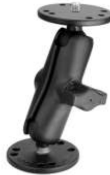
RAM-B-101A RAM 1" MOUNT WITH 2 BASES ONE WITH 1/4-20 STUD