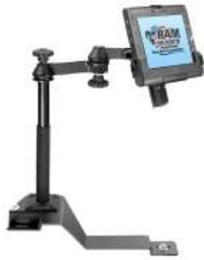
RAM-VB-114-MOT1 VEHICLE SYSTEM FOR THE 2002-NEWER TRAIL BLAZER & ENVOY