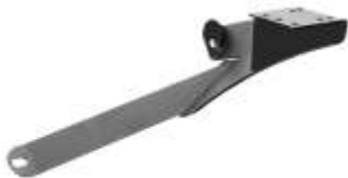
RAM-VB-144 VEHICLE BASE FOR THE 2006-NEWER KIA SORENTO