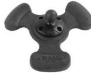
RAP-279U-LO5 RAM WEIGHTED BASE WITH BALL