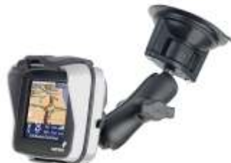
RAM-B-166-TO2U UNPKD RAM SUCTION MOUNT FOR THE TOMTOM RIDER