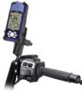
RAM-B-174-GA4 RAM BRAKE/CLUTCH RESERVOIR FOR THE GARMIN E-MAP