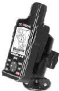
RAM-B-138-MA1 RAM MOUNT FOR THE MAGELLAN 12,300,315,320