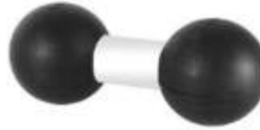
RAM-D-230U RAM DOUBLE 2 1/4" BALL ADAPTER