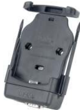
RAM-HOL-CO3P RAM POWERED DOCK FOR THE HP IPAQ 2200 SERIES