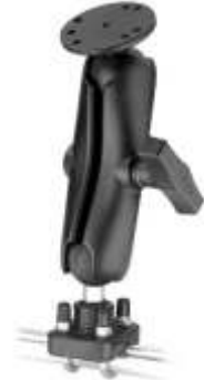
RAM-101U-235 RAM MOUNT WITH 2 RAM-202 & 1 RAM-235