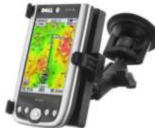
RAP-B-166-PD2U RAM SUCTION SYSTEM PDA WITH FEET