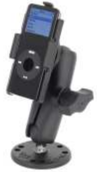
RAM-B-138-AP2 RAM MOUNT WITH 2 7/16" BASE FOR APPLE IPOD NANO