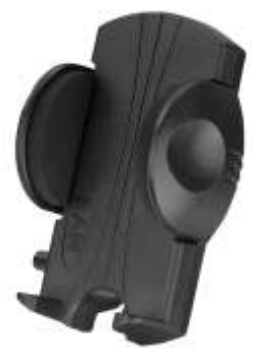
RAM-HOL-UN1 RAM SMALL BLACK MOBILE PHONE HOLDER