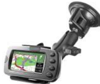
RAM-B-166-GA9 RAM SUCTION MOUNT FOR THE GARMIN 2610