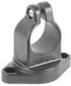
RAP-274 RAM RAIL MOUNT BASE WITH SWIVEL FEATURE