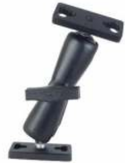
RAM-151 RAM MOUNT FOR BOSCH RAIL STRUCTURES