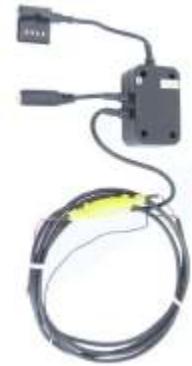
RAM-QPAC1 RAM QUEST POWER AUDIO CABLE BARE WIRE