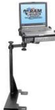
RAM-VB-119-SW1 VEHICLE SYSTEM FOR THE 1995- NEWER ECONOLINE VAN