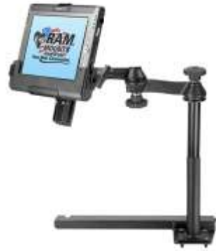
RAM-VB-149-SW1 VEHICLE SYSTEM FOR THE 2005- NEWER TOYOTA HIGHLANDER