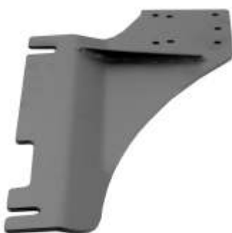
RAM-VB-160 VEHICLE BASE FOR THE 2006- NEWER CHEVY IMPALA