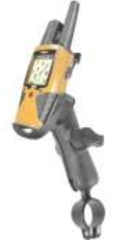
RAP-B-149-GA8 RAM RAIL MOUNT FOR THE GARMIN RINO