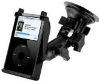
RAP-B-104-224-AP1 RAM RATCHET/PIVOT MOUNT FOR THE APPLE IPOD