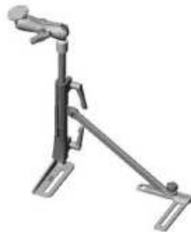
RAM-160BU RAM SEAT RAIL SYSTEM WITH 18"