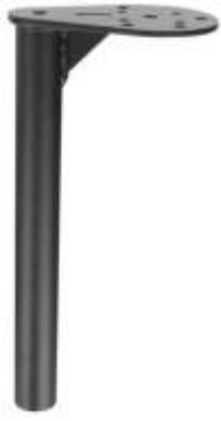
RAM-VP-TTMF12U RAM TELE-POLE BASE MALE WITH FLANGE 12" LONG