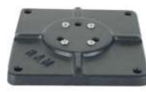
RAM-255U 6" X 6" BASE PLATE WITH 11 HOLES