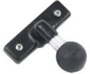
RAM-B-145B RAM BASE WITH 1" BALL FOR THE GARMIN STREETPILOT