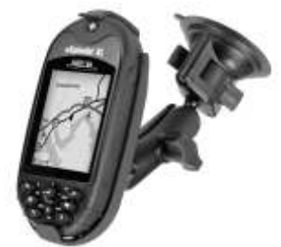
RAM-B-166-MA6 RAM SUCTION MOUNT FOR THE MAGELLAN EXPLORIST XL