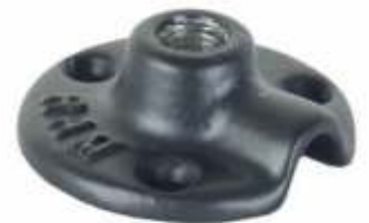
RAM-B-232-90 RAM 2 1/2" DIAMETER BASE WITH 1/4" NPT HOLE 90 DEGREE