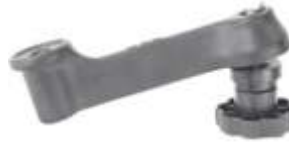
RAM-109-1ATPU RAM SNGLE SWING ARM NO BEND