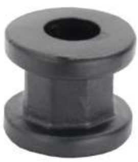
RAM-D-280U RAM DOUBLE THICK OCTAGON BUTTON