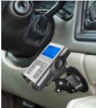
RAP-SB-178-UN1 FLEX BASE SYSTEM WITH UNIVERSAL SMALL HOLDER