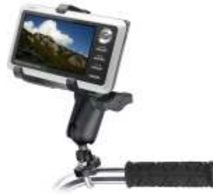
RAM-B-149Z-PD2 RAM MOUNT THREE FINDER PDA HOLDER