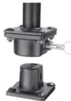
RAM-VB-REM1 RAM VEHICLE REMOVE-A-POLE BASE