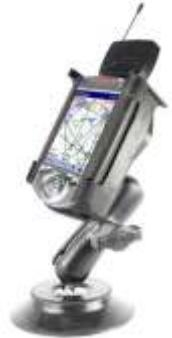
RAM-B-148-CO1 HP IPAQ HOLDER WITH SUCTION CUP