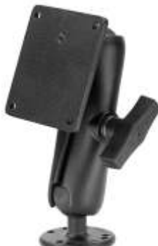
RAM-101U-2461 RAM MOUNT WITH VESA PLATE 75 MM