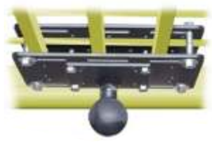
RAM-335 RAM LIFT TRUCK BACK-UP MOUNTING PLATE