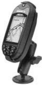
RAM-B-138-MA6 RAM MOUNT FOR THE MAGELLAN EXPLORIST XL