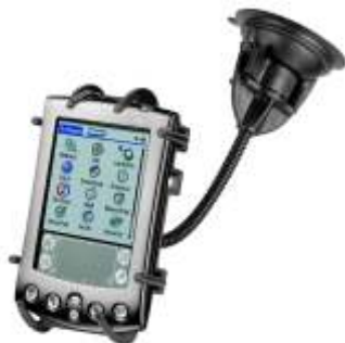
RAP-105-6224-PD3 RAM FLEX ARM MOUNT UNIVERSAL PDA