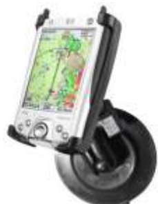
RAM-B-148-CO3 RAM SUCTION MOUNT FOR THE HP 2000 IPAQ