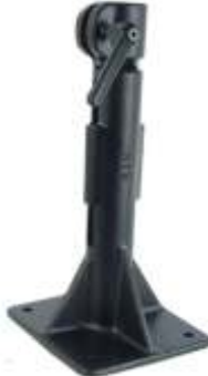
RAM-D-164BU RAM 90 DEGREE BASE WITH TELESCOPING PEDESTAL