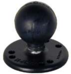
RAM-202SU RAM 2 1/2" DIAMETER STST BASE WITH BALL