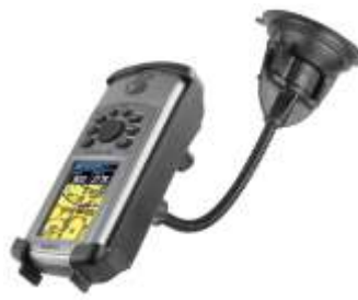
RAP-105-6224-GA14 RAM FLEX ARM MOUNT FOR THE GARMIN 76C