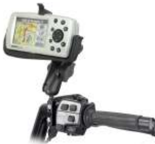
RAM-B-174-GA15 RAM BRAKE/CLUTCH RESERVOIR FOR THE GARMIN QUEST