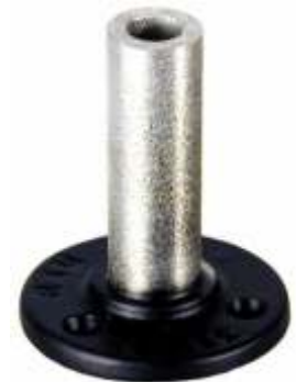
RAM-316-TU RAM POD III 1/2" PIPE POST