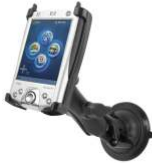
RAM-B-166-CO3 RAM SUCTION MOUNT FOR THE HP IPAQ 2000 SERIES