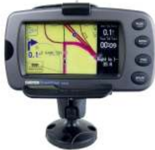
RAP-B-138-GA9 RAM MOUNT FOR THE GARMIN 2610 SERIES