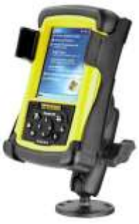
RAM-B-101U-TD1 RAM MOUNT. WITH 2 2 1/2" BASES TDS RECON