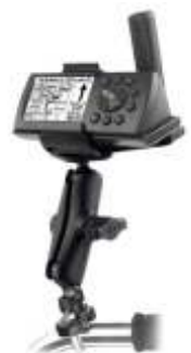
RAM-B-149Z-GA2 RAM U-BOLT MOUNT FOR THE GARMIN GPS II & III