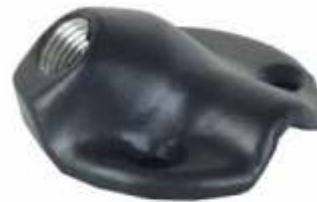
RAM-B-232-45 RAM 2 1/2" DIAMETER BASE WITH 1/4" NPT HOLE 45 DEGREE