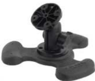
RAP-B-168-MA4U RAM MAGELLAN WEIGHTED DASH BASE