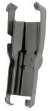
RAM-HOL-HA1U RAM HOLDER FOR THE HAND HELD 9500