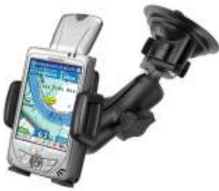
RAM-B-166-UN3 RAM UNIVERSAL SUCTION MOUNT FOR MEDIUM SIZE DEVICES