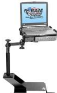
RAM-VB-110-SW1 VEHICLE SYSTEM FOR THE 1997-03 EXPEDITION & F150