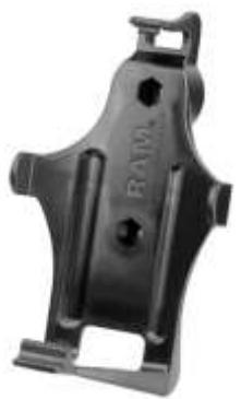
RAM-HOL-GA7 RAM HOLDER FOR THE GARMIN GPSMAP 176, 276 & 296