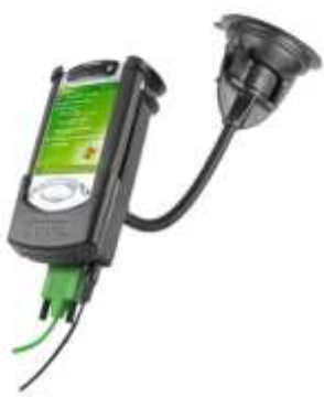
RAP-105-6224-CO2P RAM FLEX ARM MOUNT POWERED DOCK FOR HP IPAQ 3000 & 5000