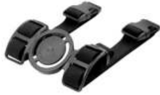
RAM-BM-L1 RAM BODY MOUNT FOR LEGS