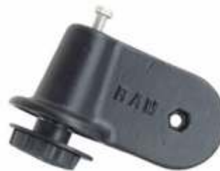
RAM-D-162SU RAM SWIVEL BASE WITH RATCHET FEATURE