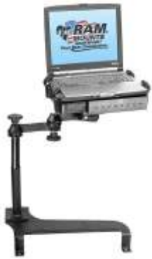
RAM-VB-132-SW1 VEHICLE SYSTEM FOR THE 2006- NEWER HONDA RIDGELINE