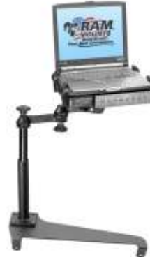
RAM-VB-153-SW1 VEHICLE SYSTEM FOR THE 2005- NEWER TOYOTA SIENNA