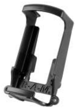
RAM-HOL-KE1 RAM HOLDER FOR THE KENWOOD TH-D7A RADIO