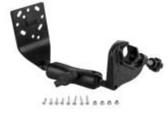
RAM-B-125-G1 RAM YOKE CLAMP WITH MOUNTING HARDWARE