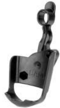
RAM-HOL-GA12 RAM HOLDER GARMIN FOR THE 60 SERIES