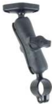
RAP-B-149U RAM RAIL MOUNT WITH 2.47 DIAMETER X 2.47 X 1