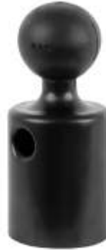
RAP-B-224-1UU RAM 3.3" DIAMETER SUCTION CUP WITH BALL