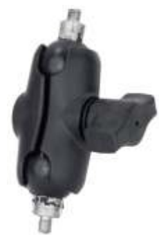
RAM-B-323-AU RAM MOUNT WITH 2 1/4"-20 BASES