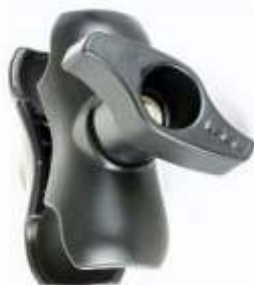
RAM-D-201U-C RAM DOUBLE SOCKET D SHORT ARM