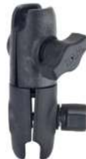
RAP-B-200-12U RAM VARIABLE SWIVEL ARM