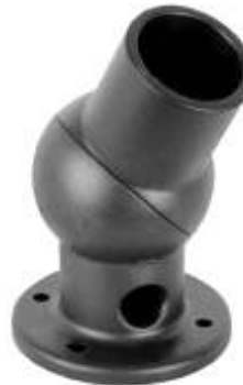
RAP-288U RAM 45 DEGREE ADJUSTABLE BASE WITH FEMALE FOR PIPE