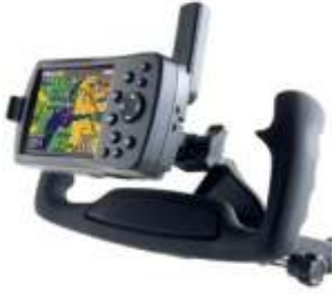
RAM-B-121-GA7 RAM YOKE MOUNT FOR 176, 276, 296