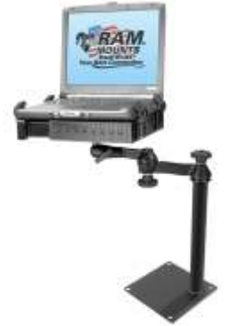
RAM-VBD-125-SW1 VEHICLE SYSTEM CHEVY PICKUP