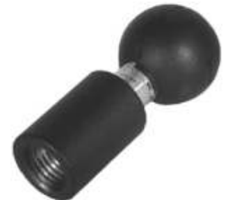
RAM-B-218-1 RAM SINGLE BALL WITH 1/4" NPT. HOLE