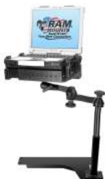
RAM-VB-157-SW1 VEHICLE SYSTEM FOR THE 2006- NEWER CHEVY MALIBU