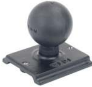
RAM-D-228U TRACK PLATE WITH POST FOR TITE-LOK