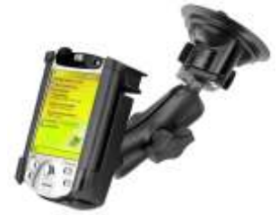
RAM-B-166-CO2 RAM SUCTION MOUNT FOR THE HP IPAQ 3000 & 5000 SERIES