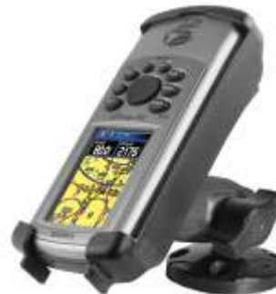
RAP-B-104-GA14UU RAM SINGLE BALL GARMIN 76C & 76CS PROMO