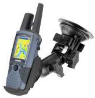
RAP-B-104-224-GA20 RAM RATCHET/PIVOT MOUNT FOR THE GARMIN RINO 520 & 530