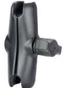
RAM-B-201 RAM DOUBLE SOCKET ARM FOR 1" BALLS