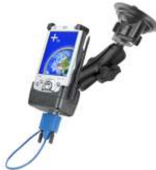
RAM-B-166-CO3P RAM SUCTION MOUNT POWERED DOCK FOR THE HP IPAQ 2000 SERIES