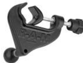
RAM-B-121BAU RAM CLAMP YOKE MOUNTING 1/4"-20