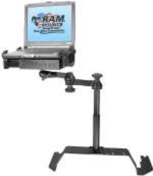
RAM-VB-103-SW1 VEHICLE SYSTEM FOR THE 1500, 2500, 3500 SILVERADO