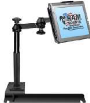
RAM-VB-156-MOT4 VEHICLE SYSTEM FOR THE 2005- NEWER KIA OPTIMA & HYUNDA