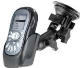
RAP-B-104-224-XM1 RAM RATCHET/PIVOT MOUNT FOR XM SATELLITE RADIOS