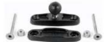
RAM-B-247U-3 RAM CLAMP BASE WITH BALL 3" MAX WIDTH