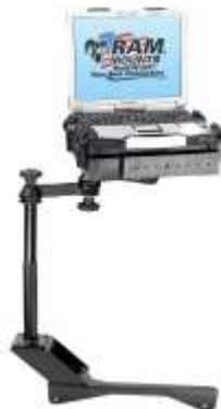
RAM-VB-145-SW1 VEHICLE SYSTEM FOR THE 2006- NEWER CHRYSLER 300