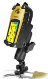
RAM-B-149Z-GA16U RAM U-BOLT FOR THE GARMIN ETREX COLOR