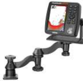
RAM-109H-1 RAM DOUBLE SWING ARM MOUNT SYSTEM HORIZONTAL BASE