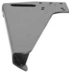
RAM-VB-152 VEHICLE BASE FOR THE 2000- NEWER FORD ESCAPE