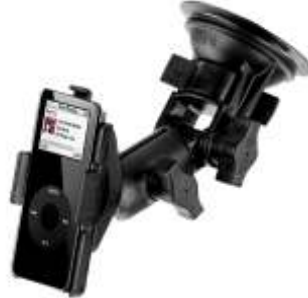
RAP-B-104-224-AP2 RAM RATCHET/PIVOT MOUNT FOR THE APPLE IPOD NANO