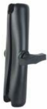
RAM-201-D RAM DOUBLE SOCKET ARM C BALL D LENGTH