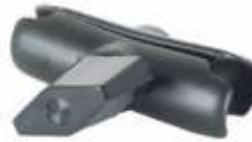
RAM-A-201 RAM DOUBLE SOCKET ARM