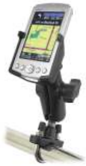
RAM-B-149Z-GA10 RAM RAIL MOUNT FOR THE GARMIN IQUE