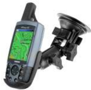
RAP-B-104-224-GA12 RAM RATCHET/PIVOT MOUNT FOR THE GARMIN 60 SERIES