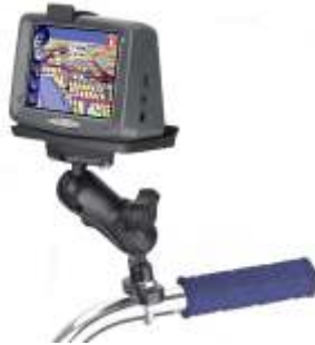
RAM-B-149Z-LO7 RAM RAIL MOUNT FOR THE LOWRANCE IWAY 350C