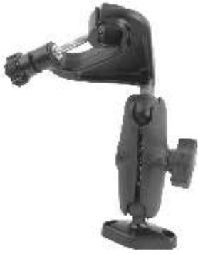
RAP-B-102-121BU RAM MOUNT WITH B-102 & EXTRA B-121B