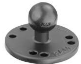
RAM-B-202 RAM 2 1/2" DIAMETER BASE WITH 1" BALL