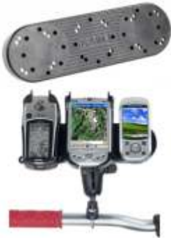
RAP-333U RAM TRIPLE BASE ADAPTER