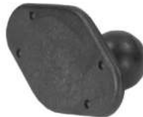
RAP-B-326MU EZY-MOUNT QUICK RELEASE MALE WITH BALL