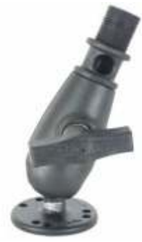
RAM-112-1 RAM SINGLE BALL MOUNT WITH 1/2" NPT HOLE