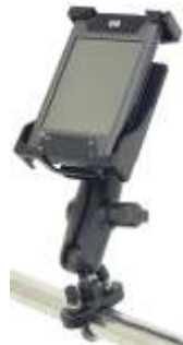
RAM-B-149Z-PD1 RAM RAIL MOUNT WITH UNIVERSAL PDA CRADLE