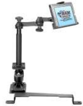
RAM-VB-163-MOT3 VEHICLE SYSTEM FOR THE 2005- NEWER HONDA PILOT