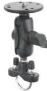
RAM-B-149ZA-C1U RAM MOUNT WITH SHORT ARM AND 1/4"-20