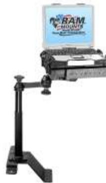
RAM-VBD-126-SW1 RAM DRILL TYPE SPECIFIC TRANS HUMP SYSTEM