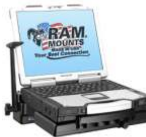
RAM-234-PAN1M RAM PANASONIC LAPTOP MOUNT TOUGH TRAY METAL