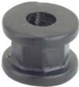
RAM-280U RAM DOUBLE THICK OCTAGON BUTTON