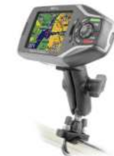
RAM-B-149Z-MA4 RAM RAIL MOUNT FOR THE MAGELLAN ROADMATE