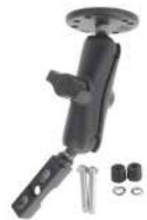
RAM-B-174-202U RAM GOLDWING WITH 2.5 DIAMETER BASE