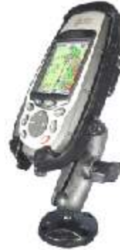
RAP-B-138-MA2 RAM MOUNT FOR THE MAGELLAN MERIDIAN