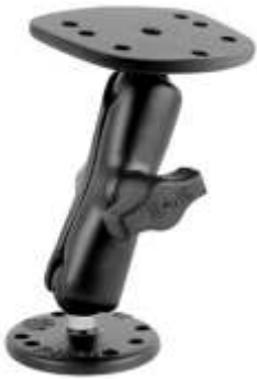
RAM-B-107-1U RAM FOR HUMMINBIRD PIRANHA