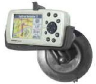
RAM-B-148-GA15U RAM SUCTION FOR THE GARMIN QUEST