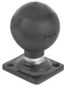
RAM-D-202U-22 RAM 2" X 2" BASE WITH BALL