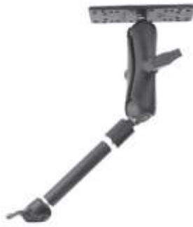
RAM-134-45 RAM 45 DEGREE BASE 6" PIPE DOUBLE SOCKET MOUNT