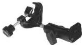
RAM-B-121-238 YOKE CLAMP MOUNT WITH B-238 BASE