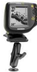
RAM-107 RAM MOUNT FOR THE HUMMINBIRD & APELCO 97