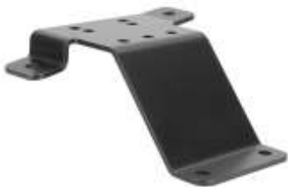
RAM-VBD-126 RAM DRILL TYPE SPECIFIC TRANS HUMP BASE