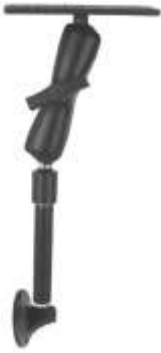
RAM-134-0 RAM 0 DEGREE BASE, 6" PIPE DOUBLE SOCKET MOUNT