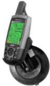
RAM-B-148-GA12 RAM SUCTION MOUNT FOR THE GARMIN 60 SERIES