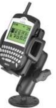
RAM-B-138-UN3 RAM UNIVERSAL MOUNT FOR MEDIUM SIZE DEVICES