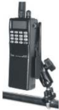
RAP-B-149-BC1 RAM WITH RAIL, BELT CLIP HOLDER HAND HELD