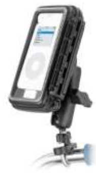
RAM-B-149Z-AQ2 RAM U-BOLT MOUNT MEDIUM SIZE AQUA BOX