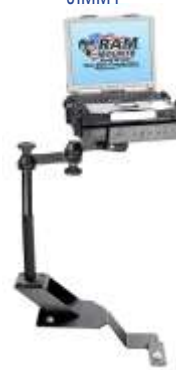
RAM-VB-101-SW1 VEHICLE SYSTEM FOR THE 1995-NEWER SONOMA BLAZER & S10 JIMMY