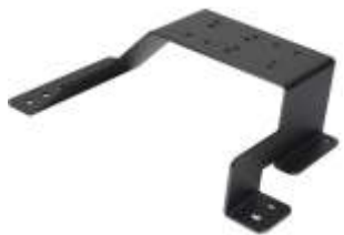
RAM-VB-107 VEHICLE BASE FOR THE 1990-95 CAPRICE & 1991 CROWN VIC