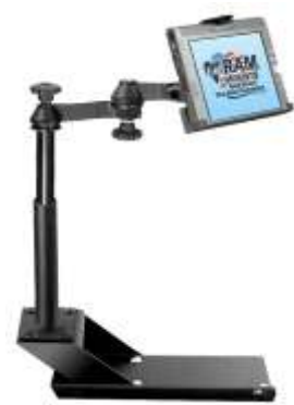
RAM-VB-116-MOT3 VEHICLE SYSTEM FOR THE 2004-NEWER COLORADO