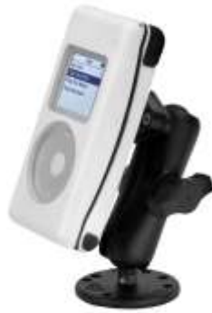
RAM-B-138-OT1 RAM MOUNT FOR THE OTTERBOX