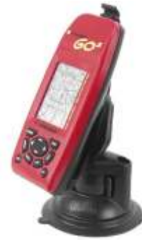
RAP-224-1U-LO5 RAM TWIST LOCK SUCTION MOUNT FOR THE LOWRANCE IFINDER GO