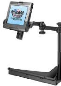
RAM-VB-164-MOT1 VEHICLE SYSTEM 2005-NEWER SEARS SEATING