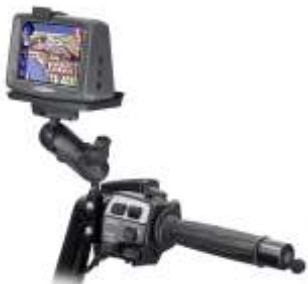
RAM-B-174-LO7 RAM BRAKE/CLUTCH RESERVOIR FOR THE LOWRANCE IWAY 350C