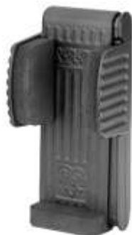
RAM-120B RAM HOLDER WITH QUICK RELEASE