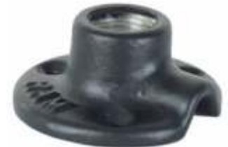
RAM-232-90 RAM 2 1/2" DIAMETER BASE WITH 1/2" NPT HOLE 90 DEGREE