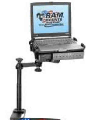
RAM-VB-155-SW1 VEHICLE SYSTEM FOR THE 2006- NEWER HONDA CIVIC