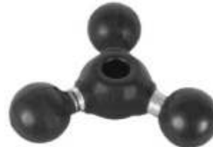
RAM-289U RAM TRIPLE BALL BASE 120 DEGREE APART