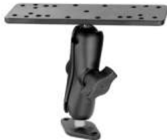
RAM-B-111-238U RAM 6 1/4" BASE MOUNT WITH B-238