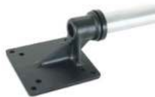
RAM-D-246PU VESA PLATE WITH 1" POST