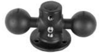
RAM-217-1U RAM DOUBLE BALL WITH 2.5" BS & 5/8" HOLE