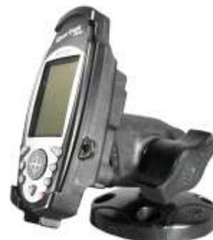
RAP-B-104-MA3UU RAM SINGLE BALL MOUNT MAGELLN SPORTRAK PROMO