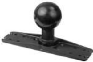
RAM-E-111BU RAM BASE 11" X 3" WITH 3 3/8" BALL