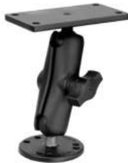
RAM-B-101-24U RAM MOUNT WITH 1 2" X 4" BASE & 1 STUD