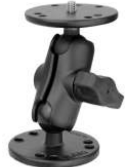
RAM-B-101AU RAM 1" MOUNT WITH 2 BASES 1 1/4"-20 STUD BASE, 1 202 BASE