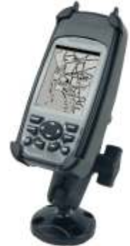
RAP-B-104-224-LO3 RAM MOUNT FOR THE LOWRANCE IFINDER H2O, & MAP