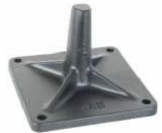
RAM-283U RAM 5" X 5" BASE WITH MALE POST FOR TEL POST