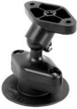
RAP-SB-178U FLEX STICK ON BASE WITH SNAP LINK MOUNT