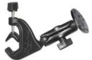
RAM-B-121-202U RAM MOUNT WITH RAM-B-121, B-201, & B-202