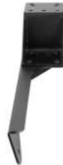
RAM-VB-145 VEHICLE BASE FOR THE 2006-NEWER CHRYSLER 300