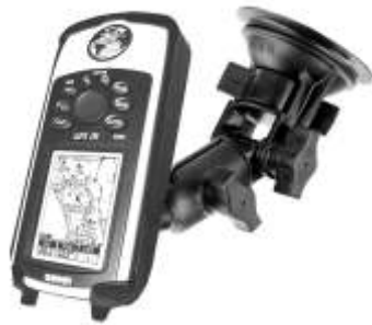
RAP-B-104-224-GA6 RAM RATCHET/PIVOT MOUNT FOR THE GARMIN 76 76CSX