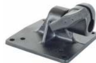
RAM-246HU VESA PLATE WITH 1/2" HOLE