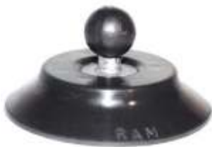
RAM-B-224 RAM 1" BALL WITH 4" SUCTION CUP BASE