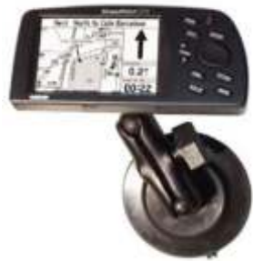
RAM-B-145S1 SUCTION BASE WITH 1" BALL FOR THE GARMIN STREETPILOT