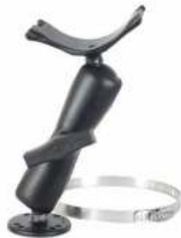
RAM-118 RAM SYSTEM FOR LANTERNS