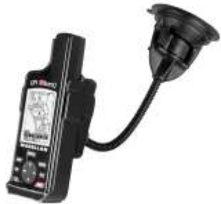
RAP-105-6224-MA1 RAM FLEX ARM MOUNT FOR THE MAGELLAN 12, 300 & 315