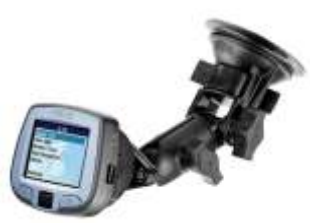
RAP-B-104-224-GA22 RAM RATCHET/PIVOT MOUNT FOR THE GARMIN STREETPILOT I SERIES