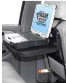
RAM-234-4 RAM REAR SEAT LAPTOP MOUNT