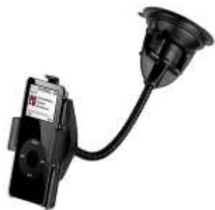
RAP-105-6224-AP2 RAM FLEX ARM MOUNT FOR THE APPLE IPOD NANO