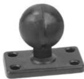
RAM-202U-152 RAM BASE 1.5" X 2" WITH 1 1/2" BALL