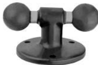
RAM-B-217 RAM DOUBLE BALL "B" WITH 2 1/2" DIAMETER BASE