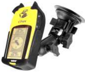
RAP-B-104-224-GA5 RAM RATCHET/PIVOT MOUNT FOR THE GARMIN E-TREX