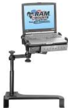
RAM-VB-150-SW1 VEHICLE SYSTEM FOR THE 2005- NEWER SCION XB