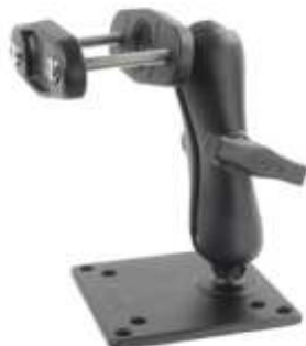
RAM-246-247U-25 RAM MOUNT VESA PLATE SQUARE TUBE