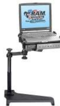
RAM-VB-151 VEHICLE BASE SEATS INC.