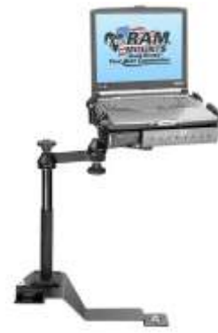
RAM-VB-114-SW1 VEHICLE SYSTEM FOR THE 2002-NEWER TRAIL BLAZER & ENVOY