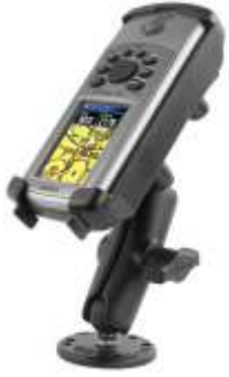
RAM-B-138-GA14 RAM MOUNT FOR GARMIN GPS 76C & 76CS SERIES