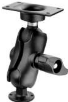
RAM-D-101U-C-243 RAM MOUNT WITH D-243, D-201-C, D-254 & SHORT ARM