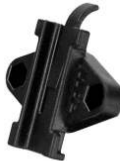
RAM-B-238-OT1U RAM 2 7/16" X 1 5/16" WITHOUT TTTTTER CLI