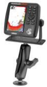
RAM-111 RAM UNIVERSAL ELECT. MOUNT 6 1/4" X 2"