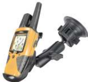
RAM-B-166-GA8 RAM SUCTION MOUNT FOR THE GARMIN RINO