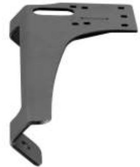
RAM-VB-166 VEHICLE BASE FOR THE 2006-NEWER FORD EXPEDITION