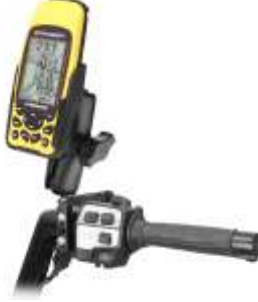
RAM-B-174-LO2 RAM BRAKE/CLUTCH RESERVOIR FOR THE LOWRANCE IFINDER