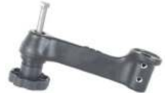
RAM-109-1ATU RAM SINGLE SWING EXTENSION ARM NO BEND