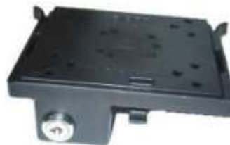
RAP-315U SLIDE-N-LOCK UNIVERSL DOCK PLATE