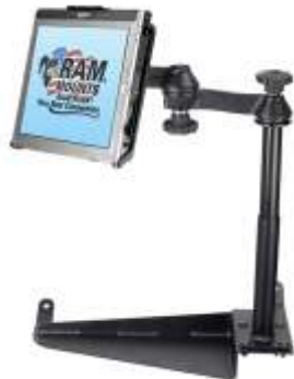
RAM-VB-134-MOT4 VEHICLE SYSTEM FOR THE 2006- NEWER NISSAN TITAN