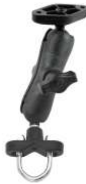
RAP-B-102-231Z RAM MOUNT WITH B-102 & EXTRA B-231Z