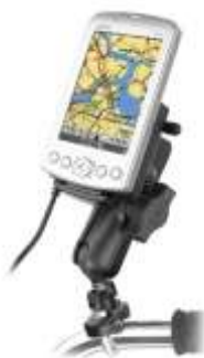
RAM-B-149Z-GA11 RAM RAIL MOUNT GARMIN ADAPTER