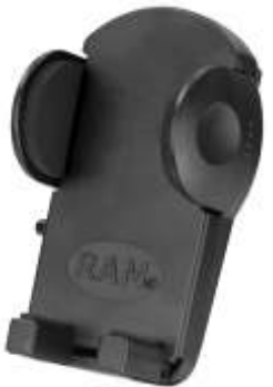
RAM-HOL-UN2 RAM MEDIUM BLACK MOBILE PHONE HOLDER