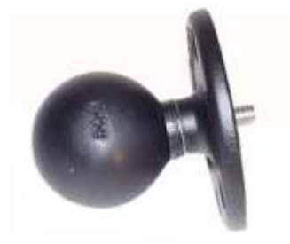
RAM-202C RAM BALL BASE WITH 3/8" -16 STST STUD