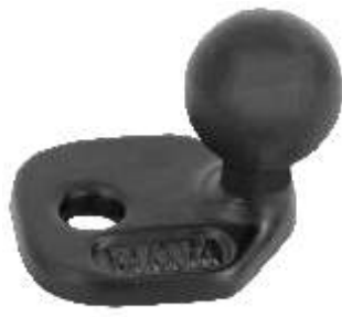
RAM-B-126CU RAM 1.5 X 1.75 BASE 5/16" HOLE & 1"