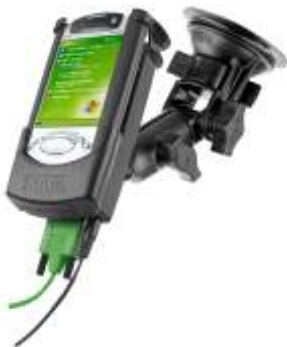
RAP-B-104-224-CO2P RAM RATCHET/PIVOT MOUNT FOR THE POWERED DOCK FOR HP IPAQ 3000 & 5000 SERIES