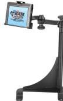
RAM-VB-136-MOT3 VEHICLE SYSTEM FOR THE 2005- NEWER ASTRO VAN