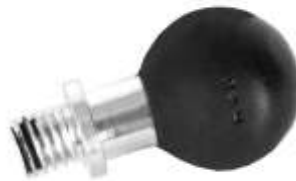
RAM-B-236U RAM BALL WITH 3/8-16 THREAD POST