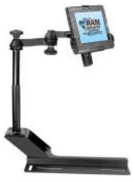
RAM-VB-106R4-MOT1 VEHICLE SYSTEM FOR THE DODGE SPRINTER VAN