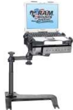
RAM-VB-131-SW1 VEHICLE SYSTEM FOR THE 2000- NEWER 2500 & 3500 SU POWER