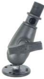
RAM-112 RAM ANTENNA MOUNT WITH 1"-14 MALE POST