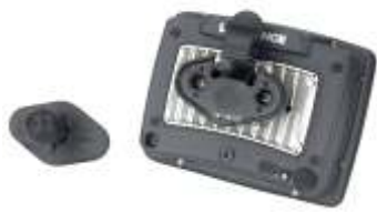
RAP-B-331-LO4 RAM QUICK RELEASE ADAPTER FOR THE LOWANCE IFINDER IWAY 500C