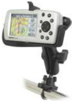
RAM-B-149Z-GA15U RAM U-BOLT FOR THE GARMIN QUEST