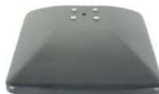
RAM-251-1SA RAM 9" X 9" ALUMINUM BASE WITH 4 HOLES