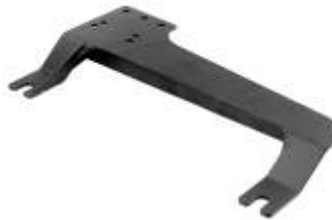
RAM-VB-131 VEHICLE BASE FOR THE 2000-NEWER 2500 & 3500 SU POWER