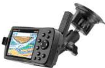
RAM-B-166-GA7 RAM SUCTION MOUNT FOR THE GARMIN 176, 276 & 296