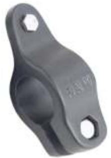
RAM-D-264U RAM TRI & BI-POD LEG CONNECTOR 1" PIPE