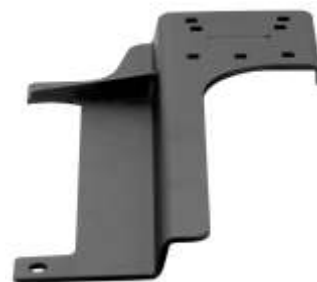
RAM-VB-158 VEHICLE BASE FOR THE 2005-NEWER JEEP WRANGLER