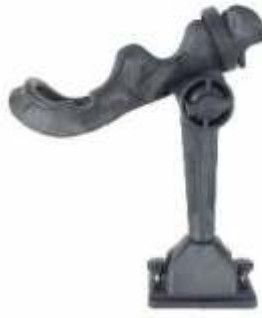
RAM-114-D RAM ROD 2000 ROD HOLDER WITH DECK, TRACK MOUNT