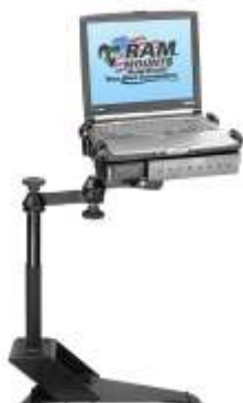
RAM-VB-138-SW1 VEHICLE SYSTEM FOR THE 2006- NEWER TOYOTA 4-RUNNER