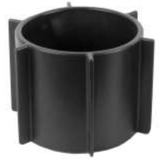
RAP-299 RAM-A-CAN UNIVERSAL CUP HOLDER BASE