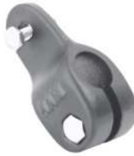
RAM-264U RAM TRI & BI-POD LEG CONNECTOR 1/2 PIPE