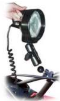
RAM-B-152R RAM SPOTLIGHT WITH MOUNT & U-BOLT BASE