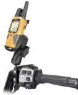
RAM-B-174-GA8 RAM BRAKE/CLUTCH RESERVOIR FOR THE GARMIN RINO