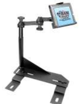
RAM-VB-121-MOT3 VEHICLE SYSTEM FOR THE 1996- NEWER CARAVAN