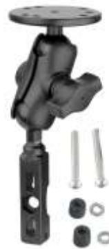
RAM-B-174-202AU RAM GOLDWING WITH 1/4"-20 MALE CAMERA MOUNT