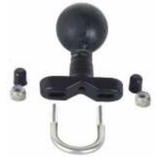
RAM-231 RAM BASE WITH U-BOLT FOR 3/4" TO 1" DIAMETER