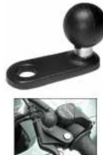
RAM-B-252U RAM .87 X 2.25 WITH 11 MM HOLE & 1" BALL