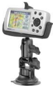
RAP-B-104-224-GA15 RAM RATCHET/PIVOT MOUNT FOR THE GARMIN QUEST