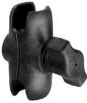
RAP-B-201-A RAM PLASTIC DOUBLE SOCKET ARM B BALL A LENGTH