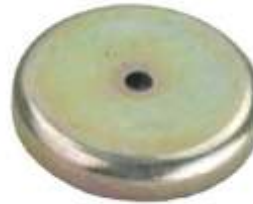
RAP-300-1RU RAM MAGNETIC POWER PLATE ROUND STEEL