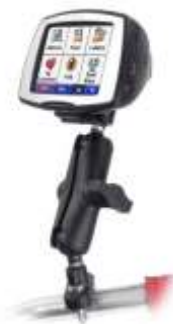
RAM-B-149Z-GA19U RAM U-BOLT FOR THE GARMIN C320, C330 & C340