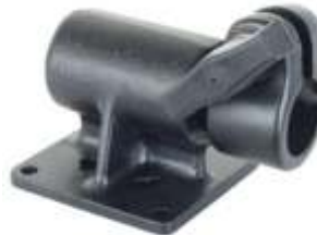
RAM-D-246-1HU RAM VESA 75MM WITH 1" PIPE HOLE