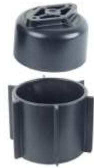
RAP-299 RAM-A-CAN UNIVERSL CUP HOLDER BASE