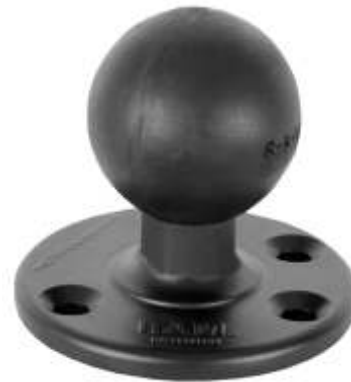
RAM-202 C Size Ball 1.5" Diameter