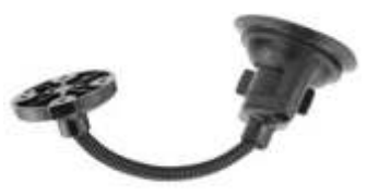
RAP-105-6R224U RAM FLEX ARM WITH 6" SUCTION ROUND BASE