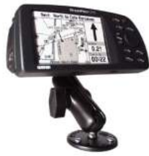
RAM-B-145 RAM MOUNT FOR GARMIN STREETPILOT