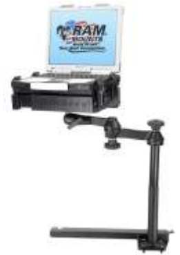
RAM-VB-150 VEHICLE BASE FOR THE 2005-NEWER SCION XB