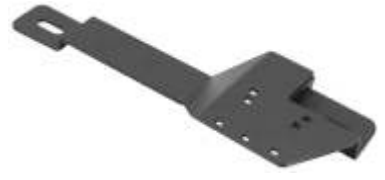
RAM-VB-114 VEHICLE BASE FOR THE 2002-NEWER TRAIL BLAZER & ENVOY