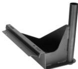
RAM-VB-140 VEHICLE BASE NATIONAL SEATING