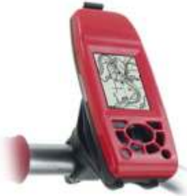
RAP-B-274-LO5 RAM RAIL MOUNT FOR THE LOWRANCE IFINDER GO