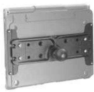
RAM-HOL-MOT4U RAM HOLDER FOR THE MOTION COMPUTING LE1600