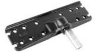
RAM-137BPU RAM 3" X 11" BASE WITH 1/2" POST