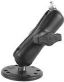
RAM-B-101-237U RAM MOUNT WITH 1 1/4"-20 BASE & 1 STUD