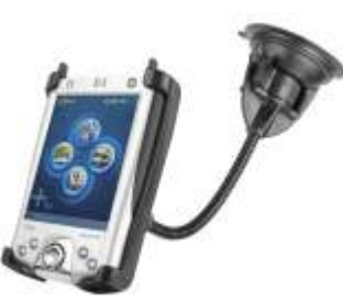
RAP-105-6224-CO3 RAM FLEX ARM MOUNT FOR THE IPAQ 2000 SERIES