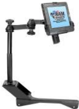
RAM-VB-145-MOT1 VEHICLE SYSTEM CHRYSLER 300 2006- NEWER