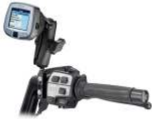
RAM-B-174-GA22 RAM BRAKE/CLUTCH RESERVOIR FOR THE GARMIN STREETPILOT I SERIES