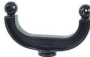
RAP-295U RAM DOUBLE SNAP LINK WITHOUT OCTAGON BUTTON