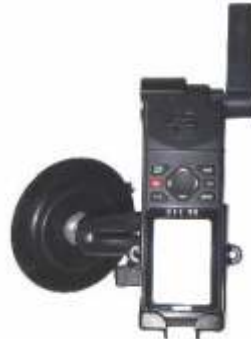
RAM-B-148-GA3 RAM SUCTION MOUNT FOR THE GARMIN 48,45,89,90