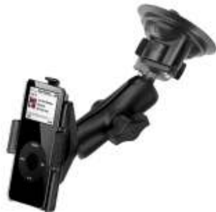
RAM-B-166-AP2 RAM SUCTION MOUNT FOR THE APPLE IPOD NANO