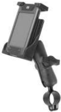
RAP-B-149-PD1 RAM RAIL MOUNT WITH UNIVERSAL PDA CRADLE