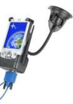
RAP-105-6224-CO3P RAM FLEX ARM MOUNT POWERED DOCK FOR THE IPAQ 2000 SERIES