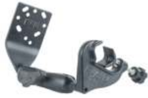
RAM-B-125U UNPKD RAM YOKE MOUNT WITH ANGLED PLATE