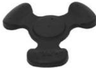
RAP-279U RAM RUBBER COATED WEIGHTED DASH BASE