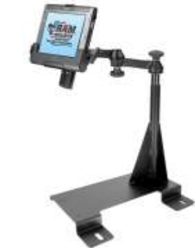
RAM-VB-120-MOT1 VEHICLE SYSTEM FOR THE 2004- NEWER FREESTAR