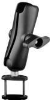
RAM-D-101U-HY1 RAM MOUNT WITH 2" RAIL & 2.5" PLATE