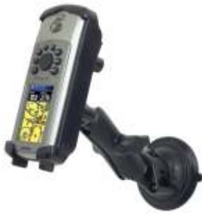
RAM-B-166-GA14 RAM SUCTION MOUNT FOR THE GARMIN 76C