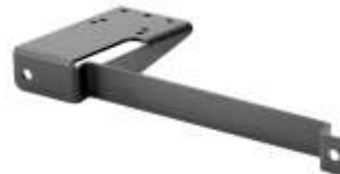
RAM-VB-155 VEHICLE BASE FOR THE 2006- NEWER HONDA CIVIC