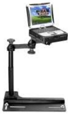
RAM-VB-107-PAN2 VEHICLE SYSTEM TOUGH DOCK CF- 18