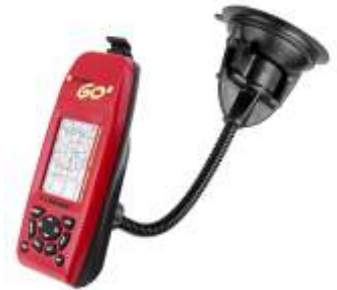
RAP-105-6224-LO5 RAM FLEX ARM MOUNT FOR THE LOWRANCE IFINDER GO