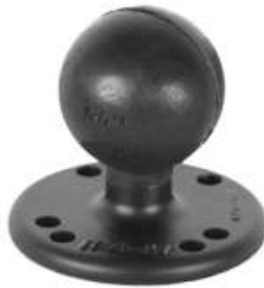
RAM-202U-MT1 RAM 2-1/2" DIAMETER BASE 5/16"-18 HOLE