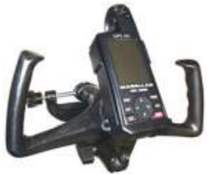
RAM-B-125-MA1 RAM YOKE WITH CRADLE FOR MAGELLAN 315A