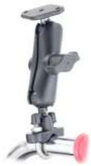
RAM-B-149Z RAM U-BOLT MOUNT WITH 2.43 DIAMETER & 2.43 X 1.31