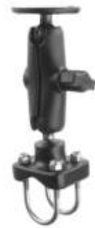
RAM-B-101-235U RAM MOUNT WITH DOUBLE U-BOLT BASE