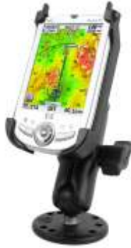
RAM-B-138-CO4 RAM MOUNT FOR HP IPAQ 1900, 4100 SERIES