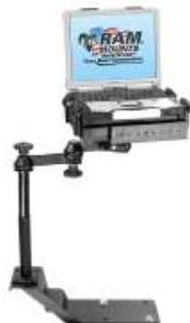
RAM-VBD-101-SW1 DRILL TYPE SYSTEM DOUBLE SWING ARM