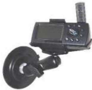
RAM-B-148-GA2 RAM SUCTION MOUNT FOR THE GARMIN GPS II & II