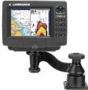
RAM-109H RAM SINGLE SWING ARM MOUNT SYSTEM HORIZONTAL BASE