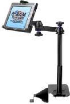
RAM-VB-141-MOT3 VEHICLE SYSTEM FOR THE 2003- NEWER JEEP LIBERTY