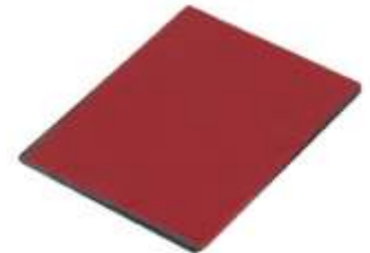
RAP-300-1SU RAM POWER PLATE III (RADAR DETECT)