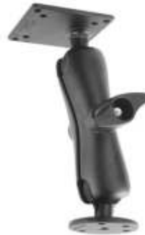
RAM-D-101-ID1U RAM MOUNT WITH 1-3.68 BASE & VESA BASE