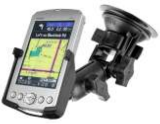
RAP-B-104-224-GA10 RAM RATCHET/PIVOT MOUNT FOR THE GARMIN IQUE