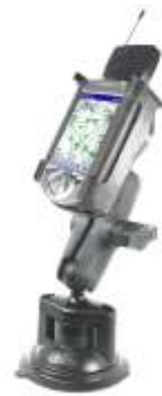
RAP-B-166-CO1U RAM SUCTION CUP HP IPAQ HOLDER SYSTEM