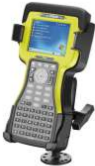
RAM-101U-TD2 RAM MOUNT FOR THE TDS RANGER