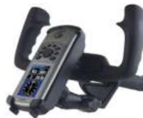
RAM-B-121-GA14 RAM YOKE MOUNT FOR 76C SERIES