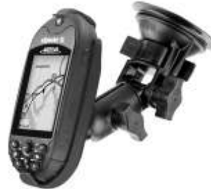
RAP-B-104-224-MA6 RAM RATCHET/PIVOT MOUNT FOR THE MAGELLAN EXPLORIST XL