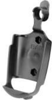
RAM-HOL-GA20U RAM HOLDER GARMIN FOR THE RINO 530 & 520