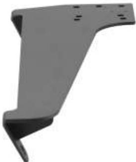
RAM-VB-153 VEHICLE BASE FOR THE 2005-NEWER TOYOTA SIENNA