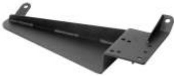
RAM-VB-134 VEHICLE BASE FOR THE 2006-NEWER NISSAN TITAN