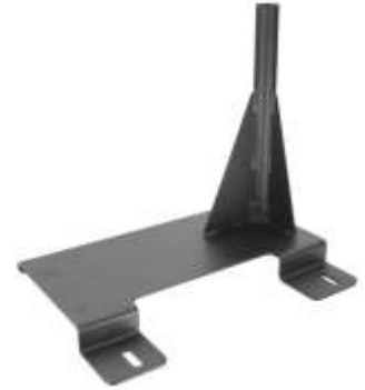
RAM-VB-120 VEHICLE BASE FOR THE 2004- NEWER FREESTAR