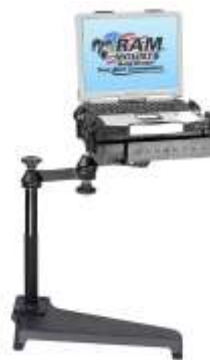
RAM-VB-137-SW1 VEHICLE SYSTEM FOR THE 2006- NEWER TOYOTA CAMRY