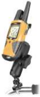
RAM-B-149Z-GA8 RAM MOUNT WITH U-BOLT FOR THE GARMIN RINO