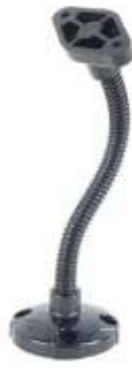
RAP-105-6DR RAM 6" FLEX ARM WITH ROUND & DIAMOND BASE