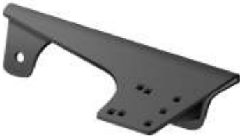
RAM-VB-165 VEHICLE BASE FOR THE 2006-NEWER HUMMER H3