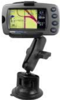
RAP-B-166-GA9U RAM SUCTION CUP FOR THE GARMIN 2610