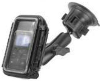
RAM-B-166-AQ3 RAM SUCTION MOUNT SMALL SIZE AQUA BOX