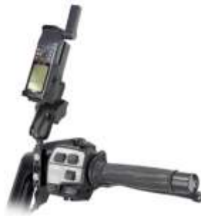
RAM-B-174-GA3 RAM BRAKE/CLUTCH RESERVOIR FOR THE GARMIN 48, 45, 89 & 90