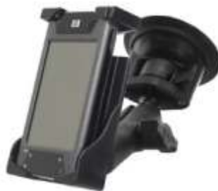
RAP-B-166-PD1U RAM SUCTION SYSTEM FOR PDA