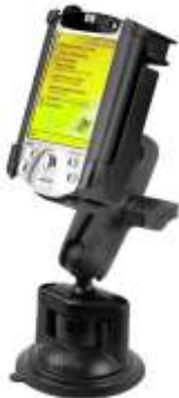
RAP-B-166-CO2U RAM SUCTION SYSTEM FOR THE HP IPAQ 3000 & 5000 SERIES