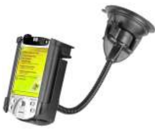
RAP-105-6224-CO2 RAM FLEX ARM MOUNT FOR THE IPAQ 3000 & 500 SERIES