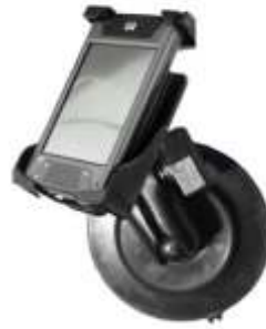
RAM-B-148-PD1 RAM SUCTION MOUNT WITH UNIVERSAL PDA CRADLE