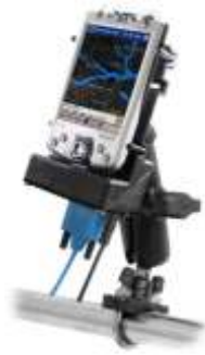
RAM-B-149Z-CO5P RAM RAIL MOUNT SYSTEM UNIVERSAL IPAQ SERIES