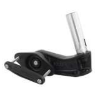
RAM-D-247U-4P1 4" FORK LIFT BASE WITH 1" POST RATCHET