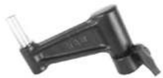
RAM-D-261-DHCPU RAM ARM WITH 1" PIPE FEMALE 1/2" POST