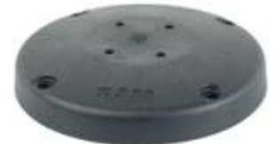
RAP-291U RAM 6" DIAMETER SUPPORT BASE FOR AMPS BASE