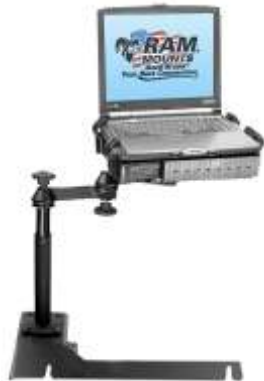
RAM-VB-111-SW1 VEHICLE SYSTEM FOR THE 2000-NEWER IMPALA