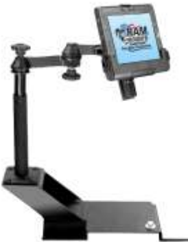
RAM-VB-110-MOT1 VEHICLE SYSTEM FOR THE 1997-03 EXPEDITION & F150