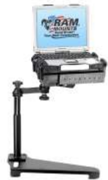
RAM-VB-152-SW1 VEHICLE SYSTEM FOR THE 2000- NEWER FORD ESCAPE