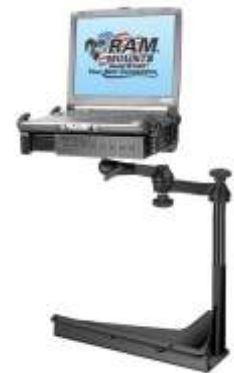
RAM-VB-164 VEHICLE BASE 2005-NEWER SEARS SEATING