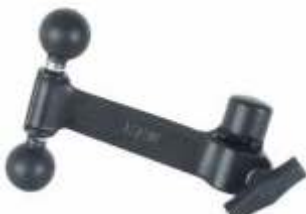
RAM-261-2U RAM 6" SWING ARM PEDESTAL DOUBLE BALL END