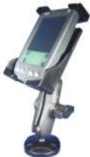
RAP-B-138-PD1 RAM MOUNT WITH UNIVERSAL PDA CRADLE