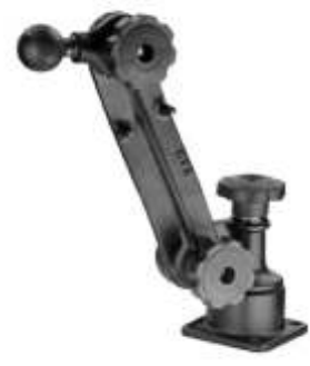
RAM-162H-MC4 RAM RATCHET SWING ARM WITH 1 1/2" BALL