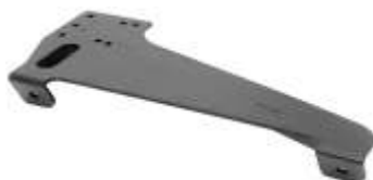
RAM-VB-139 VEHICLE BASE FOR THE 2004- NEWER HONDA ACCORD