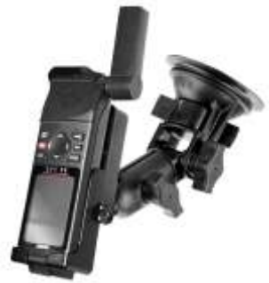
RAP-B-104-224-GA3 RAM RATCHET/PIVOT MOUNT FOR THE GARMIN 48, 45, 89 & 90