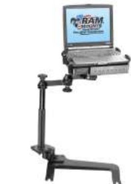
RAM-VB-159-SW1 VEHICLE SYSTEM FOR THE 2007 CHEVY TAHOE