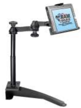
RAM-VB-142-MOT3 VEHICLE SYSTEM FOR THE 2005- NEWER GRAND CHEROKEE