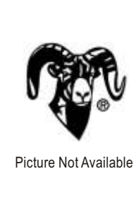
RAM-101U-VE4 VARIABLE BASE WITH PEDESTAL AND TRAY