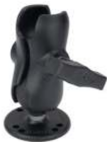
RAM-103U-B RAM MOUNT WITH 1 RAM-202 2 1/2" DIAMETER