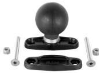
RAM-D-247U-4 RAM CLAMP BASE WITH BALL 4" MAXIMUM WIDTH