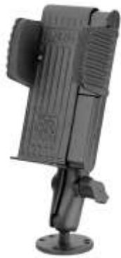
RAM-B-120 RAM HAND HELD MOUNT WITH 1"