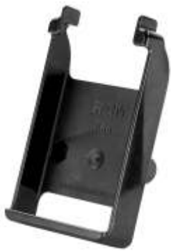
RAM-HOL-AP1U RAM MOUNT FOR THE APPLE IPOD