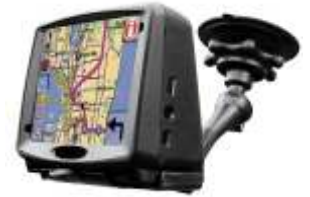
RAP-AA-167-LO6 RAM SNAP LINK MOUNT FOR THE LOWRANCE IWAY 350C