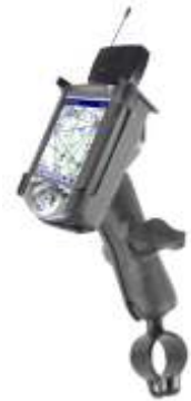
RAP-B-149-CO1 RAM U-BOLT MOUNT FOR THE HP IPAQ 3600 & 5100 SERIES