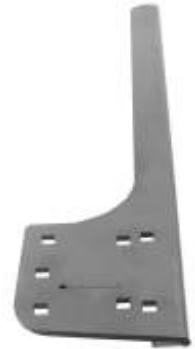
RAM-VB-130 VEHICLE BASE FOR THE 2004-NEWER DURANGO