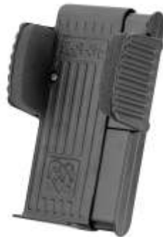
RAM-B-120B RAM QUICK RELEASE HOLDER ONLY WITH 1" BALL