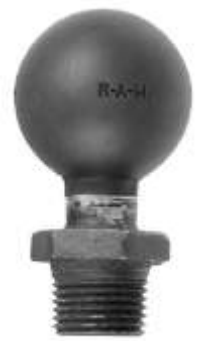
RAM-207U RAM BALL WITH 1/2" NPT MALE