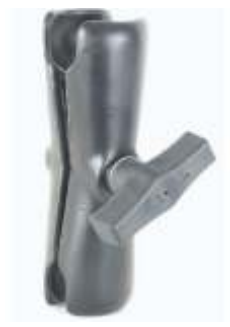
RAM-201 RAM DOUBLE BALL SOCKET ARM ASSEMBLY