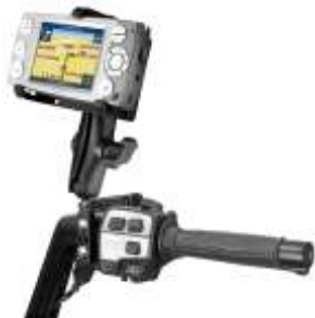
RAM-B-174-PD2 RAM BRAKE/CLUTCH RESERVOIR THREE FINDER PDA HOLDER