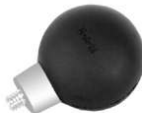
RAM-237 RAM BALL WITH 1/4"-20 THREADED STUD