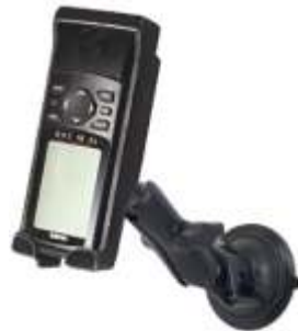
RAM-B-166-GA1 RAM SUCTION MOUNT FOR THE GARMIN GPS 12 SERIES