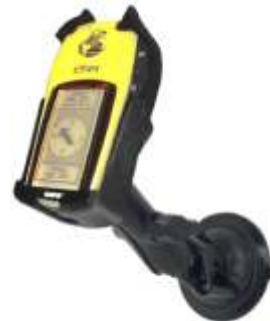
RAM-B-166-GA5 RAM SUCTION MOUNT FOR THE GARMIN E-TREX