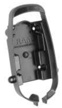
RAM-HOL-MA2 RAM HOLDER FOR THE MAGELLAN MERIDIAN CRADLE