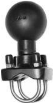
RAM-D-235U RAM WITH 2 U-BOLTS FOR 3/4 TO 1 1/4