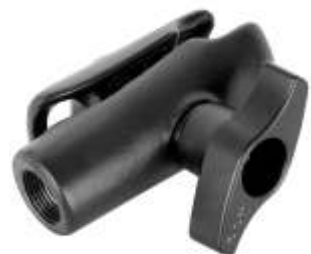
RAM-D-200-1 RAM SINGLE SOCKET ARM WITH 1" NPT HOLE