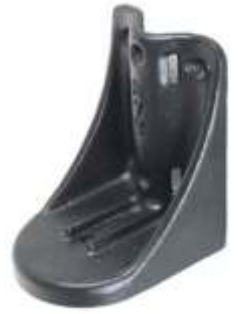
RAM-D-162VU RAM VERTICAL/POLE RATCHET SWING ARM BASE