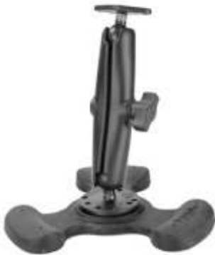
RAM-B-101-AW1U RAM SYSTEM WITH WEIGHTED BASE LONG ARM