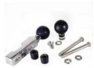
RAM-B-309-2CHU CHROME CYCLE HANDLEBAR BASE WITH 2 BALLS