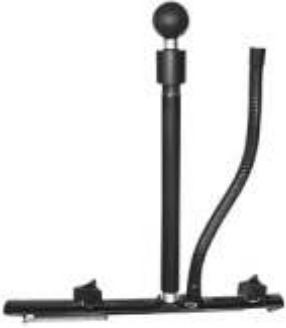
RAM-B-131 RAM AIRCRAFT SEAT RAIL BASE WITH MOUNT