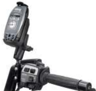
RAM-B-174-MA5 RAM BRAKE/CLUTCH RESERVOIR FOR THE MAGELLAN EXPLORIST SERIES