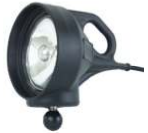
RAM-B-152B RAM SPOTLIGHT WITH 1" BALL