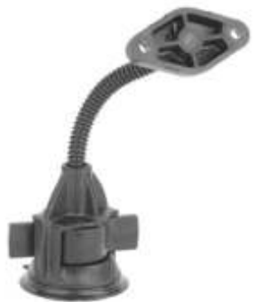
RAP-105-4DA224 RAM 4" FLEX ARM WITH SMALL SUCTION BASE