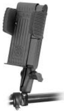
RAM-B-120-108B RAM HAND HELD HOLDER WITH V BASE & STRAPS