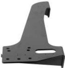
RAM-VB-135MH1 VEHICLE BASE FOR THE 2006-NEWER HONDA ELEMENT