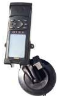
RAM-B-148-GA1 RAM SUCTION MOUNT FOR THE GARMIN GPS 12 SERIES