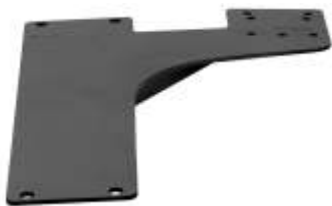
RAM-VB-157 VEHICLE BASE FOR THE 2006-NEWER