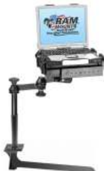
RAM-VB-154-SW1 VEHICLE SYSTEM FOR THE 2004- NEWER NISSAN PATHINDER & XTERRA