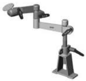
RAM-161-2U RAM BI-POD SYSTEM WITH DOUBLE SWING ARM & BALL