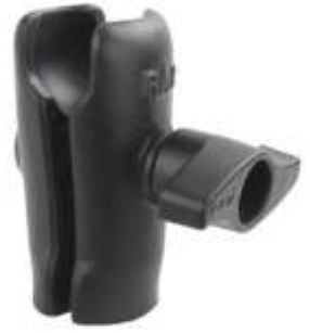
RAM-D-200-10FU RAM 2 1/4" S SOCKET ARM WITHOUT OCTAGON FEMALE