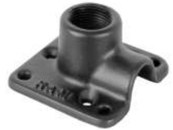
RAM-D-232-90U RAM BASE WITH 1" NPT 90 DEGREE HOLE