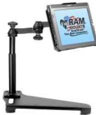
RAM-VB-152-MOT4 VEHICLE SYSTEM FOR THE 2000- NEWER FORD ESCAPE