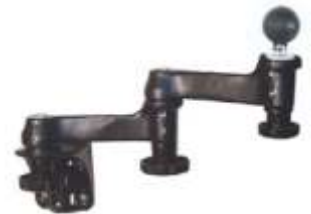
RAM-109V-1BU RAM DOUBLE SWING ARM WITH 1 1/2" AND VERTICAL BASE BALL