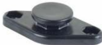
RAP-272U RAM DIAMOND BASE WITHOUT OCTAGON BUTTON