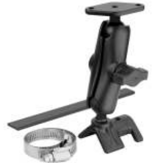
RAM-B-108U-GP1 UNPKD RAM MOUNT WITH B-238 BASE