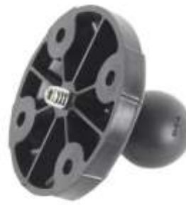
RAP-B-202A RAM 2 1/2 DIAMETER BASE WITH 1/4" 20 STST STUD