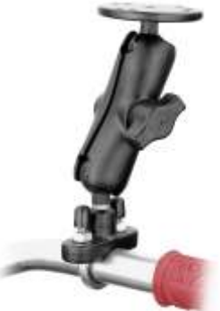
RAM-B-101U-IP RAM MOUNT WITH B-202 & 231 BASE AND ZINC U-BOLT