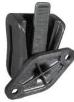
RAP-170U RAM UNIVERSAL BELT CLIP WITH NO CRADLE