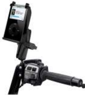
RAM-B-174-AP1 RAM BRAKE/CLUTCH FOR THE RESERVOIR APPLE IPOD