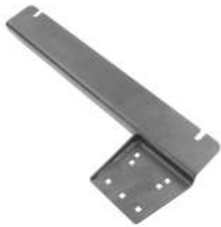
RAM-VB-129 VEHICLE BASE FOR THE 2005-NEWER MAGNUM & CHARGER