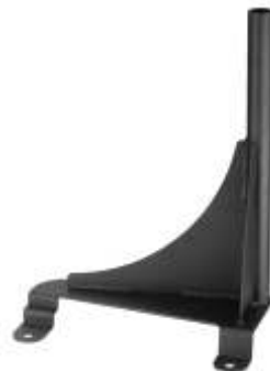
RAM-VB-136 VEHICLE BASE FOR THE 2005- NEWER ASTRO VAN