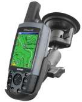
RAP-B-166-GA12U RAM SUCTION CUP FOR THE GARMIN 60 SERIES