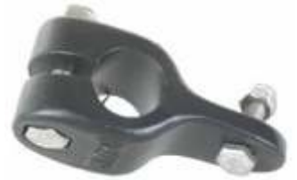
RAM-266U RAM TRI & BI-POD LEG CONECTOR PEDESTAL