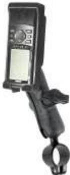
RAP-B-149-GA1 RAM RAIL MOUNT FOR THE GARMIN GPS 12 SERIES