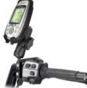
RAM-B-174-MA2 RAM BRAKE/CLUTCH RESERVOIR FOR THE MAGELLAN MERIDIAN