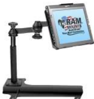
RAM-VB-158-MOT4 VEHICLE SYSTEM FOR THE 2005- NEWER JEEP WRANGLER