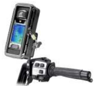
RAM-B-174-AQ1 RAM BRAKE/CLUTCH RESERVOIR LARGE SIZE AQUA BOX