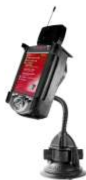
RAP-105-6224-CO1 RAM FLEX ARM MOUNT FOR THE HP IPAQ 3600 & 5100 SERIES