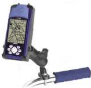
RAM-B-149Z-GA4 RAM U-BOLT MOUNT FOR THE GARMIN E-MAP