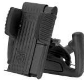
RAM-B-120-YK1 RAM HAND HELD HOLDER WITH YOKE C-CLAMP