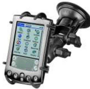
RAP-B-104-224-PD3 RAM RATCHET/PIVOT MOUNT UNIVERSAL PDA