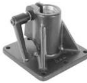
RAM-D-299U RAM 5" X 5" BASE WITH 1" PIPE FEMALE