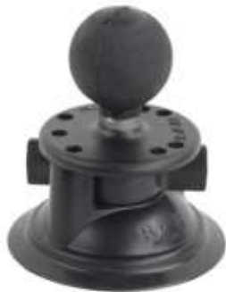
RAP-224-1CU RAM TWIST LOCK WITH 1 1/2" BALL