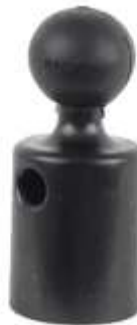
RAP-B-294U RAM 1" BALL WITH FEMALE SLIP PIPE SOCKET