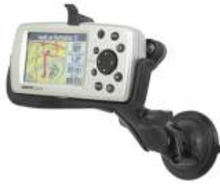
RAM-B-166-GA15 RAM SUCTION MOUNT FOR THE GARMIN QUEST