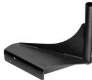
RAM-VB-151 VEHICLE BASE SEATS INC.