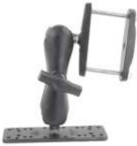
RAM-111-247U-3 RAM MOUNT 111B, 3" SQUARE TUBE BASE