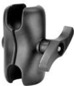
RAM-E-201U-D RAM DOUBLE SOCKET D SHORT ARM