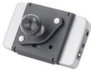
RAM-B-238-XM1U RAM BASE & BALL WITH MOUNTING HARDWARE