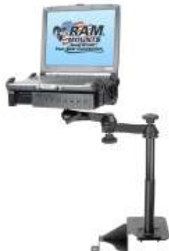
RAM-VB-141-SW1 VEHICLE SYSTEM FOR THE 2003- NEWER JEEP LIBERTY