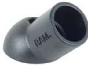
RAP-288PU RAM 45 DEGREE ADJUSTABLE BASE WITH FEMALES FOR PIPE