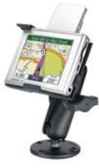
RAM-B-138-GA21 RAM MOUNT FOR GARMIN NUVI