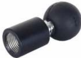
RAM-218-1 RAM SINGLE BALL WITH 1/2" NPT HOLE