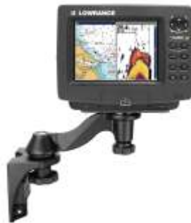
RAM-109V RAM SINGLE SWING ARM MOUNT SYSTEM WITH VERTICAL BASE