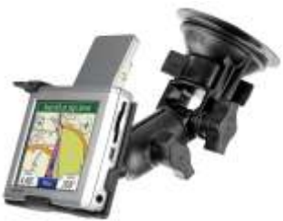
RAP-B-104-224-GA21 RAM RATCHET/PIVOT MOUNT FOR THE GARMIN NUVI