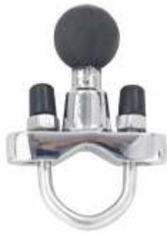
RAM-B-231CHU CHROME RAM WITH U-BOLT FOR 3/4" TO 1" DIAMETER