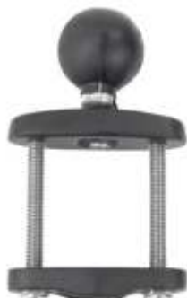
RAM-247U-2 RAM CLAMP BASE WITH BALL 2" MAX WIDTH