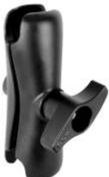
RAM-D-201U RAM DOUBLE SOCKET ARM D BALLS