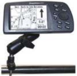
RAM-B-145R RAM U-BOLT BASE WITH 1" BALL FOR THE GARMIN STREETPILOT