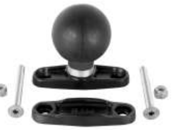
RAM-D-162V-MC3 RAM VERT. SWING ARM SYSTEM WITHOUT BALL BASE