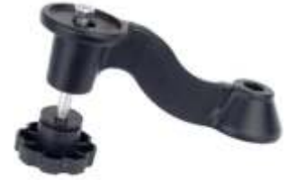
RAM-109-1A RAM SINGLE SWING ARM EXTENTION