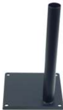
RAM-VBD-125 VEHICLE BASE CHEVY PICKUP