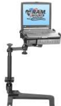
RAM-VB-131A-SW1 VEHICLE SYSTEM FOR THE 2000- NEWER HUMMER H2