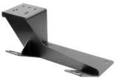
RAM-VB-108 VEHICLE BASE FOR THE 2000-NEWER EXCURSION & 1999-NEWER F250