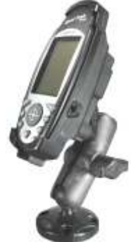
RAP-B-138-MA3 RAM MOUNT FOR THE MAGELLAN SPORTRAK