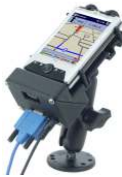
RAM-B-138-CO5P RAM STUD MOUNT FOR POWERED IPAQ FAMILY