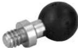
RAM-A-237U RAM 9/16" BALL WITH 1/4"-20 STUD