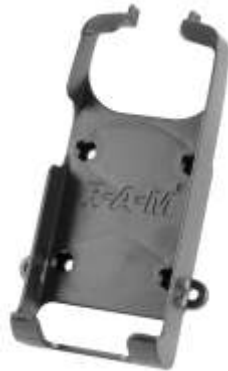
RAM-HOL-GA4 RAM HOLDER FOR THE GARMIN E- MAP