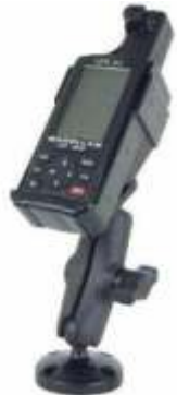
RAP-B-138-MA1 RAM MOUNT FOR THE MAGELLAN 12, 300, 315 & 320