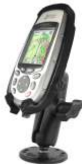
RAM-B-138-MA2 RAM MOUNT FOR THE MAGELLAN MERIDIAN