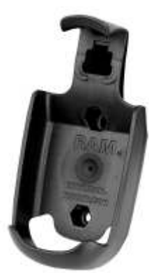
RAM-HOL-MA5U RAM HOLDER FOR THE MAGELLAN EXPLORIST