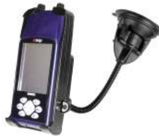
RAP-105-6224-GA4 RAM FLEX ARM MOUNT FOR THE GARMIN E-MAP