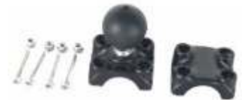
RAM-219 RAM 1 1/4" OD RAIL MOUNT ADAPTER WITH BALL