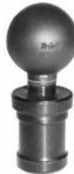
RAM-218U RAM BALL WITH 1 1/8" POST FOR PHOTO