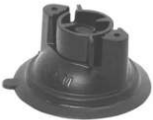
RAP-224-1 RAM 3.3" DIAMETER SUCTION CUP WITH TWIST LOCK