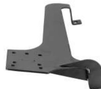
RAM-VB-132 VEHICLE BASE FOR THE 2006-NEWER HONDA RIDGELINE