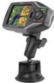
RAM-B-166-MA4 RAM SUCTION MOUNT FOR THE MAGELLAN ROADMATE