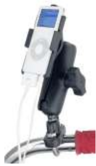
RAM-B-149Z-AP2 RAM U-BOLT MOUNT FOR THE IPOD NANO