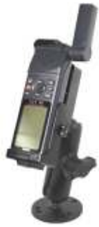
RAM-B-138-GA3 RAM MOUNT FOR GARMIN 48,45,89,90,92