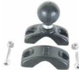
RAM-271U-12 RAM 1 1/4"-1 7/8" DIAMETER RAIL BASE WITH BALL