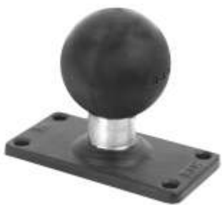
RAM-D-202U-24 RAM BASE 2" X 4" WITH 2 1/4" DIAMETER BALL