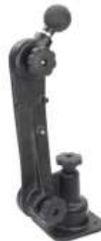
RAM-D-162H-MC4 RAM RATCHET SWING ARM WITH 2 1/4" BALL