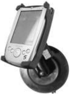
RAM-B-148-DE1 RAM SUCTION MOUNT FOR THE DELL AXIM 5