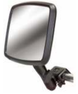
RAM-B-126 RAM WATER SKI MIRROR WITH WINDSHIELD BRACKET