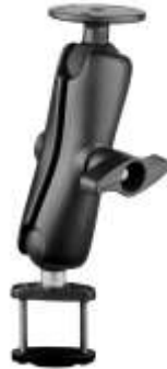
RAM-D-101U-HY2 RAM MOUNT WITH ROUND BASE & 2.5" PLATE