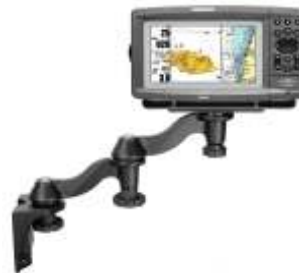
RAM-109V-1 RAM DOUBLE SWING ARM MOUNT SYSTEM WITH VERTICAL BASE