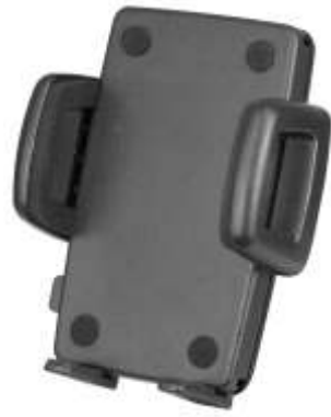
RAM-HOL-UN3 RAM LARGE BLACK MOBILE PHONE HOLDER