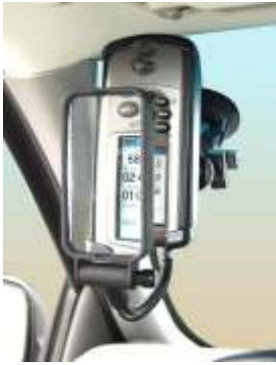
RAM-MAG-1 RAM BIG SCREEN GPS MAGNIFIER 2" X 4" 2X