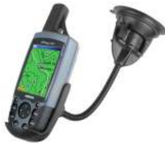
RAP-105-6224-GA12 RAM FLEX ARM MOUNT FOR THE GARMIN 60 SERIES