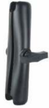
RAM-201U-D RAM DOUBLE SOCKET ARM C BALL D LENGTH