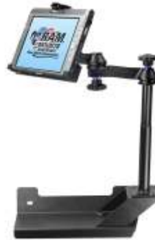
RAM-VB-104-MOT3 VEHICLE SYSTEM FOR THE RAM 1500 & RAM 2500/3500