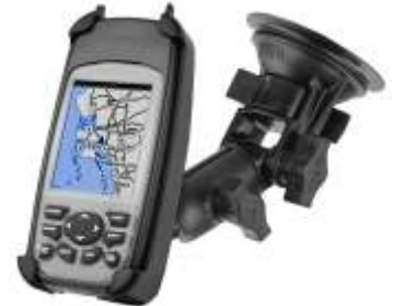
RAP-B-104-224-LO3 RAM RATCHET/PIVOT MOUNT FOR THE LOWRANCE IFINDER H2O & MAP