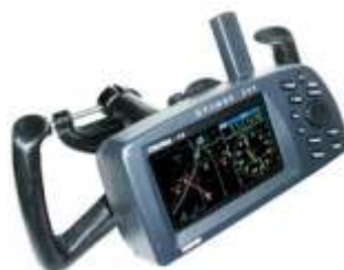
RAM-B-121-G1 RAM YOKE MOUNT WITH MOUNTING HARDWARE