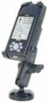
RAP-B-138-GA4 RAM MOUNT FOR THE GARMIN E-MAP