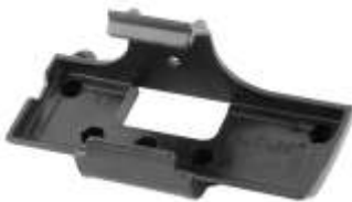
RAM-HOL-GA2 RAM HOLDER GARMIN FOR THE GPS II & III SERIES