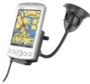
RAP-105-6224-GA11 RAM FLEX ARM MOUNT GARMIN ADAPTER