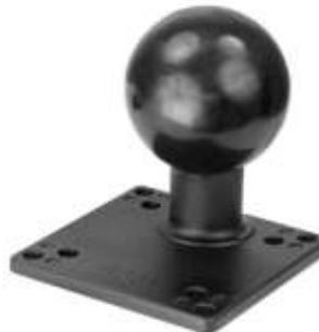
RAM-E-246U RAM 4.75 SQUARE VESA BASE 100 & 75 MIL.