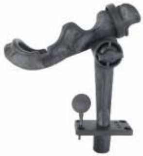
RAM-114-F RAM ROD 2000 ROD HOLDER WITH FLUSH MOUNT