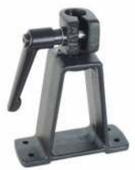
RAM-161BU RAM BI-POD BASE WITH NO PEDESTAL OR BALL