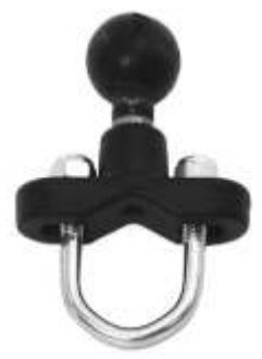
RAM-B-231Z RAM RAIL BASE WITH BALL & ZINC U-BOLT