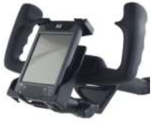
RAM-B-121-PD1U RAM UNIVERSAL PDA CRADLE /YOKE CLAMP