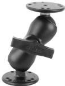
RAM-101U-B RAM MOUNT WITH 2 2 1/2" BASES & B ARM