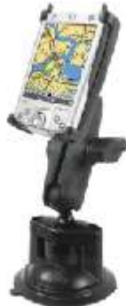
RAP-B-166-CO3U RAM SUCTION SYSTEM FOR THE HP IPAQ 2000 SERIES