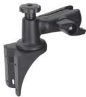
RAM-D-162V-MC3 RAM VERTICAL SWING ARM SYSTEM WITHOUT BALL BASE