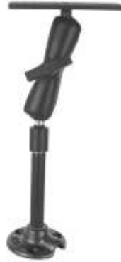
RAM-134-90 RAM 90 DEGREE BASE 6" PIPE DOUBLE SOCKET MOUNT