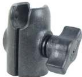
RAP-B-200-1 RAM SINGLE SOCKET ARM WITHOUT OCTAGON SOCKET