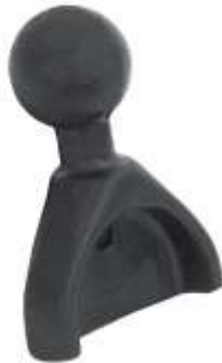
RAM-B-202U-TO1 RAM TOMTOM GO BASE