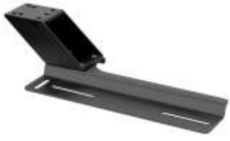
RAM-VB-106R4 VEHICLE BASE FOR THE DODGE SPRINTER VAN