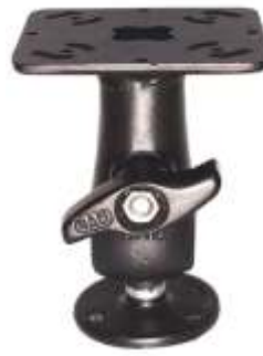
RAM-D-112-D RAM MOUNT WITH PLATE FOR DOWNRIGGERS