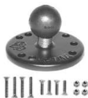
RAM-B-202-G1 RAM BASE & BALL WITH MOUNTING HARDWARE