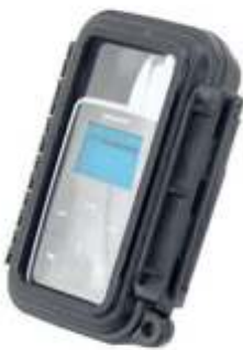
RAM-HOL-AQ3 RAM SMALL SIZE AQUA BOX