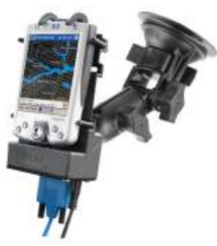
RAP-B-104-224-CO5P RAM RATCHET/PIVOT POWERED IPAQ FAMILY