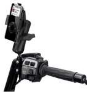
RAM-B-174-AP2 RAM BRAKE/CLUTCH RESERVOIR FOR THE APPLE IPOD NANO