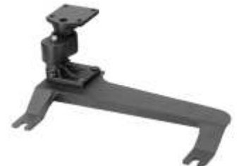
RAM-VB-131A VEHICLE BASE FOR THE 2000- NEWER HUMMER H2