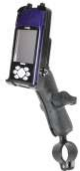
RAP-B-149-GA4 RAM RAIL MOUNT FOR THE GARMIN E-MAP