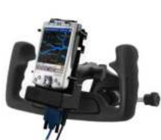
RAM-B-121-CO5P RAM YOKE SYSTEM UNIVERSAL IPAQ SERIES