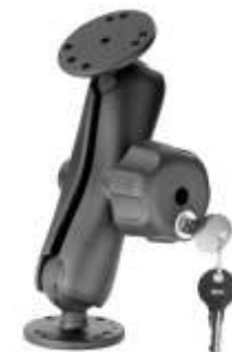
RAM-101U-BL RAM MOUNT WITH 2 2 1/2" & B ARM