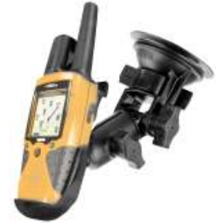
RAP-B-104-224-GA8 RAM RATCHET/PIVOT MOUNT FOR THE GARMIN RINO