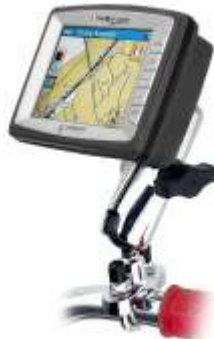
RAM-B-149CH-LO4 RAM U-BOLT MOUNT SHORT ARM, DIA BASE CHROME