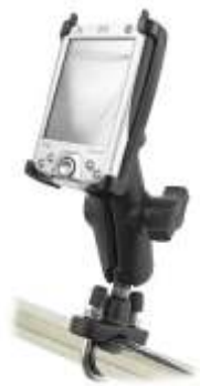
RAM-B-149Z-CO3 RAM U-BOLT MOUNT FOR THE HP 2000 IPAQ