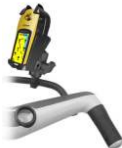
RAM-B-175-A-GA16U RAM ETREX COLOR WITH SEGWAY SHORT ARM