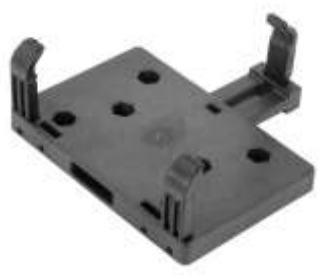
RAM-HOL-PD2 RAM UNIVERSAL 3 FINGER PDA HOLDER