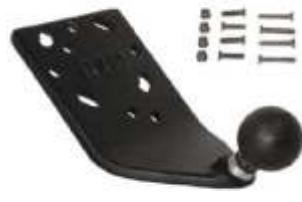
RAM-B-125B-G1U RAM FOR YOKES WITH MOUNTING HARDWARE