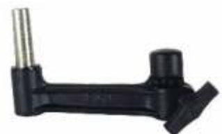
RAM-261-1U RAM 6" EXTENSION SWING ARM 1/2" PIPE