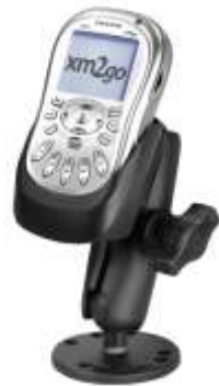
RAM-B-138-XM1 RAM MOUNT FOR XM SATELLITE RADIOS