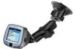
RAM-B-166-GA22 RAM SUCTION MOUNT FOR THE GARMIN STREETPILOT I SERIES