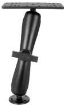
RAM-111-D RAM MOUNT WITH 1.5" BALLS & D LENGTH ARM