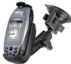
RAM-B-166-MA5 RAM SUCTION MOUNT FOR THE MAGELLAN EXPLORIST SERIES