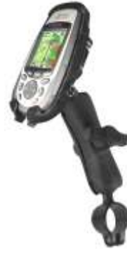
RAP-B-149-MA2 RAM U-BOLT MOUNT FOR THE MAGELLAN MERIDIAN