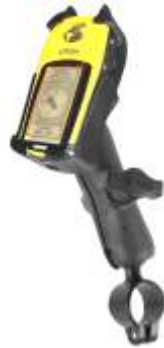
RAP-B-149-GA5 RAM RAIL MOUNT FOR THE GARMIN E-TREX