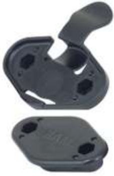
RAP-326 RAM EZY-MOUNT QUICK RELEASE ADAPTER SYSTEM