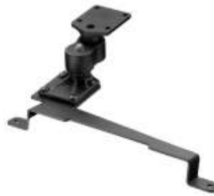
RAM-VB-163 VEHICLE BASE FOR THE 2005- NEWER HONDA PILOT