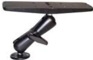
RAM-137U RAM MOUNT WITH 3" X 11" X 2 1/2" BASE