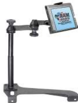
RAM-VB-135MH1-MOT3 VEHICLE SYSTEM FOR THE 2006- NEWER HONDA ELEMENT