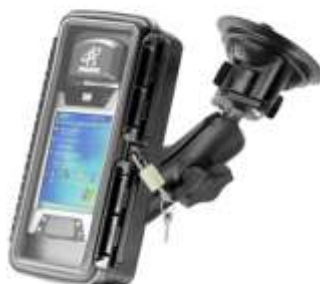
RAM-B-149Z-AQ1 RAM SUCTION MOUNT LARGE SIZE AQUA BOX