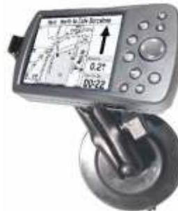
RAM-B-148-GA7 RAM SUCTION MOUNT FOR THE GARMIN 176, 276, 296