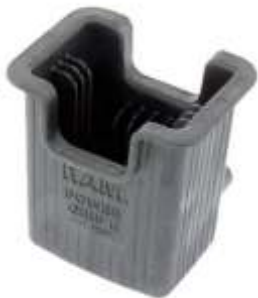
RAP-303U RAM POWER GRIP II