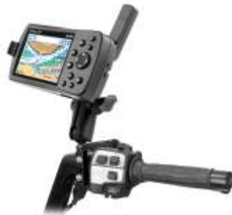
RAM-B-174-GA7 RAM BRAKE/CLUTCH RESERVOIR FOR THE GARMIN 176, 276 & 296