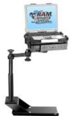
RAM-VB-116-SW1 VEHICLE SYSTEM FOR THE 2004-NEWER COLORADO