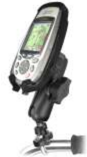
RAM-B-149Z-MA2 RAM U-BOLT MOUNT FOR THE MAGELLAN MERIDIAN