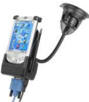
RAP-105-6224-CO4P RAM FLEX ARM MOUNT POWERED DOCK FOR THE IPAQ 1900 & 4100