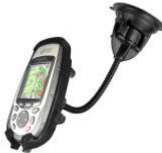
RAP-105-6224-MA2 RAM FLEX ARM MOUNT FOR THE MAGELLAN MERIDIAN