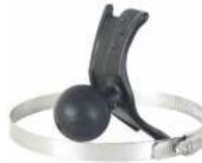
RAM-118B RAM SADDLE WITH BALL FOR LANTERNS