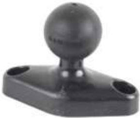
RAP-B-238 RAM 2.5" X 1 5/16" BASE WITH BALL