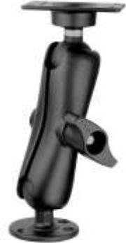
RAM-D-101U-GAM1 RAM MOUNT. D-243, D-201, D-254