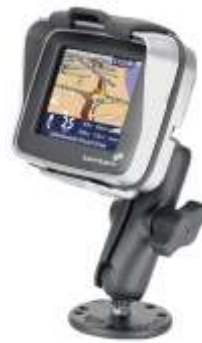
RAM-B-138-TO2 RAM MOUNT FOR THE TOMTOM RIDER