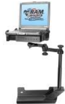
RAM-VB-104-SW1 VEHICLE SYSTEM FOR THE RAM 1500 & RAM 2500/3500