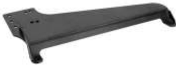
RAM-VB-150-MOT4 VEHICLE SYSTEM FOR THE 2005- NEWER SCION XB