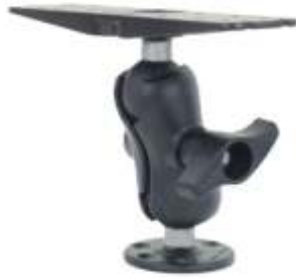
RAM-D-111U-C RAM MOUNT WITH 3" X 11" BASE SHORT ARM