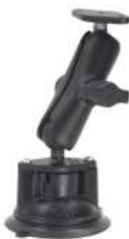
RAM-B-166 RAM SUCTION MOUNT TWIST LOCK