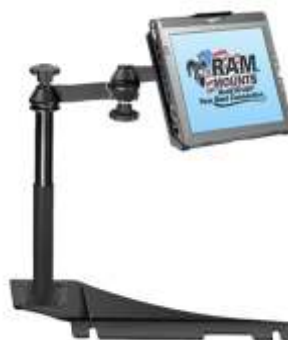
RAM-VB-160-MOT4 VEHICLE SYSTEM FOR THE 2006- NEWER CHEVY IMPALA