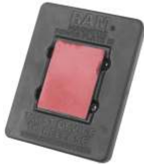
RAP-300-1 RAM MAGNETIC POWER PLATE III