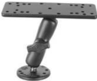
RAM-B-111 RAM UNIVERSAL ELECTRICAL MOUNT 6 1/4" X 2"