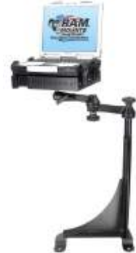
RAM-VB-143-SW1 VEHICLE SYSTEM FOR THE 200 NEWER- EXPRESS SAVANA VAN