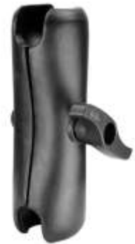
RAM-E-201U RAM DOUBLE SOCKET ARM E BALLS