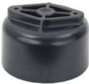
RAP-318U RAM-A-SNACK ROUND STYLE CONTAINER