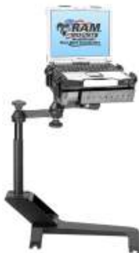
RAM-VB-131R4-SW1 VEHICLE SYSTEM FOR THE 2000- NEWER 2500 & 3500 SU POWER