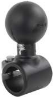
RAM-D-313-CU 1/2" RAIL BASE WITH 2 1/4" DIAMETER BALL