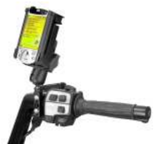
RAM-B-174-CO2 RAM BRAKE/CLUTCH RESERVOIR FOR IPAQ 3000, 5000