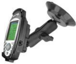
RAM-B-148-MA3 RAM SUCTION MOUNT FOR THE MAGELLAN SPORTRAK