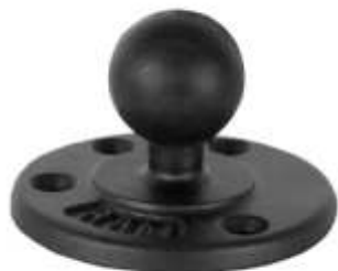
RAM-240 RAM 3.68 DIA BASE WITH BALL