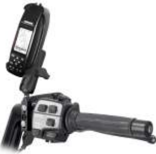
RAM-B-174-LO1 RAM BRAKE/CLUTCH RESERVOIR FOR THE LOWRANCE GLOBALMAP