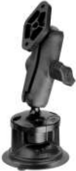
RAP-B-224-138U RAM 3.3" DIAMETER SUCTION CUP WITH ARM ASSEMBLY