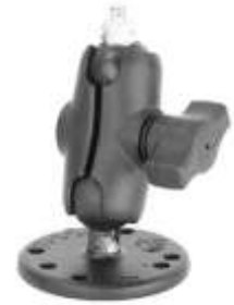
RAM-B-101-A-237PU RAM MOUNT WITH 1 1/4"-20 BASE & 1 SHORT PSA