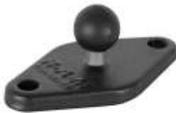
RAM-A-238 A Size Ball 0.56" Diameter