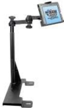
RAM-VB-119-MOT3 VEHICLE SYSTEM FOR THE 1995- NEWER ECONOLINE VAN