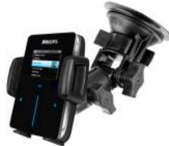
RAP-B-104-224-UN3 RAM UNIVERSAL RATCHET/PIVOT MOUNT FOR MEDIUM SIZE DEVICES