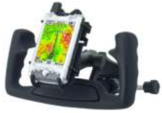
RAM-B-121-PD3 RAM YOKE SYSTEM UNIVERSAL PDA MOUNT