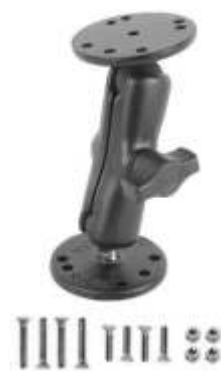
RAM-B-101-G1 RAM MOUNT WITH MOUNTING HARDWARE