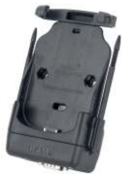
RAM-HOL-CO4P RAM POWERED DOCK FOR THE HP IPAQ 4100 SERIES