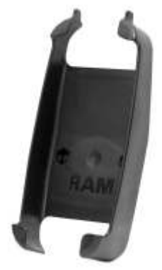
RAM-HOL-LO3 RAM HOLDER FOR THE LOWRANCE IFINDER H20 & MAP