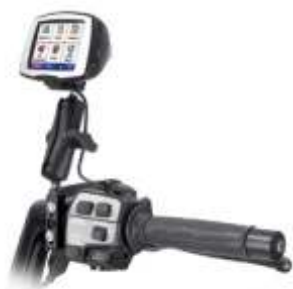
RAM-B-174-GA19 RAM BRAKE/CLUTCH RESERVOIR FOR THE GARMIN C320