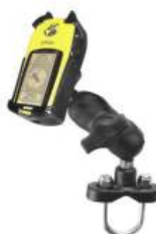
RAM-B-149ZA-GA5U ETREX MOUNT WITH A ARMS AND U-BOLT BASE