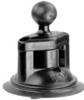
RAP-B-224-1U RAM 3.3" DIAMETER SUCT CUP WITH 1" PLASTIC BALL