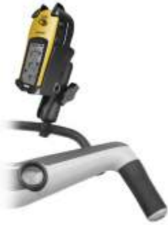
RAM-B-175-GA5U RAM ETREX HOLDER WITH SEGWAY BASE