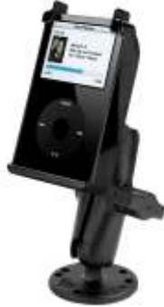
RAM-B-138-AP1 RAM MOUNT WITH 2 7/16" BASE FOR APPLE IPOD