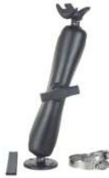
RAM-108-D RAM TROLLING MOTOR STABILIZER WITH LONG ARM