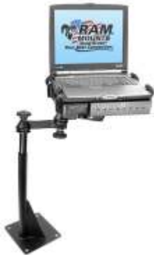
RAM-VBD-122-SW1 VEHICLE SYSTEM UNIVERSAL SQUARE BASE