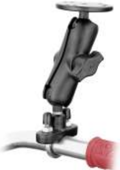
RAM-B-101U-CR1 RAM MOUNT WITH 2 RAM-B-202 AND B-231