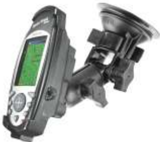
RAP-B-104-224-MA3 RAM RATCHET/PIVOT MOUNT FOR THE MAGELLAN SPORTRAK