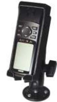
RAM-B-138-GA1 RAM MOUNT FOR GARMIN GPS 12 SERIES