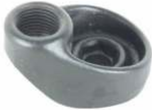
RAM-227U 1/2" NPT HOLE WITH FLANGE (SWING ARM)