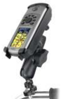
RAM-B-149Z-GA14 RAM U-BOLT FOR THE GARMIN GPS 76CS