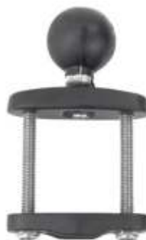
RAM-247U-15 RAM CLAMP BASE WITH BALL 1.5" MAX WIDTH