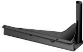
RAM-VB-164 VEHICLE BASE 2005-NEWER SEARS SEATING