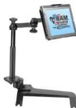
RAM-VB-159-MOT4 VEHICLE SYSTEM FOR THE 2007 CHEVY TAHOE