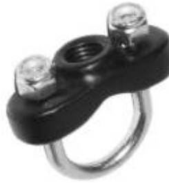
RAM-B-241U RAM SINGLE U-BOLT BASE WITH 1/4" NPT HOLE