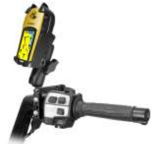
RAM-B-174-GA16 RAM BRAKE/CLUTCH RESERVOIR FOR THE GARMIN ETRIX COLOR