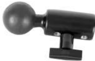
RAM-215 RAM BALL WITH 5/8" HEXAGON HOLE FOR PHOTO