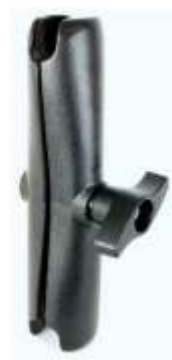
RAM-D-201U-E RAM D SIZE LONG LENGTH ARM