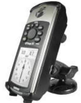
RAP-B-104-GA6UU RAM SNGLE BALL MOUNT GARMIN 76 PROMOTION