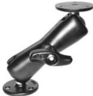
RAM-D-101U RAM MOUNT WITH 2-3.68 BASES WITH BALLS