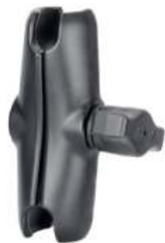
RAM-B-201U-125 125 BULK PACKAGED DOUBLE SOCKET ARMS FOR 1" BALL