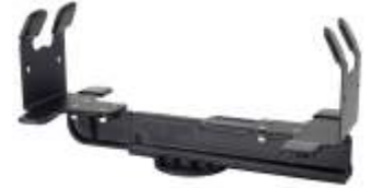
RAM-VPR-103 VEHICLE PRINTER BASE FOR THE HP- 450