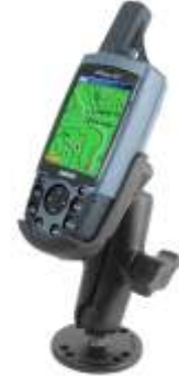
RAM-B-138-GA12 RAM MOUNT FOR GARMIN 60 SERIES