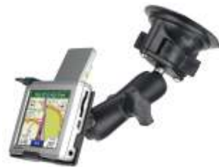
RAM-B-166-GA21 RAM SUCTION MOUNT FOR THE GARMIN NUVI