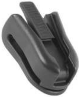
RAP-271-BC RAM RUBBER BELT CLIP WITH QUICK SNAP