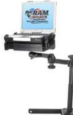
RAM-VB-105-SW1 VEHICLE SYSTEM FOR THE 1997-NEWER DAKOTA & DURANGO