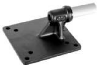
RAM-246PU RAM VESA PLATE WITH 1/2" POST