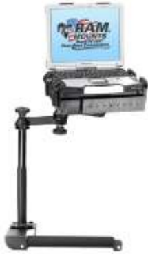
RAM-VB-149 VEHICLE BASE FOR THE 2005-NEWER TOYOTA HIGHLANDER