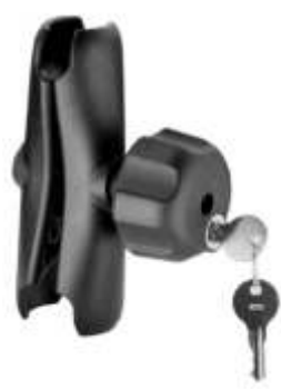
RAM-201U-BL RAM DOUBLE SOCKET ARM C BALL B LOCK