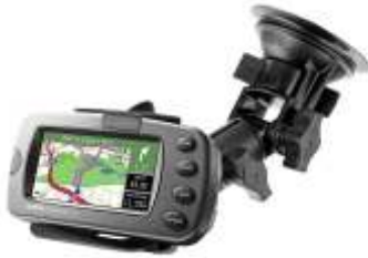
RAP-B-104-224-GA9 RAM RATCHET/PIVOT MOUNT FOR THE GARMIN 2610