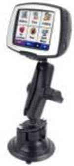
RAM-B-166-GA19U RAM SUCTION MOUNT FOR THE GARMIN C320