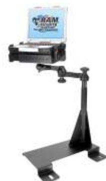
RAM-VB-120-SW1 VEHICLE SYSTEM FOR THE 2004- NEWER FREESTAR