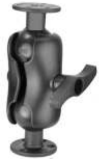
RAM-E-101U-D RAM MOUNT WITH 2 3.68 BASES & SHORT ARMS