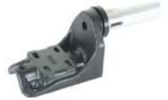
RAM-D-304B-HP RAM HORIZONTAL BASE WITH POST