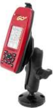
RAP-B-104-224-LO5 RAM MOUNT FOR THE LOWRANCE IFINDER GO