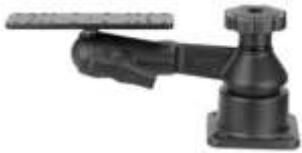
RAM-109HSB RAM SINGLE ARM BALL MOUNT WITH HORIZONTAL BASE