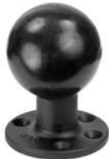
RAM-E-202U RAM 3.68 DIAMETER BASE WITH 3 3/8" BALL