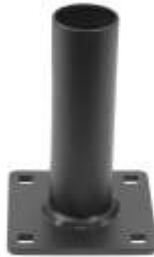
RAM-VP-TBF5U RAM TELE-POLE BASE FEMALE 5" LONG