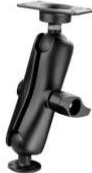
RAM-D-101U-243 RAM MOUNT WITH D-243, D-201 & D-254