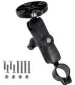
RAP-B-149-G1U RAM MOUNT WITH RAIL & MOUNT HARDWARE