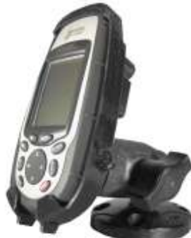
RAP-B-104-MA2UU RAM SINGLE BALL MOUNT MAGELLAN MERIDIAN PROMO