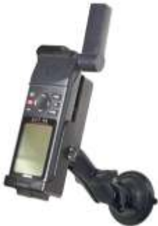
RAM-B-166-GA3 RAM SUCTION MOUNT FOR THE GARMIN 48, 45, 89 & 90