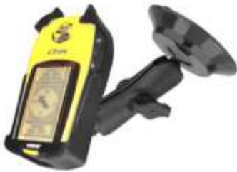
RAM-B-148-GA5 RAM SUCTION MOUNT FOR THE GARMIN E-TREX