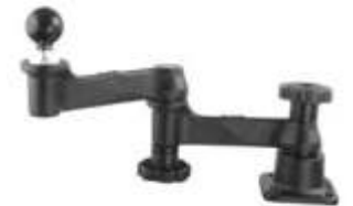
RAM-109H-1BU RAM DOUBLE SWING ARM WITH 1 1/2" BALL