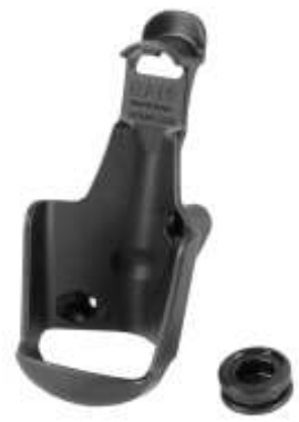
RAM-HOL-GA8 RAM CRADLE FOR THE GARMIN RINO