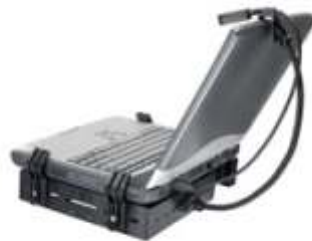
RAM-234-LU RAM USB COMPUTER LIGHT