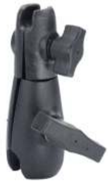
RAP-BC-201U RAM SOCKET ARM WITH 1" AND 1.5" SOCKETS