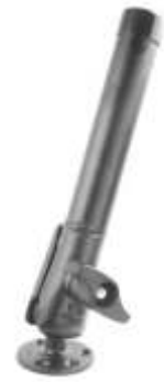
RAM-D-119 RAM TUBE FISHING ROD HOLDER WITH 2 1/4" BALL