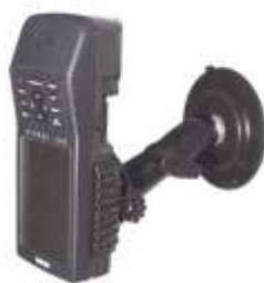
RAM-B-148-G1 RAM SUCTION CUP MOUNT WITH MOUNTING HARDWARE