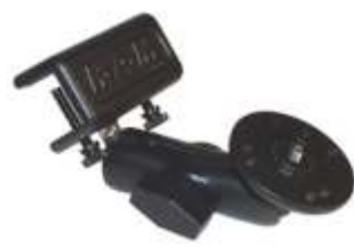
RAM-B-127 RAM WINDOW SCOPE & CAMERA MOUNT