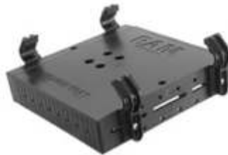
RAM-234-3 RAM UNIVERSAL LAPTOP MOUNT TOUGH TRAY