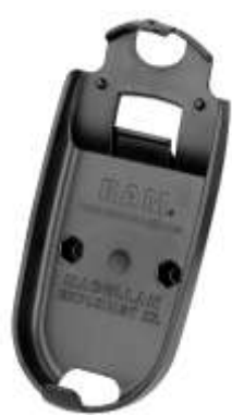
RAM-HOL-MA6U RAM HOLDER FOR THE MAGELLAN EXPLORIST XL