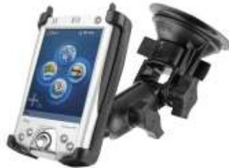
RAP-B-104-224-CO3 RAM RATCHET/PIVOT MOUNT FOR THE IPAQ 2000 SERIES