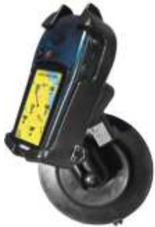
RAM-B-148-GA16U RAM SUCTION FOR THE GARMIN ETREX COLOR