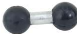
RAM-B-230 RAM DOUBLE 1" BALL ADAPTER