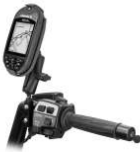
RAM-B-174-MA6 RAM BRAKE/CLUTCH RESERVOIR FOR THE MAGELLAN EXPLORIST XL