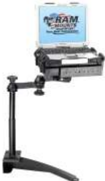
RAM-VB-142-SW1 VEHICLE SYSTEM FOR THE 2005- NEWER GRAND CHEROKEE