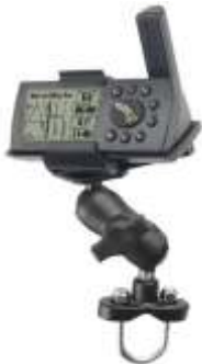
RAM-B-149ZA-GA2 RAM U-BOLT MOUNT WITH A ARM FOR THE GARMIN II & III