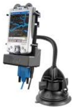
RAP-105-6224-CO5P RAM FLEX ARM MOUNT POWERED IPAQ FAMILY