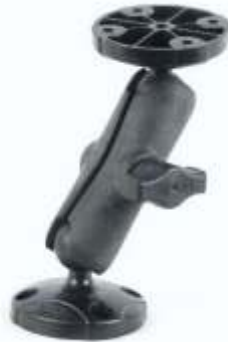
RAP-B-101 RAM MOUNT WITH 2 RAM-B-202 BASES & 2 1/2" DIAMETER ARM