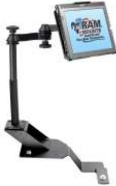
RAM-VB-101-MOT4 VEHICLE SYSTEM FOR THE 1995-NEWER SONOMA BLAZER & S10