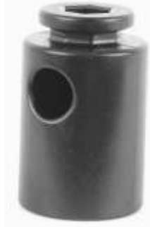
RAP-276 RAM FEMALE PIPE SOCKET WITHOUT OCTAGON BUTTON