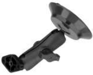
RAP-B-148U RAM SUCTION MOUNT WITH 2.47 DIAMETER X 2.47