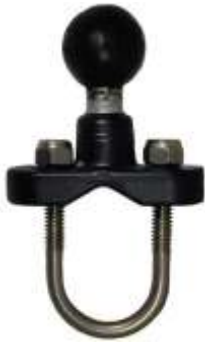
RAM-B-231-1U RAM WITH U-BOLT FOR UP TO 1.25" DIAMETER