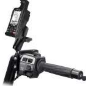
RAM-B-174-MA1 RAM BRAKE/CLUTCH RESERVOIR FOR THE MAGELLAN 12, 300 & 315