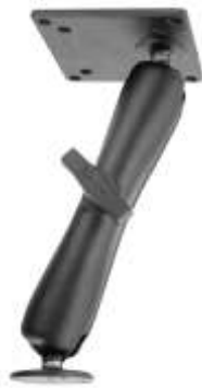
RAM-101U-D-246 RAM MOUNT LONG ARM VESA PLATE