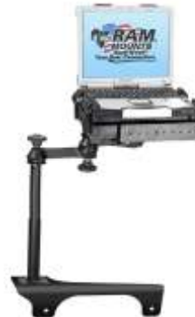
RAM-VB-165-SW1 VEHICLE SYSTEM FOR THE 2006- NEWER HUMMER H3