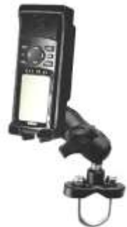
RAM-B-149ZA-GA1 RAM U-BOLT MOUNT WITH AARM FOR THE GARMIN 12 SERIES