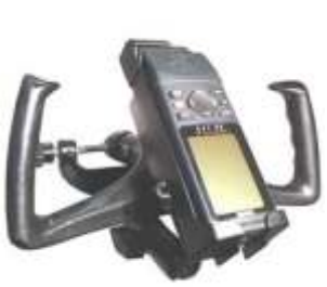
RAM-B-125-GA3 RAM YOKE MOUNT WITH CRADLE GARMIN 89, 90,92