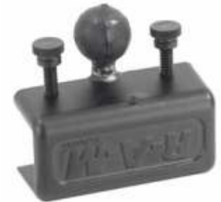
RAM-B-259U RAM 1" X 1" U-CHANNEL CLAMP WITH 1" BALL