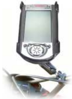
RAM-B-149Z-CO1 RAM U-BOLT MOUNT FOR THE HP IPAQ