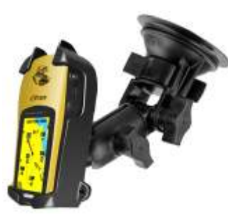
RAP-B-104-224-GA16 RAM RATCHET/PIVOT MOUNT FOR THE GARMIN ETREX COLOR