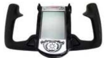
RAM-B-121-CO1 RAM YOKE MOUNT FOR HP IPAQ