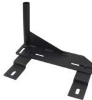
RAM-VB-121 VEHICLE BASE FOR THE 1996- NEWER CARAVAN