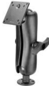
RAM-E-101U-246 RAM MOUNT VESA PLATE & 3.68 BASE WITH BALL