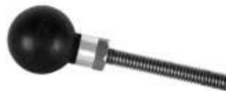
RAM-B-273U RAM BASE WITH 1/4"-20 HOLE HEX & 1" BALL