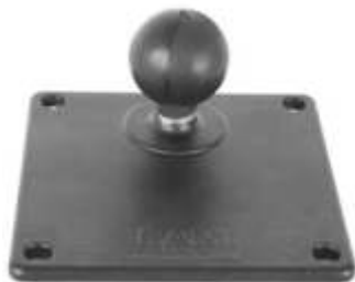
RAM-2461U RAM 3 5/8" SQ. 75 MIL. VESA BASE WITH BALL