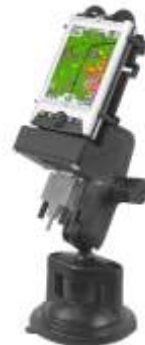
RAP-B-166-CO5P RAM SUCTION SYSTEM UNIVERSAL IPAQ SERIES