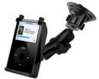
RAM-B-166-AP1 RAM SUCTION MOUNT FOR THE APPLE IPOD