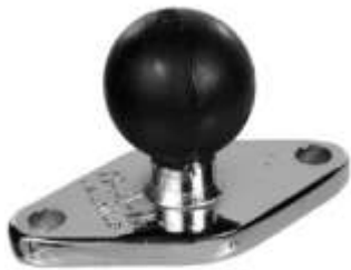
RAM-B-238CHU CHROME RAM 2 7/16" X 1 5/16" BASE WITH BALL