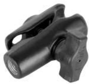
RAM-B-200-1 RAM SINGLE BALL SOCKET ARM FOR 1" BALLS