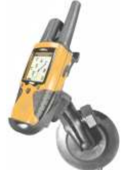
RAM-B-148-GA8 RAM SUCTION MOUNT FOR THE GARMIN RINO