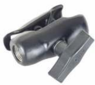
RAM-200-1 RAM SINGLE BALL ARM WITH 1/2" NPT HOLE