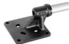
RAM-2461PU RAM SMALL 75 MM VESA PLATE WITH 1/2" POST