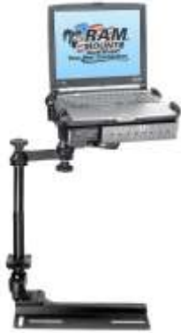
RAM-VB-147-SW1 VEHICLE SYSTEM FOR THE 2006- NEWER DODGE STRATUS