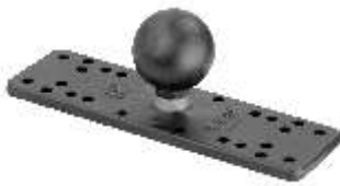
RAM-111B RAM MARINE ELETRONICS BASE 6 1/4" X 2"