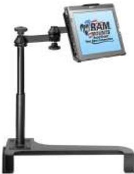
RAM-VB-150-MOT4 VEHICLE SYSTEM FOR THE 2005- NEWER SCION XB