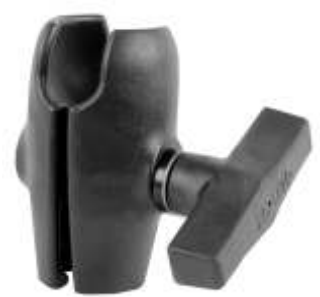
RAP-200-1U RAM SING. SOCKET ARM WITHOUT OCTAGON FEMALE