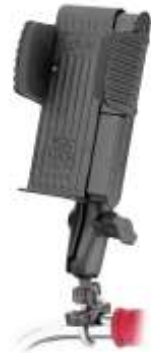
RAM-B-120-231Z RAM HAND HELD MOUNT WITH ZINC U-BOLT CLAMP