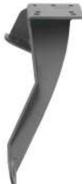
RAM-VB-142 VEHICLE BASE FOR THE 2005- NEWER GRAND CHEROKEE