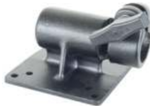
RAM-D-246HU VESA BRACKET WITH 1" HOLE