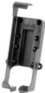
RAM-HOL-GA3 RAM HOLDER FOR THE GARMIN 45, 48, 89, 90 & 92