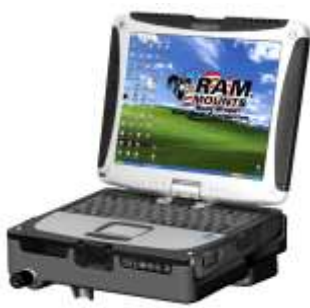
RAM-234-PAN2P RAM PANASONIC LAPTOP MOUNT CF-18 TOUGH TRAY PLASTIC