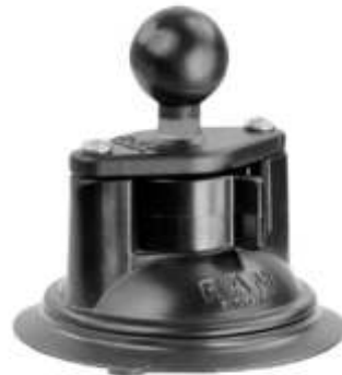
RAM-B-224-1U RAM 3.3" DIAMETER SUCTION CUP WITH 1" METAL BALL