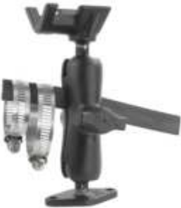
RAM-B-108-238 RAM STRAP CLAMP MOUNT WITH DIAMOND BASE