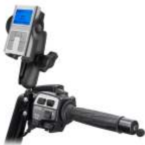
RAM-B-174-UN1 RAM BRAKE/CLUTCH RESERVOIR FOR SMALL SIZE DEVICES