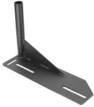
RAM-VB-117 VEHICLE BASE FOR THE 1993-NEWER CAMARO & 1991-NEWER CROWN VIC