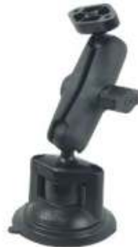
RAP-B-166 RAM MOUNT WITH SUCTION BASE DOUBLE ARM DIAMETER