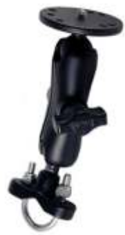
RAM-B-149Z-C1 RAM VIDEO CAMERA MOUNT FOR RAILS & BARS