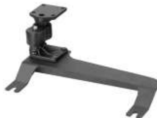
RAM-VB-159 VEHICLE BASE FOR THE 2007 CHEVY TAHOE