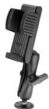
RAM-120 RAM SYSTEM WITH QUICK RELEASE HAND HELDS