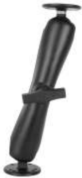
RAM-101U-D RAM MOUNT WITH 2 2 1/2" BASES & D