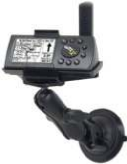
RAM-B-166-GA2 RAM SUCTION MOUNT FOR THE GARMIN 2, 3 & 5