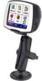
RAM-B-138-GA19U RAM MOUNT FOR GARMIN C320, C330, C340