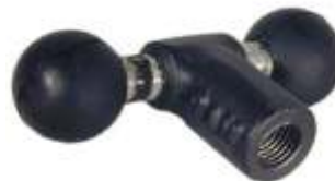
RAM-B-217-1 RAM DOUBLE BALL BASE WITH 1/4" NPT NO FLANGE