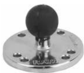
RAM-B-202CHU CHROME RAM 2 1/2" DIAMETER BASE WITH BALL