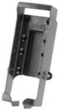
RAM-HOL-GA1 RAM HOLDER FOR THE GARMIN GPS 12 SERIES