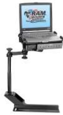
RAM-VB-106R4-SW1 VEHICLE SYSTEM FOR THE DODGE SPRINTER VAN