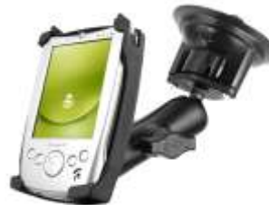
RAM-B-166-DE1 RAM SUCTION MOUNT FOR THE DELL AXIM X5