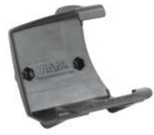
RAM-HOL-GA9U RAM CUSTOM HOLDER FOR THE GARMIN 2610,