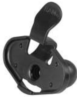
RAP-326FU RAM EZY-MOUNT QUICK RELEASE FEMALE