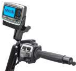
RAM-B-174-XM1 RAM BRAKE/CLUTCH RESERVOIR FOR XM SATELLITE RADIOS