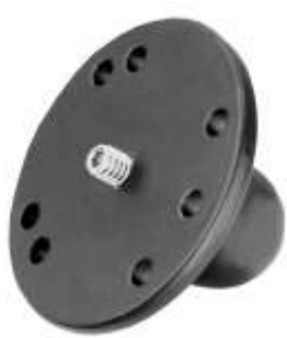
RAM-B-202A RAM 2 1/2" DIAMETER BASE WITH 1/4" 20 STST STUD