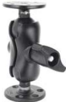
RAM-D-101U-C RAM MOUNT WITH 2 3.68 BASES & C ARM