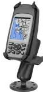
RAM-B-138-LO3 RAM MOUNT FOR THE FOR LOWRANCE IFINDER H20