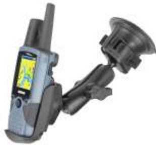
RAM-B-166-GA20 RAM SUCTION MOUNT FOR THE GARMIN RINO 520 & 530