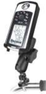
RAM-B-149Z-GA6 RAM U-BOLT MOUNT FOR THE GARMIN GPS 76 SERIES