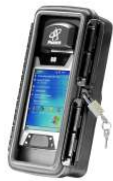
RAM-HOL-AQ1 RAM LARGE SIZE AQUA BOX