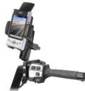
RAM-B-174-UN3 RAM BRAKE/CLUTCH RESERVOIR FOR MEDIUM SIZE DEVICES