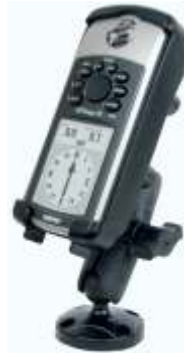
RAP-B-138-GA6 RAM MOUNT FOR THE GARMIN GPS 76 SERIES