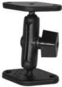
RAM-A-101 RAM DBL. BALL MOUNT WITH 9/16" BALLS