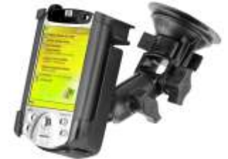
RAP-B-104-224-CO2 RAM RATCHET/PIVOT MOUNT FOR THE IPAQ 3000 & 5000 SERIES