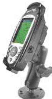
RAM-B-138-MA3 RAM MOUNT FOR THE MAGELLAN SPORTRAK