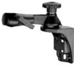
RAM-109VS-4U RAM STRAIT SWING ARM WITH VERTICAL BASE