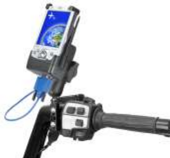
RAM-B-174-CO3P RAM BRAKE/CLUTCH RESERVOIR POWERED DOCK FOR THE HP IPAQ 2000 SERIES