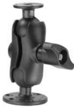
RAM-D-101-C-254U RAM MOUNT WITH 3.68 BASE & 2.5 BASE