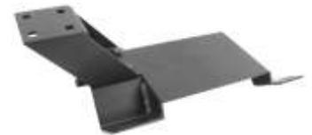
RAM-VB-110 VEHICLE BASE FOR THE 1997-03 EXPEDITION & F150