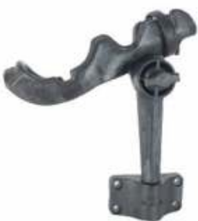
RAM-114-B RAM ROD 2000 ROD HOLDER WITH BULKHEAD MOUNT