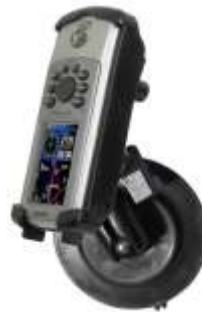
RAM-B-148-GA14 RAM SUCTION FOR THE GARMIN GPS 76CS