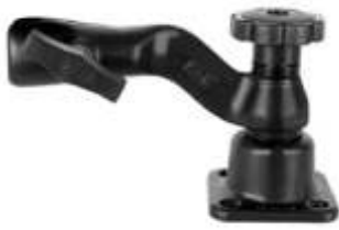
RAM-109H-4U RAM BENT SWING ARM WITH HORIZONTAL BASE