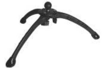
RAM-B-205U TRI-POD WITH 1" BALL