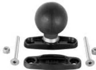
RAM-D-247U-2 RAM CLAMP BASE WITH BALL 2" MAXIMUM WIDTH