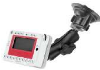
RAM-B-166-XM1 RAM SUCTION MOUNT FOR XM SATELLITE RADIOS