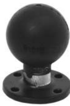
RAM-D-254U 2 7/16" DIAMETER BASE WITH 2 1/4" BALL (AMPS)