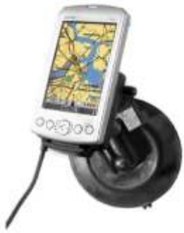
RAM-B-148-GA11 RAM SUCTION MOUNT GARMIN ADAPTER