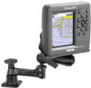
RAM-109H-2 RAM HORIZONTAL SWING ARM WITH RAM BALL SYSTEM