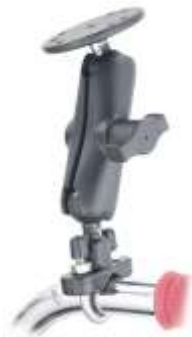
RAM-B-149Z-202U RAM U-BOLT MOUNT WITH 202 BASE