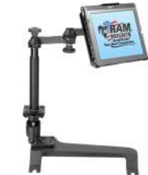
RAM-VB-131A-MOT4 VEHICLE SYSTEM FOR THE 2000- NEWER HUMMER H2