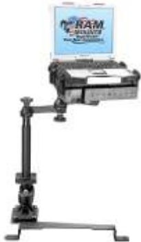
RAM-VB-163-SW1 VEHICLE SYSTEM FOR THE 2005- NEWER HONDA PILOT