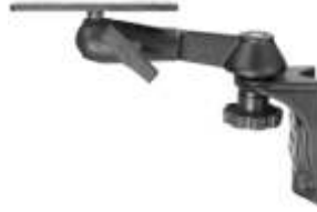
RAM-109VSB RAM SINGLE ARM BALL MOUNT WITH VERTICAL BASE