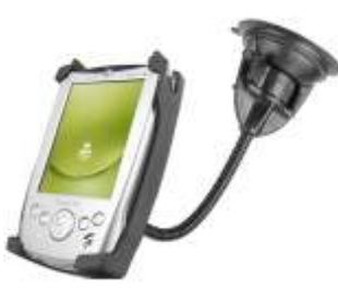
RAP-105-6224-DE1 RAM FLEX ARM MOUNT FOR THE DELL AXIM X5