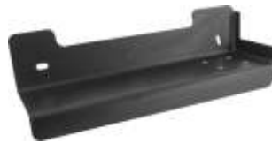
RAM-VB-104 VEHICLE BASE FOR THE RAM 1500 & RAM 2500/3500