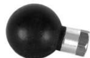
RAM-B-337U RAM BASE WITH 1/4"-20 HOLE HEX & 1" BALL