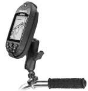
RAM-B-149Z-MA6 RAM RAIL MOUNT FOR THE MAGELLAN EXPLORIST XL