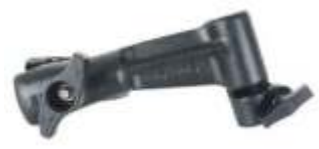
RAM-D-261U RAM SINGLE SWING ARM BALL SOCKET 1" PIPE