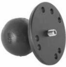
RAM-202A RAM BALL BASE WITH 1/4"-20 STST STUD