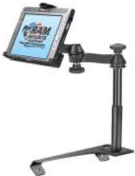
RAM-VB-166-MOT3 VEHICLE SYSTEM FOR THE 2006- NEWER FORD EXPEDITION