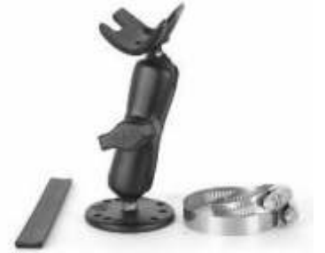
RAM-B-108 RAM WITH STUD BASE & V BASE WITH STRAPS 1/2-2