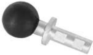
RAM-208 RAM BALL WITH 5/8" OD POST FOR PHOTO LIGHT