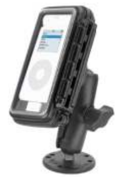
RAM-B-138-AQ2 RAM MOUNT WITH 2 7/16" BASE FOR AQUA BOX MEDIUM