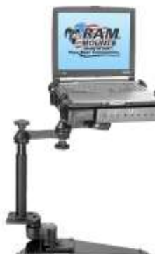
RAM-VB-138ST1-SW1 VEHICLE SYSTEM FOR THE 2006- NEWER TOYOTA FJ CRUISER