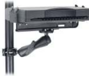
RAM-VPR-102-1 VEHICLE PRINTER SYSTEM FOR THE CANON BJC-85