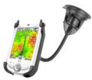
RAP-105-6224-CO4 RAM FLEX ARM MOUNT FOR THE IPAQ 1900 & 4100 SERIES