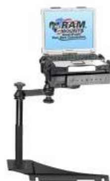
RAM-VB-160-SW1 VEHICLE SYSTEM FOR THE 2006- NEWER CHEVY IMPALA