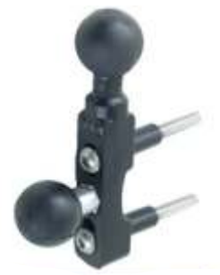
RAM-B-309-2 RAM MOTORCYCLE HANDLEBAR BASE WITH 2 BALLS