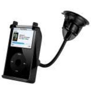
RAP-105-6224-AP1 RAM FLEX ARM MOUNT FOR THE APPLE IPOD