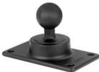
RAM-243 2 13/16" X 5" PLATE WITH BALL