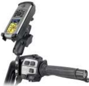
RAM-B-174-GA14 RAM BRAKE/CLUTCH RESERVOIR FOR THE GARMIN GPS 76CS