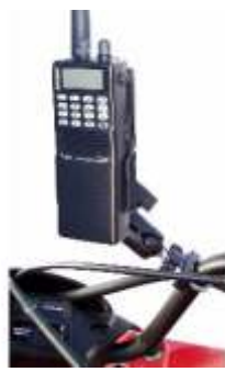
RAM-B-149Z-BC1 RAM WITH U-BOLT BELT CLIP HOLDER HAND-HELD