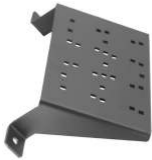
RAM-VB-115 VEHICLE BASE FOR THE 1995-NEWER TAURUS