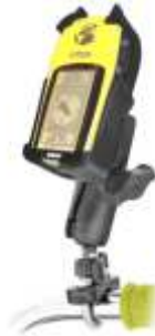
RAM-B-149Z-GA5 RAM MOUNT WITH U-BOLT FOR THE GARMIN E-TREX