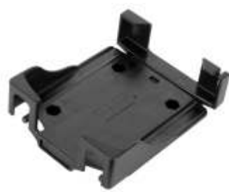
RAM-HOL-PD1 RAM UNIVERSAL PDA HOLDER