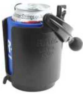
RAM-B-132BU RAM DRINK CUP HOLDER WITH 1" BALL