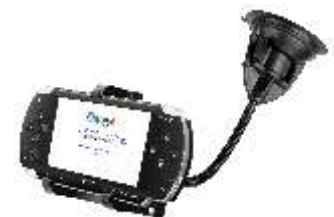
RAP-105-6224-PD2 RAM FLEX ARM MOUNT THREE FINDER PDA HOLDER