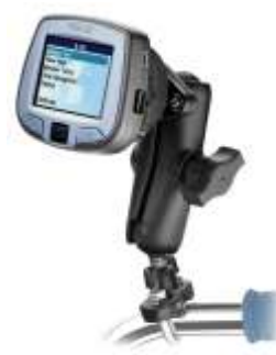
RAM-B-149Z-GA22 RAM U-BOLT FOR THE GARMIN STREETPILOT I SERIES