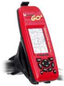
RAP-274-LO5 RAM RAIL MOUNT FOR THE LOWRANCE IFINDER GO