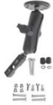
RAM-B-174-G1U RAM GOLDWING WITH AMPS AND HARDWARE