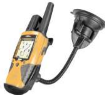
RAP-105-6224-GA8 RAM FLEX ARM MOUNT FOR THE GARMIN RINO