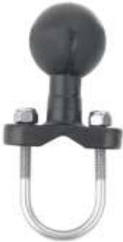
RAM-231-1U RAM 1 1/4" RAIL MOUNT