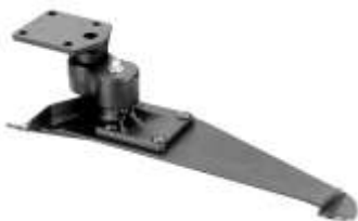
RAM-VB-138ST1 VEHICLE BASE FOR THE 2006- NEWER TOYOTA FJ CRUISER