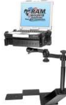
RAM-VB-109-SW1 VEHICLE SYSTEM FOR THE 2004-NEWER F150