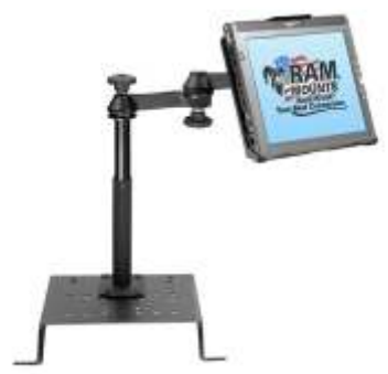
RAM-VB-115-MOT4 VEHICLE SYSTEM FOR THE 1995-NEWER TAURUS