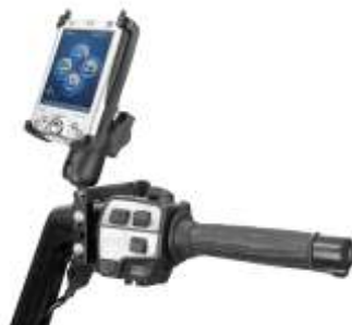
RAM-B-174-CO3 RAM BRAKE/CLUTCH RESERVOIR FOR THE HP IPAQ 2000 SERIES