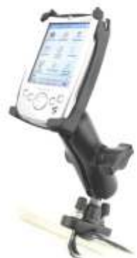
RAM-B-149Z-DE1 RAM U-BOLT MOUNT FOR THE DELL AXIM X5