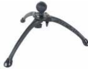
RAM-205U TRI-POD WITH BALL