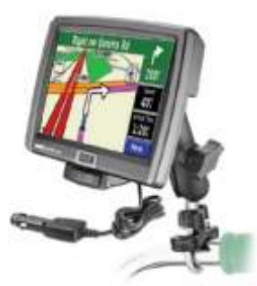
RAM-B-149Z-G3U RAM MOUNT WITH U-BOLT FOR THE GARMIN 7200