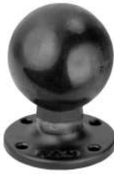
RAM-D-254BU RAM 2 7/16" DIAMETER BRASS BASE WITH BALL