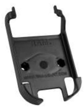
RAM-HOL-CO4 RAM HOLDER IPAQ FOR THE HP IPAQ 1900 & 4100 SERIES