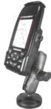
RAP-B-104-224-LO2 RAM MOUNT FOR THE LOWRANCE IFINDER