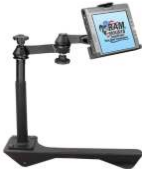
RAM-VB-130-MOT3 VEHICLE SYSTEM FOR THE 2004- NEWER DURANGO