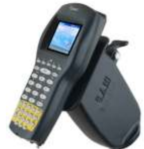
RAP-317U RAM UNIVERSAL SCANNER GUN HOLDER