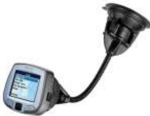
RAP-105-6224-GA22 RAM FLEX ARM MOUNT FOR THE GARMIN STREETPILOT I SERIES