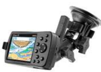
RAP-B-104-224-GA7 RAM RATCHET/PIVOT MOUNT FOR THE GARMIN 176, 276 & 296