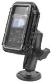
RAM-B-138-AQ3 RAM MOUNT WITH 2 7/16" BASE FOR AQUA BOX MEDIUM