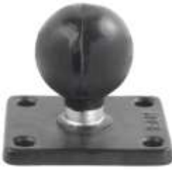
RAM-202U-22 RAM BASE 2" X 2" WITH 1 1/2" BALL