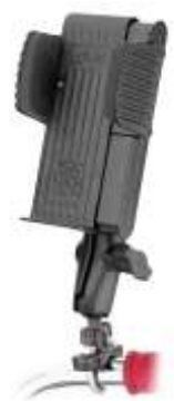
RAM-B-120-231 RAM HAND HELD MOUNT WITH U-BOLT RAIL CLAMP