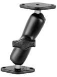
RAM-B-102 RAM EVERYTHING MOUNT WITH 1" BALLS