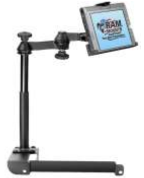
RAM-VB-148-SW1 VEHICLE SYSTEM FOR THE 2003- NEWER FORD FOCUS