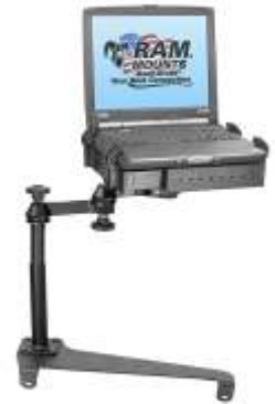
RAM-VB-133-SW1 VEHICLE SYSTEM FOR THE 2006- NEWER TOYOTA TUNDRA