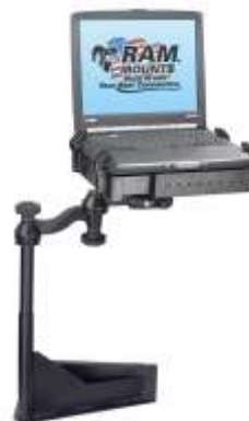
RAM-VB-140-SW1 VEHICLE SYSTEM NATIONAL SEATING