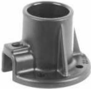
RAP-278 RAM 2.5 DIA BASE WITH FEMALE PIPE SCKT UNPK