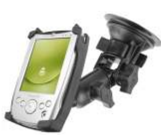
RAP-B-104-224-DE1 RAM RATCHET/PIVOT FOR THE DELL AXIM X5