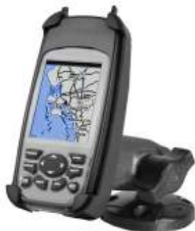
RAP-B-104-LO3UU RAM SINGLE BALL LOWRANCE H20 PROMO