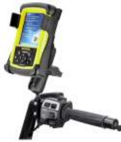
RAM-B-174-TD1 RAM BRAKE/CLUTCH RESERVOIR FOR THE TDS RECON