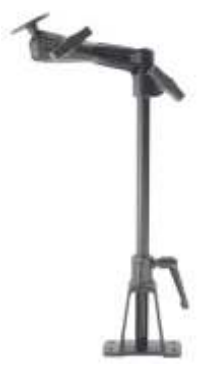
RAM-161-1U RAM BI-POD SYSTEM WITH SINGLE