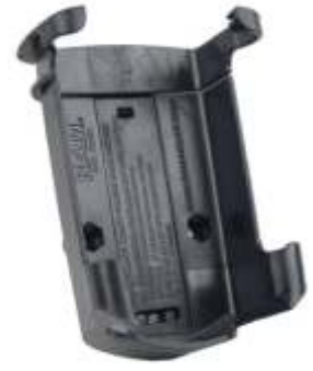
RAM-HOL-CO2 RAM IPAQ CRADLE FOR THE HP IPAQ 3000 & 5000 SERIES