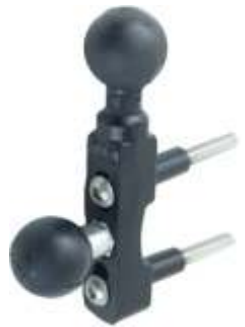
RAM-B-309-6U RAM MODULAR MOTO BASE WITH DOUBLE BALL