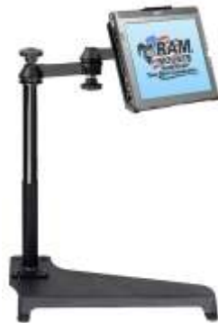
RAM-VB-150-SW1 VEHICLE SYSTEM FOR THE 2005- NEWER SCION XB