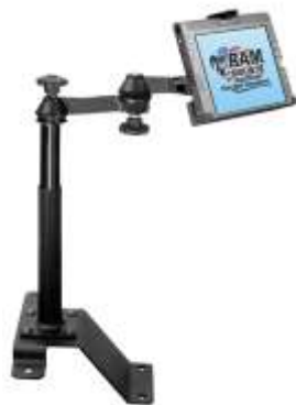
RAM-VBD-126-MOT3 RAM DRILL TYPE SPECIFIC TRANS HUMP SYSTEM