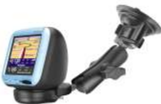
RAM-B-166-TO1 RAM SUCTION MOUNT FOR THE TOMTOM GO