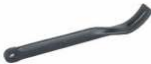
RAM-267U-L2 RAM 12" TRI & BI-POD LEG