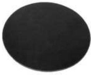
RAM-202PSA 2 7/16" DIAMETER DOUBLE ADHESIVE MOUNTING PAD