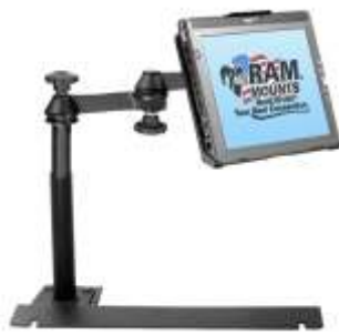
RAM-VB-129-MOT4 VEHICLE SYSTEM FOR THE 2005- NEWER MAGNUM & CHARGER