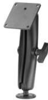
RAM-101U-D-2461 RAM MOUNT WITH VESA PLATE 75 MM D LENGTH