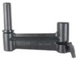
RAM-D-261-1U RAM EXTENSION SWING ARM FOR 1" PIPE