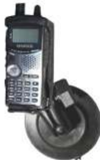
RAM-B-148-KE1 RAM SUCTION MOUNT FOR THE KENWOOD TH-D7A RAD