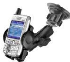
RAM-B-166-UN1 RAM UNIVERSAL SUCTION MOUNT FOR SMALL SIZE DEVICES