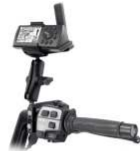
RAM-B-174-GA2 RAM BRAKE/CLUTCH RESERVOIR FOR THE GARMIN 2, 3 & 5