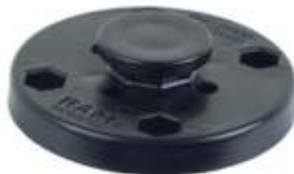
RAP-293U RAM 2 1/2" DIAMETER BASE WITHOUT OCTAGON BUTTON