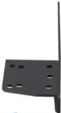
RAM-VB-105 VEHICLE BASE FOR THE 1997-NEWER DAKOTA & DURANGO