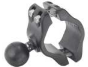
RAM-271U-2 RAM 2"- 2 1/2" DIAMETER RAIL BASE WITH BALL