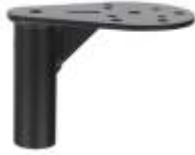
RAM-VP-TTMF4U RAM TELE-POLE BASE MALE WITH FLANGE 4" LONG