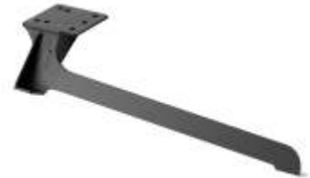
RAM-VB-154 VEHICLE BASE FOR THE 2004- NEWER NISSAN PATHINDER & XTERRA