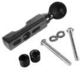
RAM-B-309-1 RAM MOTORCYCLE HANDLEBAR BASE WITH 1 BALL