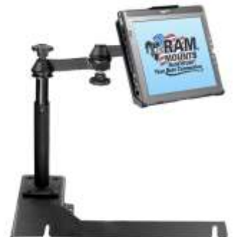
RAM-VB-111-MOT4 VEHICLE SYSTEM FOR THE 2000-NEWER IMPALA