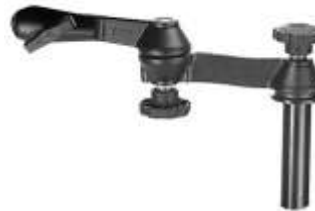
RAM-VP-TTM8-1U RAM TELE-POLE BASE MALE POST & ARM