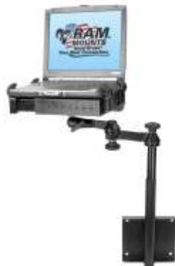
RAM-VBD-128-SW1 RAM UNIVERSAL DRILL TYPE FLAT VERTICAL BASE