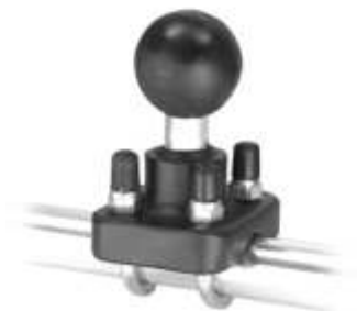
RAM-235 RAM BASE WITH 2 U-BOLTS FOR 3/4 TO 1 1/4