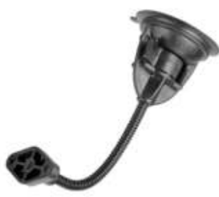
RAP-105-6D224 RAM 6" FLEX ARM WITH SUCTION CUP