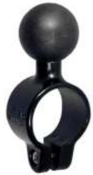
RAP-B-231 RAM BASE FOR 3/4" TO 1" DIAMETER RAILS