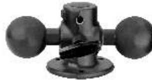
RAM-217 RAM DOUBLE BALL WITH 2 1/2" DIAMETER BASE & KNOB