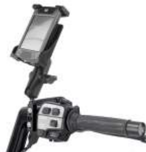
RAM-B-174-PD1 RAM BRAKE/CLUTCH RESERVOIR WITH UNIVERSAL PDA CRADLE