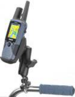
RAM-B-149Z-GA20U RAM U-BOLT FOR THE GARMIN RINO 530 & 520