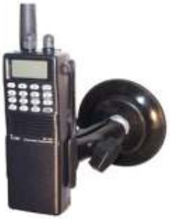
RAM-B-148-BC1 RAM WITH SUCTION, BELT CLIP HOLDER HAND-HELD