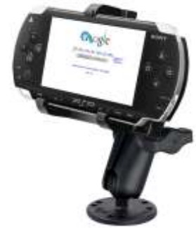
RAM-B-138-PD2 RAM MOUNT THREE FINDER PDA AND PORTABLE HOLDER