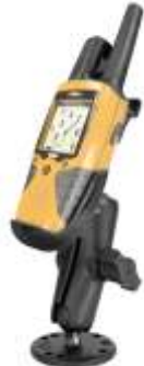
RAM-B-138-GA8 RAM MOUNT FOR GARMIN RINO SERIES