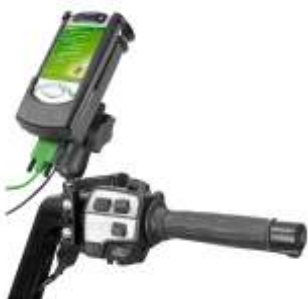
RAM-B-174-CO2P RAM BRAKE/CLUTCH RESERVOIR POWERED DOCK FOR HP IPAQ 3000 & 5000 SERIES