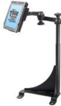
RAM-VB-143-MOT2 VEHICLE SYSTEM FOR THE 200 NEWER- EXPRESS SAVANA VAN