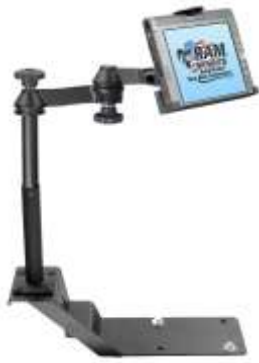
RAM-VBD-101-MOT3 DRILL TYPE SYSTEM DOUBLE SWING