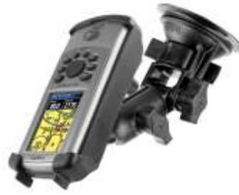
RAP-B-104-224-GA14 RAM RATCHET/PIVOT MOUNT FOR THE GARMIN 76C