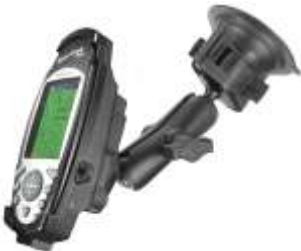
RAM-B-166-MA3 RAM SUCTION MOUNT FOR THE MAGELLAN SPORTRAK