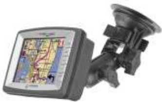
RAP-B-104-224-LO4 RAM RATCHET/PIVOT FOR THE LOWRANCE IWAY 500C