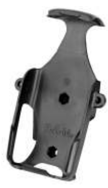
RAM-HOL-LO2 RAM HOLDER FOR THE LOWRANCE IFINDER SERIES