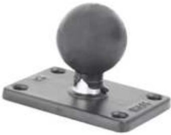
RAM-202U-25 RAM BASE 2" X 5" WITH 1 1/2" BALL