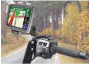
RAM-B-174-G3U RAM BRAKE/CLUTCH RESERVOIR FOR THE GARMIN 7200