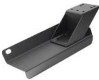
RAM-VB-116 VEHICLE BASE FOR THE 2004-NEWER COLORADO