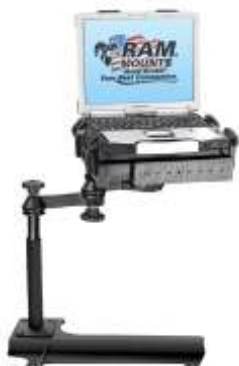
RAM-VB-158-SW1 VEHICLE SYSTEM FOR THE 2005- NEWER JEEP WRANGLER