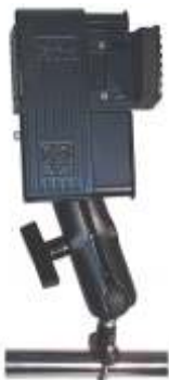
RAM-120-231 RAM HAND HELD MOUNT WITH U-BOLT RAIL CLAMP