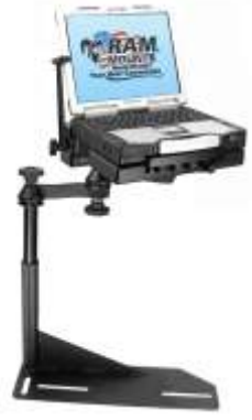
RAM-VB-117-PAN1 VEHICLE SYSTEM TOUGH DOCK