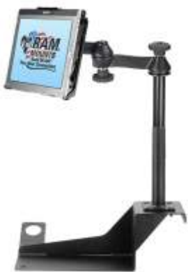
RAM-VB-108-MOT4 VEHICLE SYSTEM FOR THE 2000- NEWER EXCURSION & 1999-NEWER