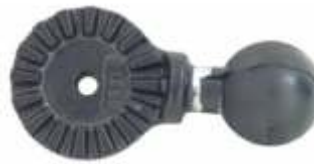
RAM-D-162B-DU RAM RATCHET BASE WITH 2 1/4" BALL