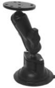
RAM-B-101-2241U RAM MOUNT WITH TWIST LOCK CUP