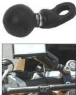
RAM-B-272U RAM BASE WITH 9 MM HOLE AND 1" BALL