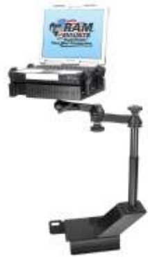
RAM-VB-113-SW1 VEHICLE SYSTEM FOR THE 1994-NEWER RANGER