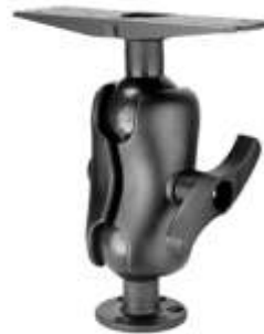
RAM-E-111U-D RAM MOUNT WITH 3" X 11" BASE & SHORT ARMS