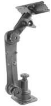
RAM-D-162H-MC1 RAM MC MASTER CARR SWING ARM HORIZONTAL SYSTEM