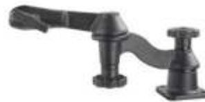
RAM-109H-G1U RAM DOUBLE SWING ARM WITH SINGLE SOCKET