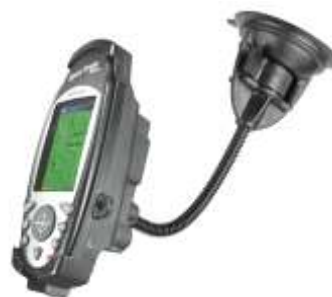
RAP-105-6224-MA3 RAM FLEX ARM MOUNT FOR THE MAGELLAN SPORTRAK