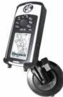
RAM-B-148-GA6 RAM SUCTION MOUNT FOR THE GARMIN GPS 76 SERIES