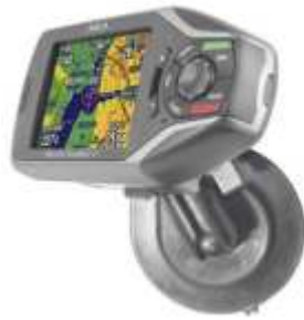
RAM-B-148-MA4 RAM SUCTION MOUNT FOR THE MAGELLAN ROADMATE