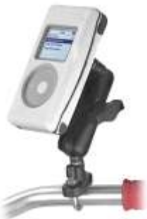
RAM-B-149Z-OT1 RAM U-BOLT MOUNT FOR THE OTTERBOX