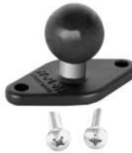
RAM-B-202-MA4 RAM BASE FOR THE MAGELLAN ROADMATE