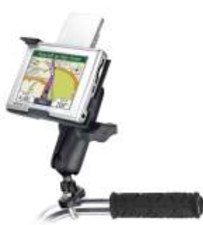
RAM-B-149Z-GA21 RAM U-BOLT FOR THE GARMIN NUVI