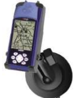
RAM-B-148-GA4 RAM SUCTION MOUNT FOR THE GARMIN E-MAP