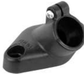
RAP-SB-275-45 RAM DIAMOND BASE WITH 45 DEGREE FEMALE SNAP LINK