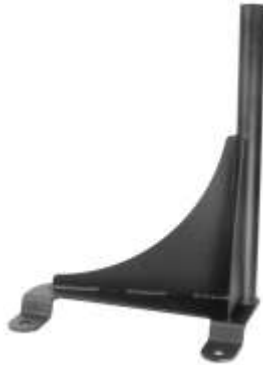
RAM-VB-143 VEHICLE BASE FOR THE 200 NEWER- EXPRESS SAVANA VAN