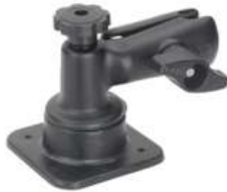
RAM-D-162H-MC3 RAM HORIZONTAL SWING ARM SYSTEM WITHOUT BALL BASE