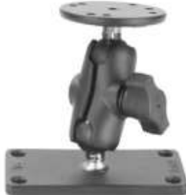
RAM-B-101-A-24U RAM MOUNT WITH 1 2" X 4" BASE & 1 SHORT ARM