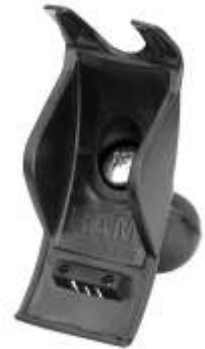
RAM-HOL-GA19 RAM HOLDER GARMIN FOR THE C320 & C330