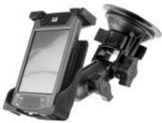
RAP-B-104-224-PD1 RAM RATCHET/PIVOT MOUNT WITH UNIVERSAL PDA CRADLE