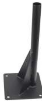
RAM-VBD-122 VEHICLE DRILL BASE UNIVERSAL SQUARE