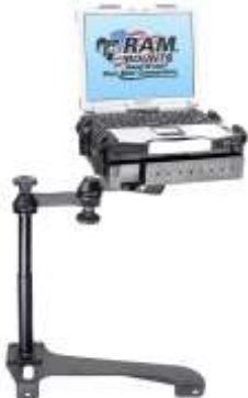
RAM-VB-135-SW1 VEHICLE SYSTEM FOR THE 2006- NEWER HONDA CRV