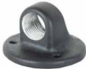
RAM-232-0 RAM 2.5 DIAMETER BASE WITH 1/2" NPT HOLE 0 DEGREE