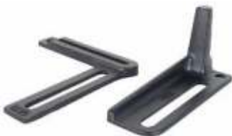
RAM-160BBU RAM SEAT RAIL BRACKETS ONLY