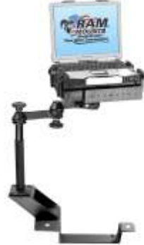
RAM-VB-102-SW1 VEHICLE SYSTEM FOR THE 2000-NEWER 2500 & 3500 SUBURBAN