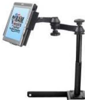
RAM-VB-105-MOT2 VEHICLE SYSTEM FOR THE 1997-NEWER DAKOTA & DURANGO