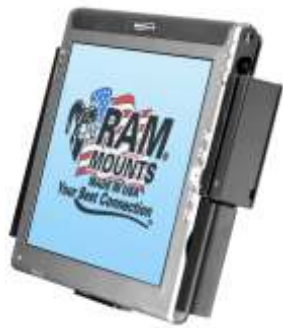
RAM-HOL-MOT2U RAM HOLDER FOR THE MOTION COMPUTING LE1600