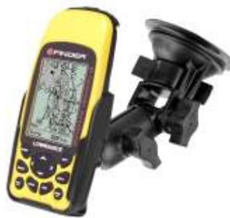
RAP-B-104-224-LO2 RAM RATCHET/PIVOT MOUNT FOR THE LOWRANCE IFINDER