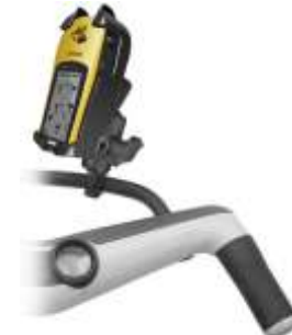
RAM-B-175-A-GA5U RAM ETREX B/W WITH SEGWAY SHORT ARM