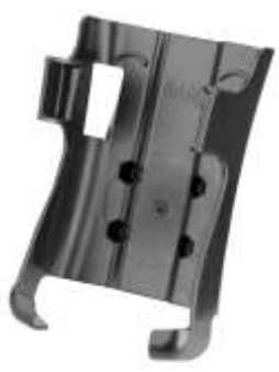
RAM-HOL-TD1U RAM HOLDER FOR THE TDS RECON