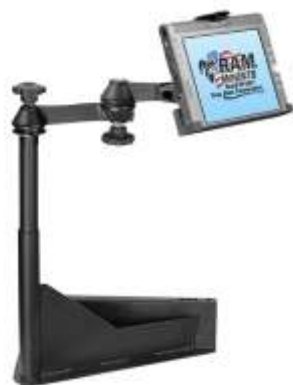
RAM-VB-140-MOT3 VEHICLE SYSTEM NATIONAL SEATING