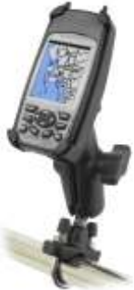
RAM-B-149Z-LO3 RAM U-BOLT MOUNT FOR THE LOWRANCE IFINDER H2O & MAP