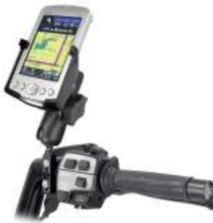
RAM-B-174-GA10 RAM BRAKE/CLUTCH RESERVOIR FOR THE GARMIN IQE