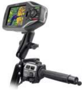
RAM-B-174-MA4 RAM BRAKE/CLUTCH RESERVOIR FOR THE MAGELLAN ROADMATE