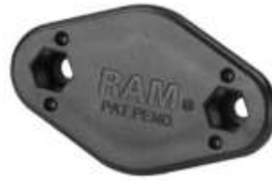
RAP-326MU RAM EZY-MOUNT QUICK RELEASE MALE