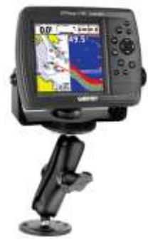
RAM-101-G2 RAM MOUNT GARMIN 250C FISH FINDER