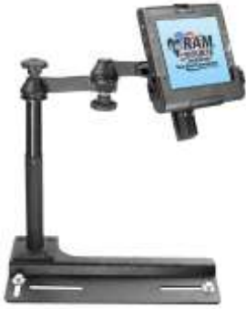
RAM-VB-106-MOT1 VEHICLE SYSTEM FOR THE 1993- NEWER CAMARO & 1991-NEWER CROWN VIC