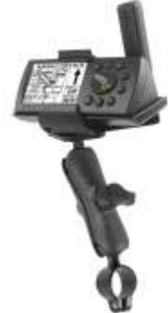
RAP-B-149-GA2 RAM RAIL MOUNT FOR THE GARMIN GPS II & III