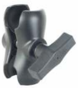
RAM-201-B RAM DOUBLE SOCKET ARM C BALL B LENGTH