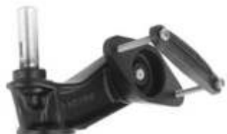
RAM-247U-4P1 FORK LIFT BASE WITH 1/2" POST, 4" CLAMP