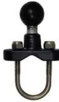
RAM-B-231U-250 250 BULK BASES WITH U-BOLT 3/4" TO 1" DIAMETER