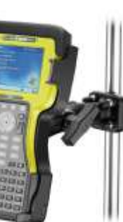
RAM-103-B-235-TD2 RAM DOUBLE RAIL MOUNT FOR THE TDS RANGER