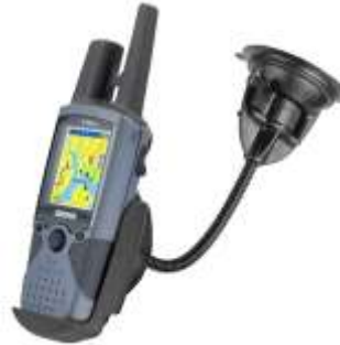
RAP-105-6224-GA20 RAM FLEX ARM MOUNT FOR THE GARMIN RINO 520 & 530