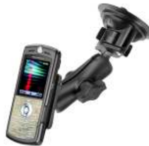
RAM-B-166-300 RAM SUCTION MOUNT WITH POWER PLATE