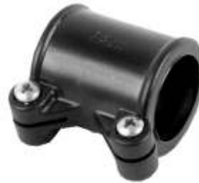
RAP-SB-275-FF RAM SNAP LINK FEMALE-FEMALE