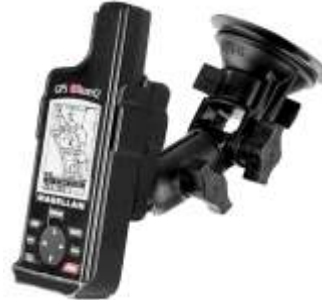
RAP-B-104-224-MA1 RAM RATCHET/PIVOT MOUNT FOR THE MAGELLAN 12, 300 & 315