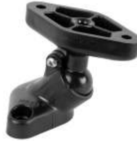
RAP-SB-192 RAM SNAP LINK MOUNT WITH DOUBLE DIAMOND BASE