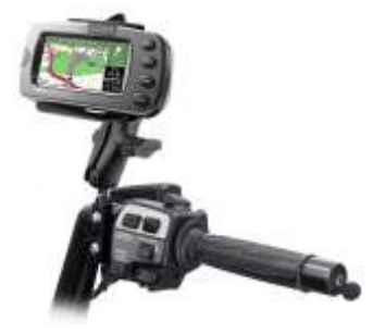
RAM-B-174-GA9 RAM BRAKE/CLUTCH RESERVOIR FOR THE GARMIN 2610