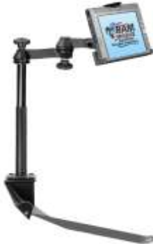
RAM-VB-144-MOT3 VEHICLE SYSTEM FOR THE 2006- NEWER KIA SORENTO