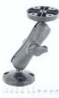
RAP-B-101-G1 RAM MOUNT WITH MOUNTING HARDWARE