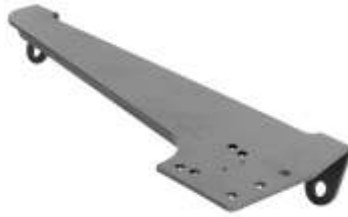
RAM-VB-133 VEHICLE BASE FOR THE 2006- NEWER TOYOTA TUNDRA