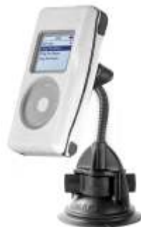
RAP-105-6224-OT1 RAM FLEX ARM MOUNT FOR THE OTTERBOX