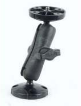
RAP-B-101A RAM 1" MOUNT WITH 2 BASES ONE WITH 1/4-20 STUD