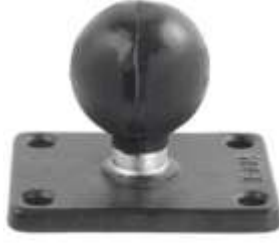
RAM-202U-225 RAM BASE 2" X 2.5" WITH 1 1/2" BALL