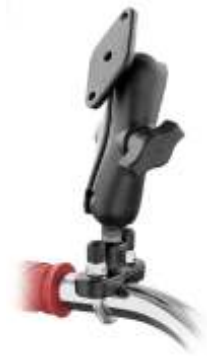
RAM-B-102-231Z RAM MOUNT WITH B-102 & XTRA B-231Z