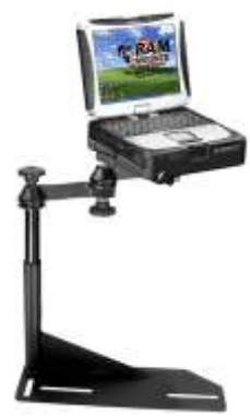
RAM-VB-117-PAN2 VEHICLE SYSTEM TOUGH DOCK CF-18