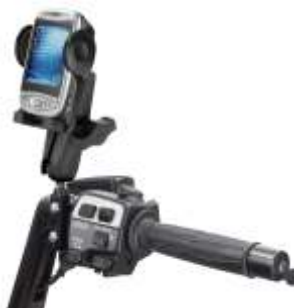
RAM-B-174-UN2 RAM BRAKE/CLUTCH RESERVOIR FOR MEDIUM SIZE DEVICES