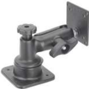
RAM-D-162H-MC2 RAM MC MASTER CARR SWING ARM HORIZONTAL BASE