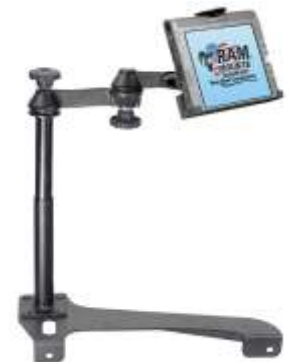
RAM-VB-135-MOT3 VEHICLE SYSTEM FOR THE 2006- NEWER HONDA CRV