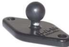
RAM-A-238 RAM 2 7/16" X 1 5/16" BASE WITH BALL