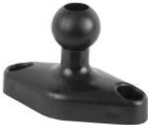
RAP-SB-238 RAM DIAMOND BASE WITH MALE SNAP LINK