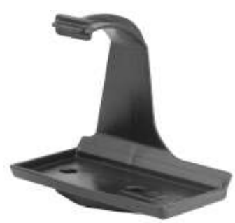
RAM-HOL-LO7 RAM HOLDER FOR THE LOWRANCE IWAY 350C