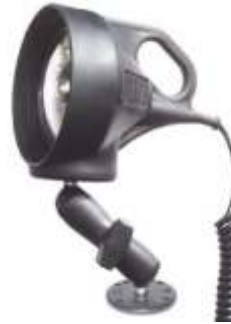
RAM-B-152 RAM SPOTLIGHT WITH MOUNT & STUD BASE