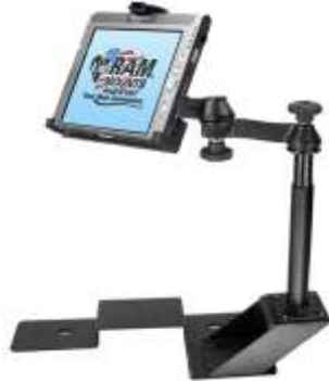
RAM-VB-109-MOT3 VEHICLE SYSTEM FOR THE 2004-NEWER F150