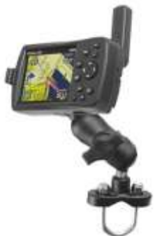
RAM-B149ZA-GA7U RAM U-BOLT MOUNT FOR THE GARMIN 176, 276, 296R