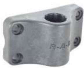
RAM-114BM RAM ROD 2000 BULKHEAD MOUNTING BASE