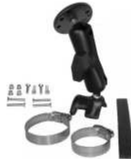
RAM-B-108-G1 RAM WITH V BASE & MOUNTING HARDWARE