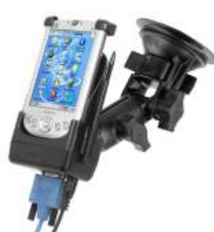
RAP-B-104-224-CO4P RAM RATCHET/PIVOT MOUNT POWERED DOCK FOR IPAQ 1900 & 4100 SERIES