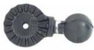
RAM-162BU RAM RATCHET BASE WITH 1.5" BALL