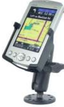
RAM-B-138-GA10 RAM MOUNT FOR GARMIN IQE