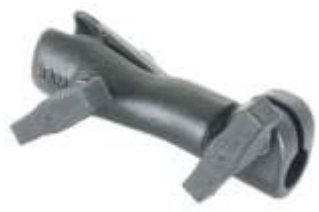
RAM-200-CHU RAM SINGLE SOCKET ARM WITH 1/2" FEMALE HOLE