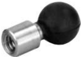
RAM-A-336U 1/4" POST WITH 1/4"-20 THREADED HOLE STST