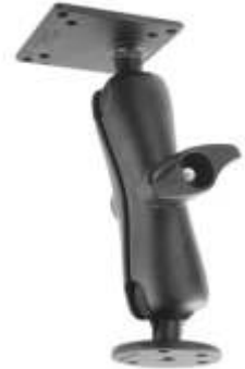
RAM-D-101U-246 RAM MOUNT WITH VESA PLATE