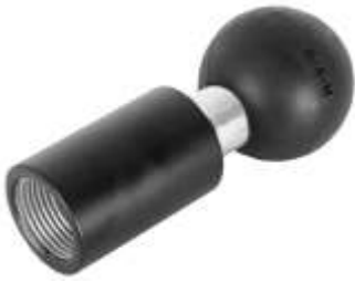
RAM-D-218-1 RAM SINGLE BALL WITH 1" NPT HOLE