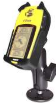
RAM-B-138-GA5 RAM MOUNT FOR GARMIN E-TREX