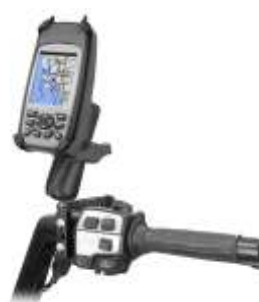
RAM-B-174-LO3 RAM BRAKE/CLUTCH RESERVOIR FOR THE LOWRANCE IFINDER H2O & MAP