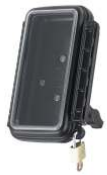
RAM-HOL-AQ2 RAM MEDIUM SIZE AQUA BOX