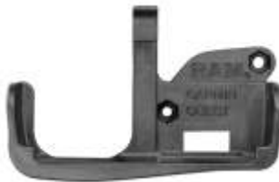
RAM-HOL-GA15U RAM HOLDER GARMIN FOR THE QUEST