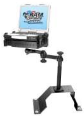
RAM-VB-107-SW1 VEHICLE SYSTEM FOR THE 1990-95 CAPRICE & 1991 CROWN VIC