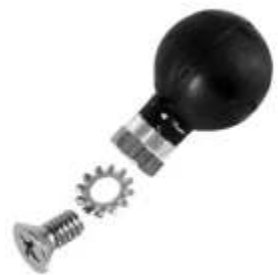
RAM-B-309-3U RAM CYCLE HANDLEBAR BALL