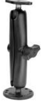
RAM-B-101U-C RAM MOUNT. WITH 2 1/2" BASES & C ARM