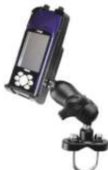
RAM-B-149ZA-GA4 RAM U-BOLT MOUNT WITH AARM FOR THE GARMIN E-MAP