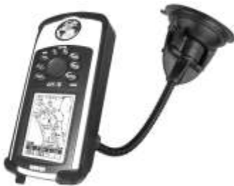
RAP-105-6224-GA6 RAM FLEX ARM MOUNT FOR THE GARMIN 76 76CSX