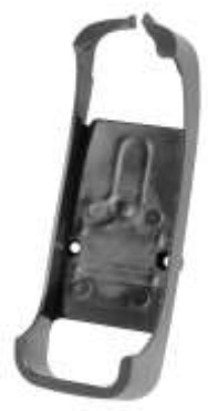
RAM-HOL-LO1 RAM HOLDER FOR THE LOWRANCE GLOBALMAP