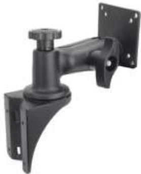
RAM-D-162V-MC2 RAM MC MASTER CARR SWING ARM VERTICAL BASE