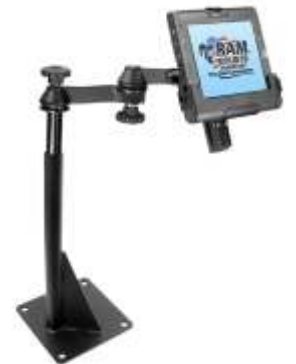
RAM-VBD-122-MOT1 VEHICLE SYSTEM UNIVERSAL SQUARE BASE