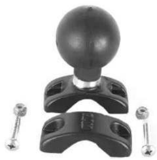
RAM-D-271U-12 RAM 1 1/4"-1 7/8" DIAMETER RAIL BASE WITH BALL