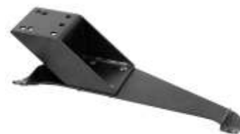
RAM-VB-138 VEHICLE BASE FOR THE 2006-NEWER TOYOTA 4-RUNNER