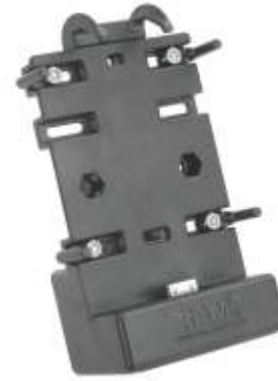
RAM-HOL-CO5P RAM POWERED UNIVERSAL IPAQ DOCK