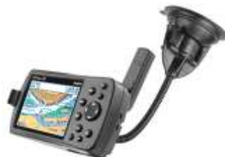
RAP-105-6224-GA7 RAM FLEX ARM MOUNT FOR THE GARMIN 176, 276 & 296