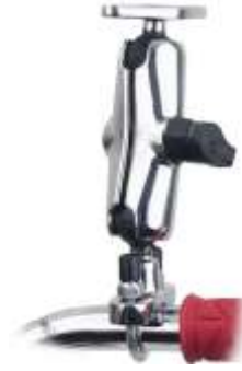
RAM-B-149CHU RAM U-BOLT MOUNT WITH CHROME