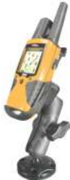
RAP-B-138-GA8 RAM MOUNT FOR THE GARMIN RINO SERIES