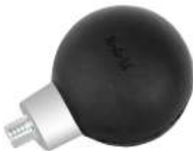
RAM-236 RAM SPOTLIGHT BASE WITH 3/8-16 THIRD POST