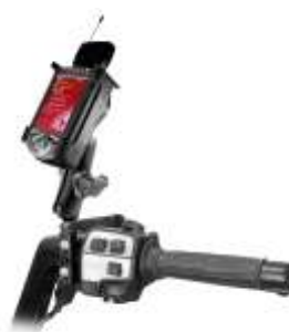
RAM-B-174-CO1 RAM BRAKE/CLUTCH RESERVOIR FOR THE HP IPAQ 3600 & 5000 SERIES