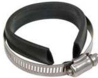
RAM-STRAP40 RAM SS WORM DRIVE STRAP CLAMP-BONANZA