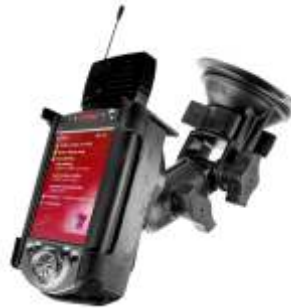
RAP-B-104-224-CO1 RAM RATCHET/PIVOT MOUNT FOR HP IPAQ 3600 & 5100 SERIES