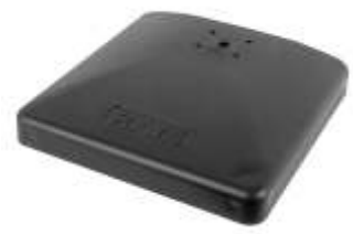
RAP-251U RAM 9" X 9" PLASTIC BASE