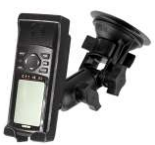
RAP-B-104-224-GA1 RAM RATCHET/PIVOT MOUNT FOR THE GARMIN GPS 12 SERIES