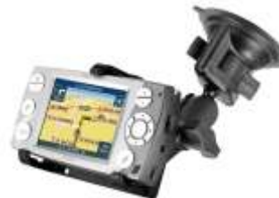
RAM-B-166-PD2 RAM SUCTION MOUNT THREE FINDER PDA HOLDER