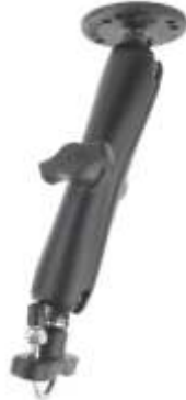
RAM-B-101-C-231ZU RAM MOUNT WITH B-202 AND B-231Z BASE