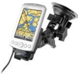
RAP-B-104-224-GA11 RAM RATCHET/PIVOT MOUNT WITH GARMIN ADAPTER