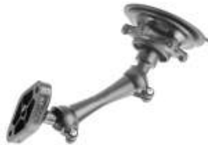
RAP-AA-167 RAM SNAP LINK SUCTION SYSTEM