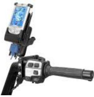
RAM-B-174-CO4P RAM BRAKE/CLUTCH RESERVOIR POWERED DOCK FOR THE HP IPAQ 1900 & 4100 SERIES