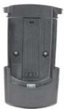
RAM-HOL-CO2P RAM POWERED DOCK FOR THE HP IPAQ 3000 & 5000 SERIES