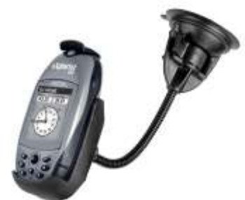
RAP-105-6224-MA5 RAM FLEX ARM MOUNT FOR THE MAGELLAN EXPLORIST SERIES