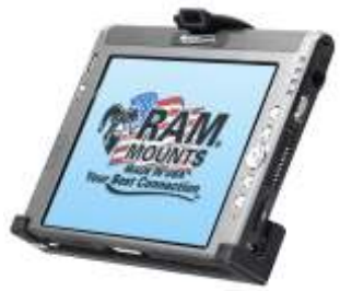
RAM-HOL-MOT3U RAM PLASTIC HOLDER FOR THE MOTION COMPUTING LS800