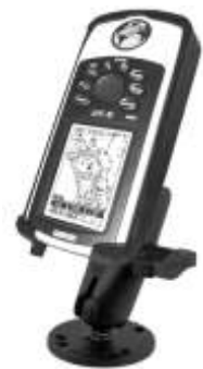
RAM-B-138-GA6 RAM MOUNT FOR GARMIN GPS 76 SERIES