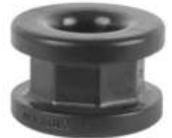
RAP-280U RAM DOUBLE THICK OCTAGON BUTTON