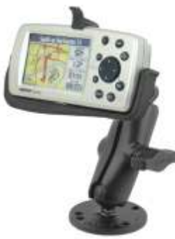
RAM-B-138-GA15 RAM MOUNT FOR GARMIN QUEST SERIES