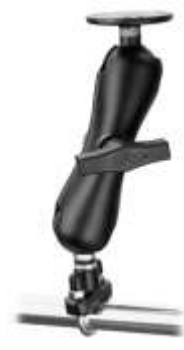
RAM-101U-AC1 RAM MOUNT WITH 1 RAM-202 & 1 RAM-231