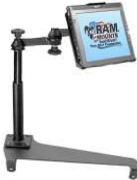
RAM-VB-153-MOT4 VEHICLE SYSTEM FOR THE 2005- NEWER TOYOTA SIENNA