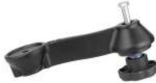
RAM-VB-109-3U RAM EXTENSION SWING ARM FOR TELE-POLE