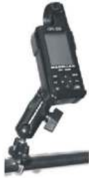
RAP-B-149-MA1 RAM U-BOLT MOUNT FOR THE MAGELLAN 12, 300 & 315