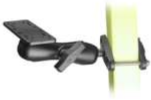
RAM-111-247U-2 RAM MOUNT 111B, 2" SQUARE TUBE BASE