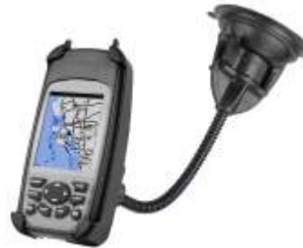
RAP-105-6224-LO3 RAM FLEX ARM MOUNT FOR THE LOWRANCE IFINDER H2O & MAP