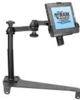
RAM-VB-133-MOT1 VEHICLE SYSTEM FOR THE 2006- NEWER TOYOTA TUNDRA