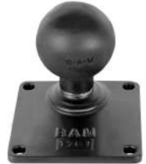
RAM-D-2461U RAM 3 5/8" SQ. 75 MIL. VESA BASE WITH BALL