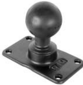
RAM-D-243U 2 13/16" X 5" PLATE WITH BALL