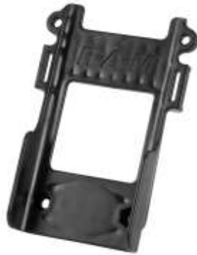
RAM-HOL-BC1 RAM HOLDER FOR ELECTRONICS WITH BELT CLIPS