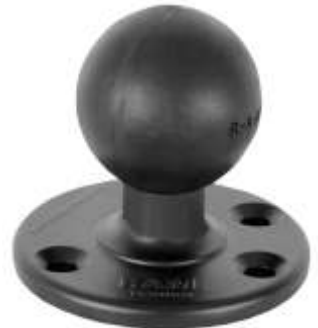
RAM-D-202U RAM 3.68" DIAMETER BASE