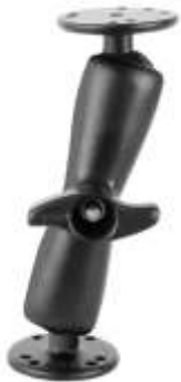
RAM-101MU RAM MOUNT WITH METAL KNOB