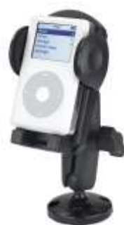
RAP-B-138-UN2U RAM MOUNT WITH UNIVERSAL HOLDER