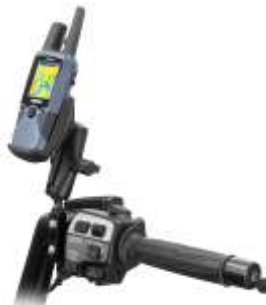
RAM-B-174-GA20 RAM BRAKE/CLUTCH RESERVOIR FOR THE GARMIN RINO 520 & 530