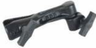
RAM-261U RAM SWING ARM WITH SINGLE SOCKET PEDESTAL