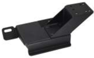
RAM-VB-113 VEHICLE BASE FOR THE 1994-NEWER