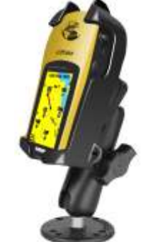
RAM-B-138-GA16 RAM MOUNT FOR GARMIN COLOR ETREX