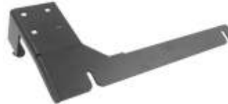
RAM-VB-111 VEHICLE BASE FOR THE 2000-NEWER IMPALA