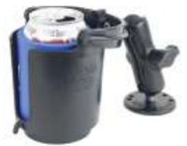
RAM-B-132U RAM DRINK CUP HOLDER MOUNT