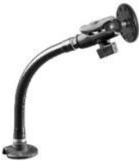
RAM-B-123-9012BU RAM 12" FLEX ARM 90 DEG. BASE SING ARM