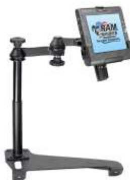
RAM-VB-139-MOT1 VEHICLE SYSTEM FOR THE 2004- NEWER HONDA ACCORD