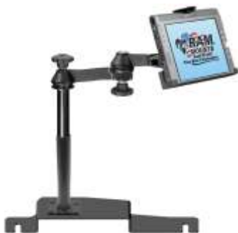
RAM-VB-161-MOT3 VEHICLE SYSTEM FOR THE 2006- NEWER FORD 500 & FREESTYLE