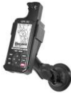
RAM-B-166-MA1 RAM SUCTION MOUNT FOR THE MAGELLAN 12,300 & 315