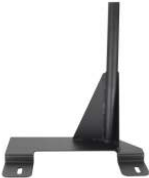
RAM-VB-119 VEHICLE BASE FOR THE 1995-NEWER ECONOLINE VAN