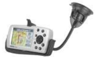
RAP-105-6224-GA15 RAM FLEX ARM MOUNT FOR THE GARMIN QUEST