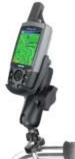
RAM-B-149Z-GA12 RAM RAIL MOUNT FOR THE GARMIN 60 SERIES