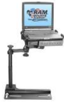
RAM-VB-106-SW1 VEHICLE SYSTEM FOR THE 1993- NEWER CAMARO & 1991-NEWER CROWN VIC