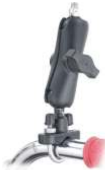
RAM-B-149Z-237U RAM RAIL MOUNT WITH 1/4"-20 MALE