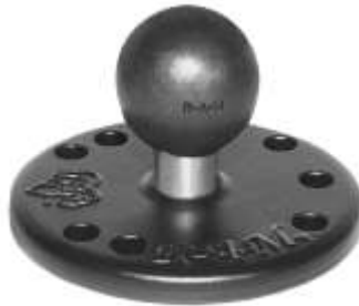
RAM-B-202 B Size Ball 1" Diameter