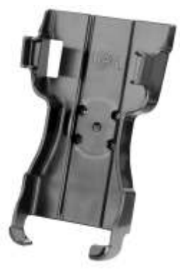
RAM-HOL-TD2U RAM HOLDER FOR THE TDS RANGER