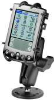
RAM-B-138-PD3 RAM STUD MOUNT FOR THE UNIVERSAL IPAQ FAMILY