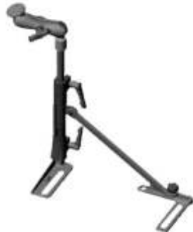
RAM-160-1U RAM SEAT RAIL SYSTEM WITH 1 SWING ARM & BALL