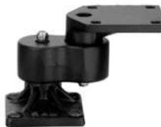
RAM-VB-ADJ1 RAM VEHICLE ADJUST-A-POLE BASE