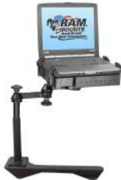
RAM-VB-130-SW1 VEHICLE SYSTEM FOR THE 2004- NEWER DURANGO