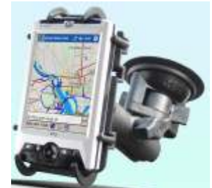
RAP-B-166-PD3U RAM SUCTION SYSTEM UNIVERSAL PDA SERIES