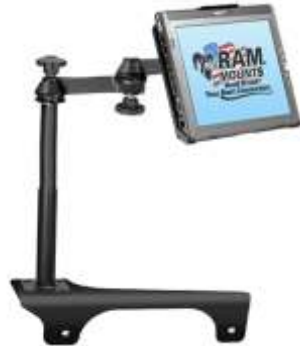
RAM-VB-165-MOT4 VEHICLE SYSTEM FOR THE 2006- NEWER HUMMER H3