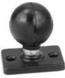
RAM-202U-12 RAM BASE 1" X 2" WITH 1 1/2" BALL