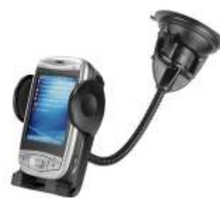
RAP-105-6224-UN2 RAM UNIVERSAL FLEX ARM MOUNT FOR MEDIUM SIZE DEVICES