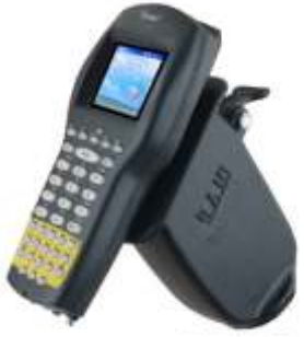
RAM-317U RAM UNIVERSAL SCANNER GUN HOLDER