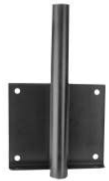
RAM-VBD-128 RAM UNIVERSAL DRILL TYPE FLAT VERTICAL BASE