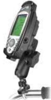
RAM-B-149Z-MA3 RAM U-BOLT MOUNT FOR THE MAGELLAN SPORTRAK