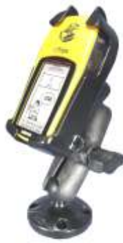
RAP-B-138-GA5 RAM MOUNT FOR THE GARMIN E-TREX SERIES