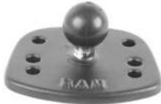
RAM-B-107-1B RAM BASE FOR CUDA PIRANHA