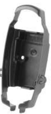
RAM-HOL-MA3 RAM HOLDER FOR THE MAGELLAN SPORTRAK