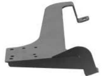
RAM-VB-151-MOT3 VEHICLE SYSTEM SEATS INC.