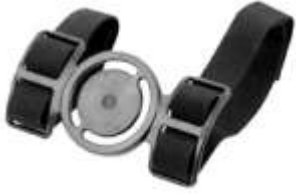
RAM-BM-A1 RAM BODY MOUNT FOR ARMS