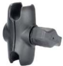
RAM-B-201-A RAM DOUBLE SOCKET ARM B BALL A LENGTH