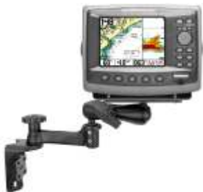
RAM-109V-2 RAM SWING ARM WITH RAM BALL SYSTEM AND VERTICAL BASE