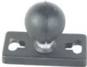
RAM-151BU RAM BOSCH BASE WITH 1 1/2" DIAMETER BALL