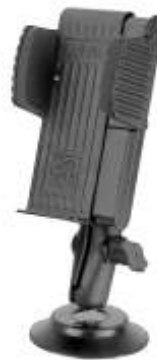
RAM-B-120-224 RAM HAND HELD MOUNT WITH SUCTION CUP BASE