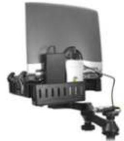
RAM-234-5U RAM POWER CADDY