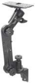
RAM-D-162V-MC1 RAM MC MASTER CARR SWING ARM VERTICAL SYSTEM