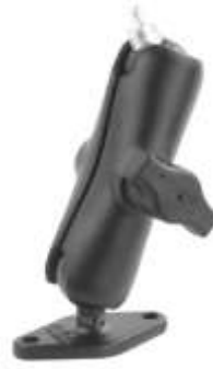
RAM-B-102-237U RAM MOUNT WITH B-238, B-201 & B-237