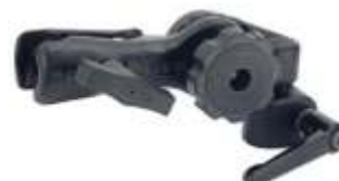
RAM-261-ADJU RAM SWING ARM WITH SINGLE SOCKET RATCHET