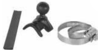
RAM-B-108B RAM V BASE BALL & STRAPS FOR 1/2"-2" DIA