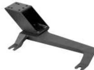
RAM-VB-131R4 VEHICLE BASE FOR THE 2000-NEWER 2500 & 3500 SU POWER