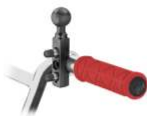
RAM-B-309-7U CLUTCH, BRAKE, UBOLT COMBO HANDLEBAR KIT