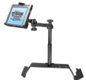
RAM-VB-103-MOT3 VEHICLE SYSTEM FOR THE 1500, 2500, 3500 SILVERADO