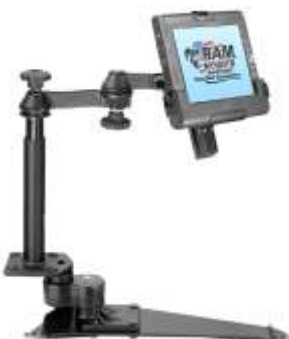
RAM-VB-138ST1-MOT1 VEHICLE SYSTEM FOR THE 2006- NEWER TOYOTA FJ CRUISER