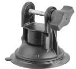
RAP-B-104-224-PH1 RAM TWIST LOCK SUCTION BASE NO BUTTON