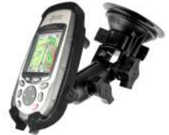
RAP-B-104-224-MA2 RAM RATCHET/PIVOT MOUNT FOR THE MAGELLAN MERIDIAN