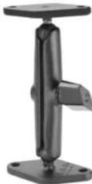
RAM-A-101U-B RAM SYSTEM WITH 9/16" BALLS LONG ARM