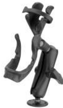
RAM-101-AT1U RAM MOUNT SYSTEM WITH 117B, 201-B & 215