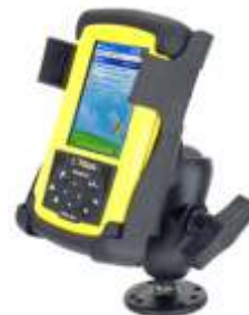
RAM-101U-B-TD1 RAM MOUNT WITH 2 2 1/2" BASES FOR THE TDS RECON