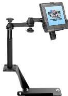
RAM-VB-112-MOT1 VEHICLE SYSTEM FOR THE 2002-NEWER EXPLORER