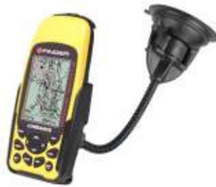
RAP-105-6224-LO2 RAM FLEX ARM MOUNT FOR THE LOWRANCE IFINDER