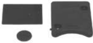
RAP-300 RAM POWER PLATE II