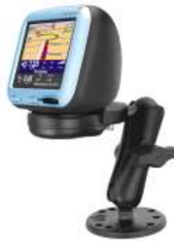
RAM-B-138-TO1 RAM MOUNT FOR THE TOMTOM GO SERIES