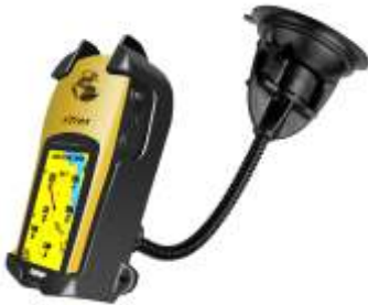
RAP-105-6224-GA16 RAM FLEX ARM MOUNT FOR THE GARMIN ETRIX COLOR