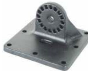
RAM-282U RAM 5" X 5" BASE WITH ADJUSTABLE FEATURE FEMALE TEETH