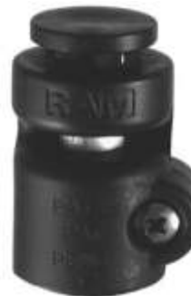
RAP-321U MALE OCTAGON BUTTON WITH 1/2" PIPE CLEVIS