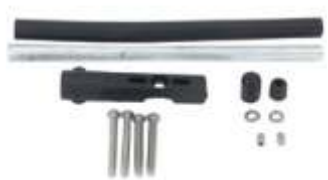
RAM-B-318-1U RAM CYCLE BASE WITH 9" FLEX ROD