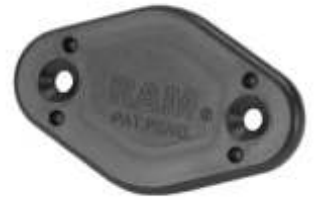
RAP-326RMU RAM EZY-MOUNT QUICK RECESSED MALE