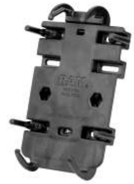
RAM-HOL-PD3U RAM UNIVERSAL PDA HOLDER