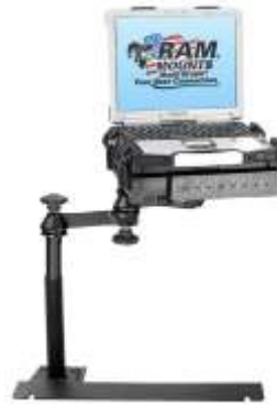
RAM-VB-129-SW1 VEHICLE SYSTEM FOR THE 2005- NEWER MAGNUM & CHARGER