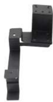
RAM-VB-102 VEHICLE BASE FOR THE 2000-NEWER 2500 & 3500 SUBURBAN