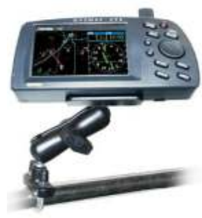
RAM-B-149Z-G1 RAM MOUNT WITH U-BOLT BASE & MOUNTING HARDWARE