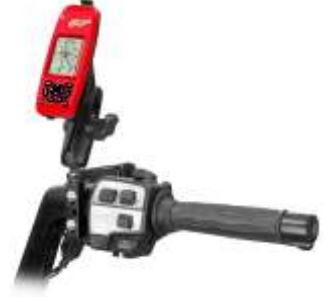
RAM-B-174-LO5 RAM BRAKE/CLUTCH RESERVOIR FOR THE LOWRANCE IFINDER GO