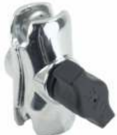
RAM-B-201-ACHU CHROME RAM DOUBLE SOCKET ARM B BALL A LENGTH