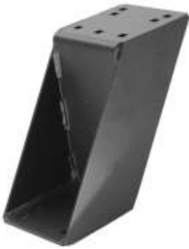
RAM-VB-SB7 RAM 7" VEHICLE BASE RISER