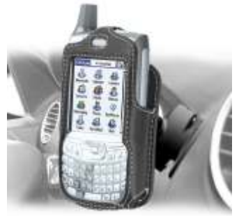
RAP-SB-178-304 FLEX BASE SYSTEM WITH BELT CLIP HOLDER