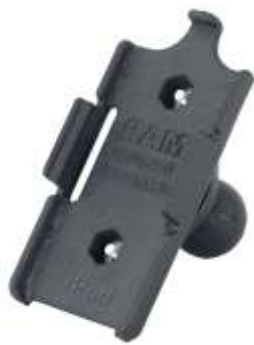
RAM-HOL-AP2U RAM HOLDER FOR THE I-POD NANO