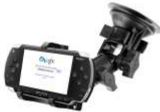
RAP-B-104-224-PD2 RAM RATCHET/PIVOT MOUNT THREE FINDER PDA HOLDER