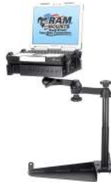
RAM-VB-134-SW1 VEHICLE SYSTEM FOR THE 2006- NEWER NISSAN TITAN