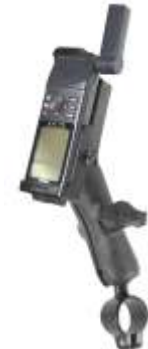
RAP-B-149-GA3 RAM RAIL MOUNT FOR THE GARMIN 48, 45, 89 & 90