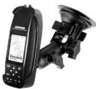
RAP-B-104-224-LO1 RAM RATCHET/PIVOT MOUNT FOR THE LOWRANCE GLOBALMAP