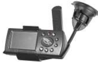
RAP-105-6224-GA2 RAM FLEX ARM MOUNT FOR THE GARMIN 2, 3 & 5