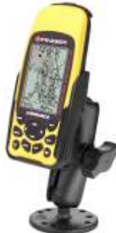
RAM-B-138-LO2 RAM MOUNT FOR THE LOWRANCE IFINDER ATLANTIS AND PRO