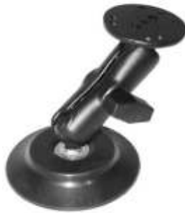
RAM-B-101-224 RAM 1" BALL MOUNT WITH 4" SUCTION CUP