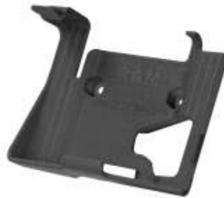
RAM-HOL-GA21U RAM HOLDER FOR THE GARMIN NUVI