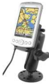
RAM-B-138-GA11 RAM MOUNT GARMIN ADAPTER