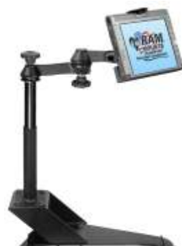
RAM-VB-138-MOT3 VEHICLE SYSTEM FOR THE 2006- NEWER TOYOTA 4-RUNNER