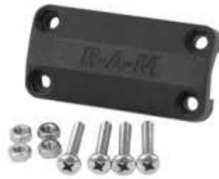
RAM-114RM RAM ROD 2000 RAIL MOUNT ADAPTER KIT