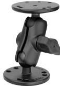
RAM-B-101A2U RAM MOUNT WITH 2-B-202A BASES