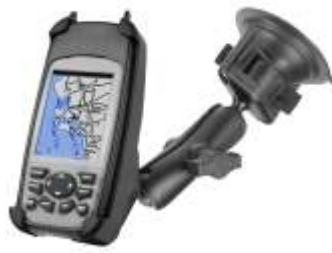
RAM-B-166-LO3 RAM SUCTION MOUNT FOR THE LOWRANCE IFINDER H2O & MAP