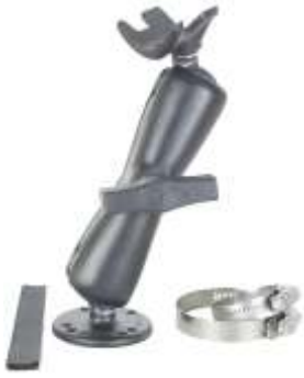
RAM-108 RAM TROLLING MOTOR STABILIZER