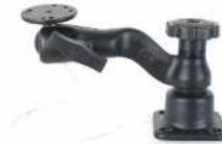
RAM-109H-3BU RAM BENT SWING ARM WITH HORIZONTAL BASE & BALL