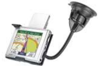
RAP-105-6224-GA21 RAM FLEX ARM MOUNT FOR THE GARMIN NUVI