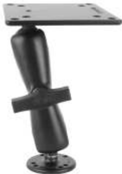
RAM-101U-246 RAM MOUNT WITH VESA PLATE 75 AND 100 MM