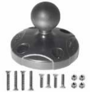
RAP-B-202-G1 RAM BASE & BALL WITH MOUNTING HARDWARE