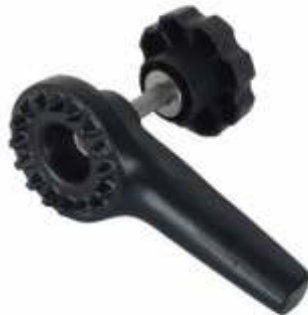
RAM-281U RAM POST WITH MALE TEETH FOR ADJ BASE