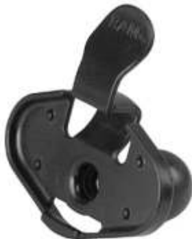
RAP-B-326FU EZY-MOUNT QUICK RELEASE FEMALE WITH BALL