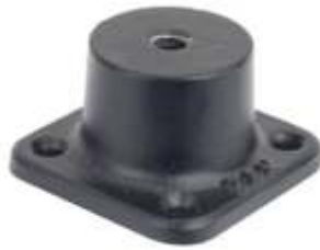
RAM-109H-B RAM SINGLE ARM BALL MOUNT WITH HORIZONTAL BASE