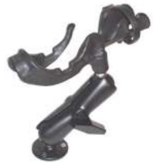
RAM-117 RAM-ROD FISHING ROD HOLDER SYSTEM