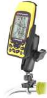
RAM-B-149Z-LO2 RAM U-BOLT MOUNT FOR THE LOWRANCE IFINDER