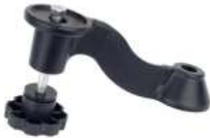
RAM-109-1APU RAM SINGLE SWING ARM FOR PEDESTAL SYSTEMS