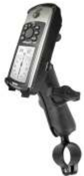
RAP-B-149-GA6 RAM RAIL MOUNT FOR THE GARMIN GPS 76 SERIES