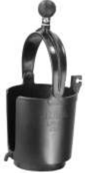
RAM-B-132B-WH1U RAM DRINK CUP HOLDER WITH NO SLEEVE