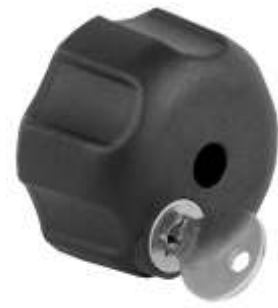
RAM-KNOB3L KNOB WITH KEYED LOCK & 1/4"-20 BRASS HOLE