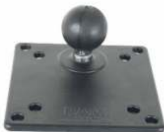
RAM-246U RAM 4.75 SQUARE VESA BASE 100 & 75 HOLE