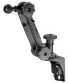
RAM-162V-MC4 RAM RATCHET SWING ARM WITH 1 1/2" BALL