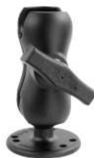
RAM-103-BU RAM SHORT ARM WITH 202