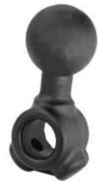
RAM-B-309-5U RAM 1/2" ID RAIL BASE WITH 1" BALL