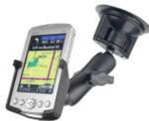
RAM-B-166-GA10 RAM SUCTION MOUNT FOR THE GARMIN IQUE