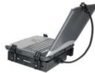
RAM-234-SU RAM SCREEN SUPPORT SYSTEM