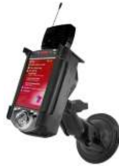
RAM-B-166-CO1 RAM SUCTION MOUNT FOR THE HP IPAQ