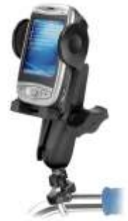
RAM-B-149Z-UN2 RAM UNIVERSAL RAIL MOUNT FOR MEDIUM SIZE DEVICES