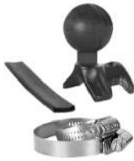
RAM-108B RAM BASE WITH BALL & STRAPS 1/2" TO 2" DIAMETER