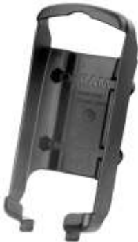
RAM-HOL-GA14 RAM HOLDER GARMIN FOR THE 76C SERIES