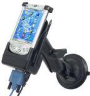
RAM-B-166-CO4P RAM SUCTION MOUNT POWERED DOCK FOR THE HP IPAQ 1900 & 4100