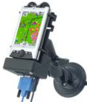
RAM-B-166-CO5P RAM SUCTION MOUNT POWERED IPAQ FAMILY