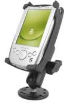
RAM-B-138-DE1 RAM MOUNT FOR DELL AXIM 5