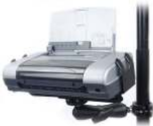
RAM-VPR-103-1 VEHICLE PRINTER SYSTEM FOR THE HP-450