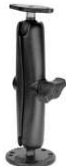
RAM-B-138U-C RAM MOUNT WITH 2.47 DIAMETER 2.47/1.31 BASE WITH C LENGTH ARM