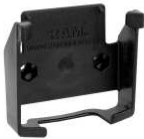
RAM-HOL-GA10 RAM HOLDER FOR THE GARMIN IQUE