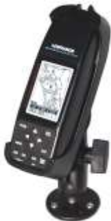
RAM-B-138-LO1 RAM MOUNT FOR THE LOWRANCE GLOBALMAP AND AIRMAP SERIES