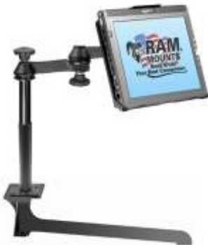
RAM-VB-154-MOT4 VEHICLE SYSTEM FOR THE 2004- NEWER NISSAN PATHINDER & XTERRA