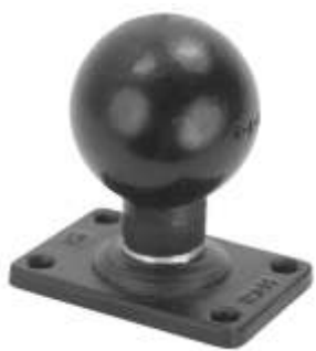
RAM-D-202U-23 RAM BASE 2" X 3" WITH 2 1/4" DIAMETER BALL