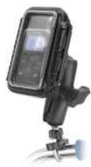
RAM-B-149Z-AQ3 RAM U-BOLT MOUNT SMALL SIZE AQUA BOX