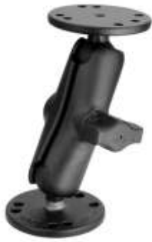
RAM-B-101 RAM MOUNT WITH 2 RAM-B-202 BASES