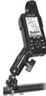
RAM-B-149Z-MA1 RAM U-BOLT MOUNT FOR THE MAGELLAN 12, 300 & 315