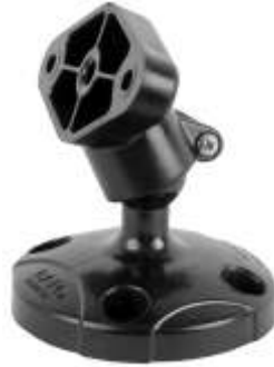
RAP-SB-190U RAM 2.5" DIA & DIAMOND BASE SNAP LINK MOUNT