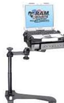
RAM-VB-135MH1-SW1 VEHICLE SYSTEM FOR THE 2006- NEWER HONDA ELEMENT