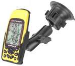
RAM-B-166-LO2 RAM SUCTION MOUNT FOR THE LOWRANCE IFINDER