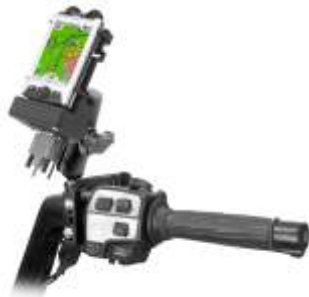
RAM-B-174-CO5P RAM BRAKE/CLUTCH RESERVOIR POWERED IPAQ FAMILY