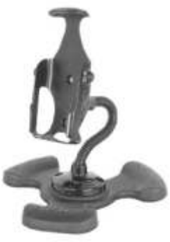
RAP-169-LO2U WEIGHT BASE WITH SOLID FLEX