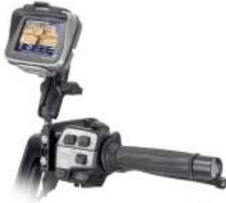
RAM-B-174-TO2U UNPKD BRAKE/CLUTCH RESERVOIR FOR THE TOMTOM RIDER