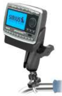
RAM-B-149Z-XM1 RAM RAIL MOUNT FOR XM SATELLITE RADIOS