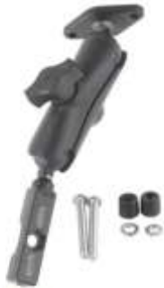
RAM-B-174-238U RAM GOLDWING WITH DIAMOND BASE