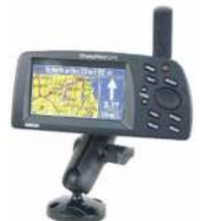
RAP-B-145U RAM MOUNT FOR THE GARMIN STREET PILOT