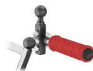
RAM-B-309-8U CLUTCH, BRAKE, UBOLT COMBO HANDLEBAR KIT