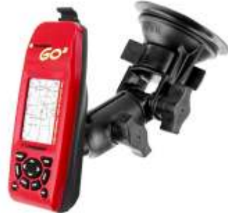
RAP-B-104-224-LO5 RAM RATCHET/PIVOT FOR THE LOWRANCE IFINDER GO