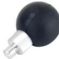
RAM-B-237 RAM 1" BALL WITH 1/4"-20 ALUMINUM STUD