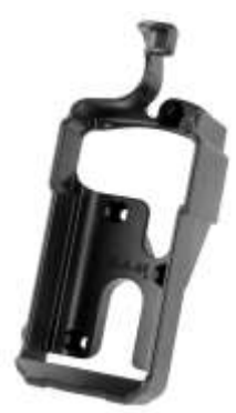
RAM-HOL-MA1 RAM HOLDER FOR THE MAGELLAN 12, 310, 315 & 320