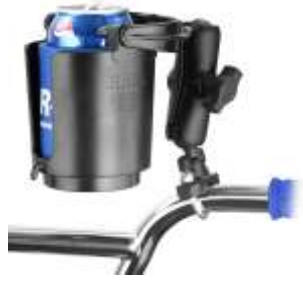
RAM-B-132RU1 RAM DRINK CUP HOLDER WITH U-BOLT BASE