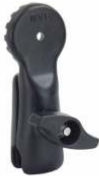
RAM-D-162BAU RAM RATCHET BASE WITH SINGLE SOCKET ARM