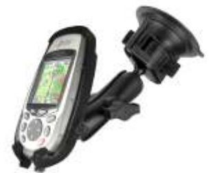
RAM-B-166-MA2 RAM SUCTION MOUNT FOR THE MAGELLAN MERIDIAN