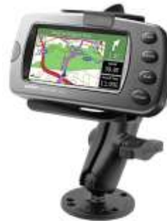
RAM-B-138-GA9 RAM MOUNT FOR GARMIN STREETPILOT SERIES