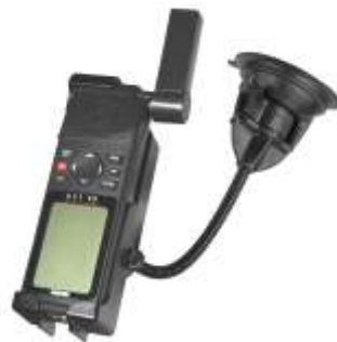
RAP-105-6224-GA3 RAM FLEX ARM MOUNT FOR THE GARMIN 48, 45, 89 & 90