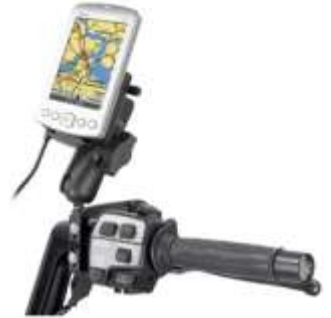
RAM-B-174-GA11 RAM BRAKE/CLUTCH RESERVOIR GARMIN ADAPTER