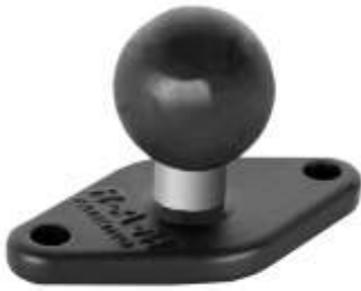
RAM-B-238U-500 500 BULK 2-7/16" X1-5/16" BASES WITH BALL