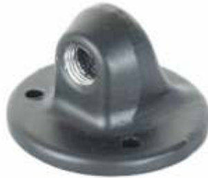
RAM-B-232-0 RAM 2.5 DIAMETER BASE WITH 1/4" NPT HOLE 0 DEGREE