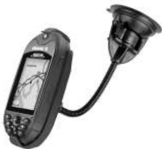
RAP-105-6224-MA6 RAM FLEX ARM MOUNT FOR THE MAGELLAN EXPLORIST XL