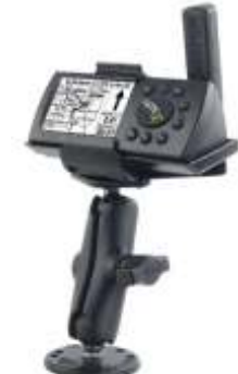
RAM-B-138-GA2 RAM MOUNT FOR GARMIN GPS II & III SERIES