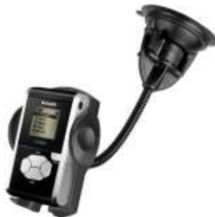
RAP-105-6224-UN1 RAM UNIVERSAL FLEX ARM MOUNT FOR SMALL SIZE DEVICES