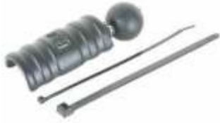
RAM-226 RAM UMBRELLA SADDLE