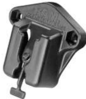
RAP-304 RAM LOCKING BELT CLIP BASE