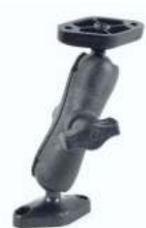
RAP-B-102 RAM DOUBLE BALL MOUNT WITH DIAMOND BASES