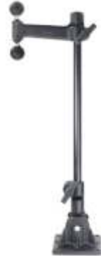
RAM-101U-VE3 RAM MOUNT VELOCITI