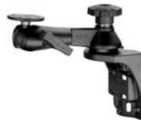
RAM-109V-3U RAM SWING ARM WITH VERTICAL BASE & BALL