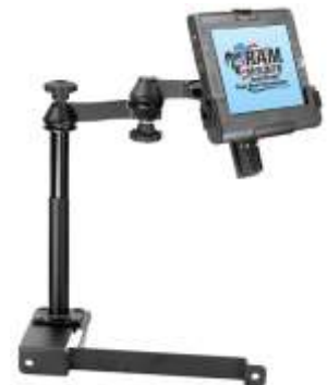
RAM-VB-155-MOT1 VEHICLE SYSTEM FOR THE 2006- NEWER HONDA CIVIC