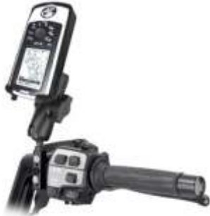
RAM-B-174-GA6 RAM BRAKE/CLUTCH RESERVOIR FOR THE GARMIN 76 & 76CSX