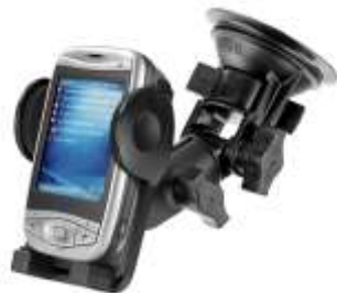
RAP-B-104-224-UN2 RAM UNIVERSAL RATCHET/PIVOT MOUNT FOR MEDIUM SIZE DEVICES