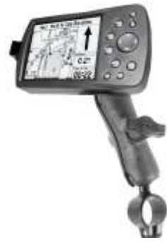
RAP-B-149-GA7 RAM RAIL MOUNT FOR THE GARMIN GPS 176, 276 & 296