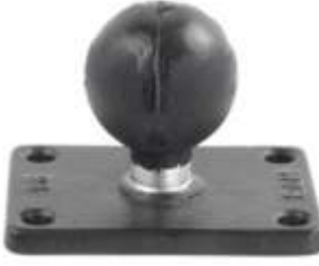
RAM-202U-23 RAM BASE 2" X 3" WITH 1 1/2" BALL