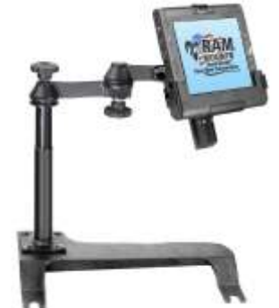
RAM-VB-131R4-MOT1 VEHICLE SYSTEM FOR THE 2000- NEWER 2500 & 3500 SU POWER