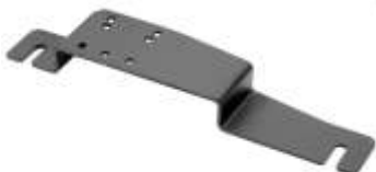
RAM-VB-161 VEHICLE BASE FOR THE 2006-NEWER FORD 500 & FREESTYLE