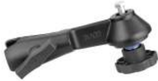
RAM-VB-109-2U RAM SWING ARM WITH SOCKET