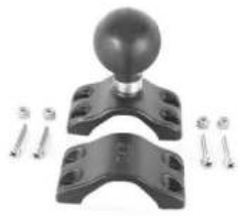
RAM-D-271U-2 RAM 2" - 2 1/2" DIAMETER RAIL BASE WITH BALL