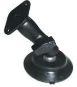
RAM-B-148 RAM SUCTION MOUNT. WITH 2.43 DIAMETER & 2.43 X 1.3 BASES