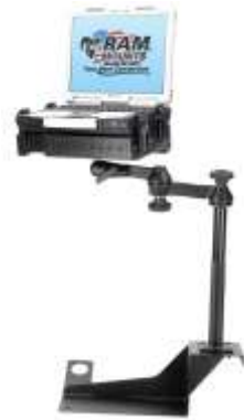
RAM-VB-108-SW1 VEHICLE SYSTEM FOR THE 2000- NEWER EXCURSION & 1999-NEWER F250