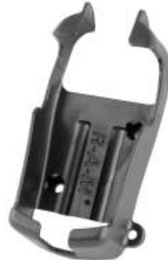
RAM-HOL-GA5 RAM HOLDER FOR THE GARMIN E- TREX