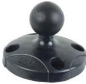
RAP-B-202 RAM 2 1/2" DIAMETER BASE WITH 1" BALL