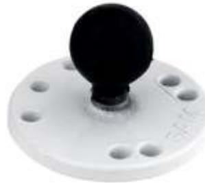
RAM-B-202WU WHITE RAM 2 7/16" DIAMETER BASE WITH 1" BALL